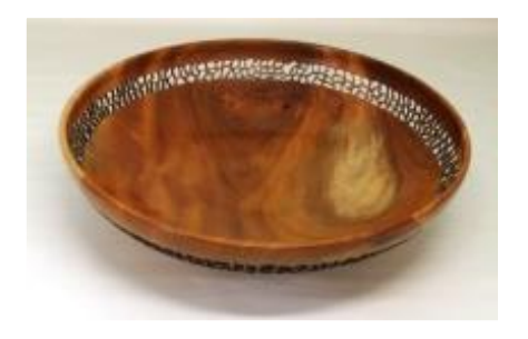
Paul Sandle, Bowl with piercing, 10, Fl mahogany