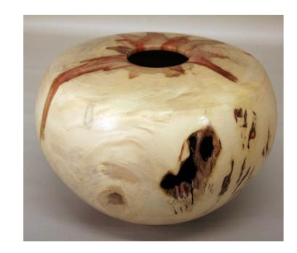
Eliot Feldman, Hollow form, 5x7, Box Elder