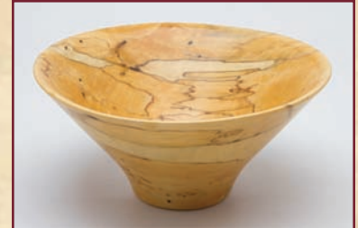
6" x 2 3 / 4 " BOWL [SPALTED HOLLY]