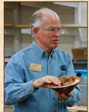
8 1 / 2 " x 2 7 / 8 " VORTEX VESSEL [SPALTED MAPLE]