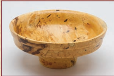
6" x 2" FOOTED BOWL [SPALTED HOLLY]