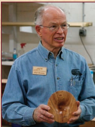
6 1 / 4 " x 2 3 / 4 " VORTEX VESSEL [APPLE]