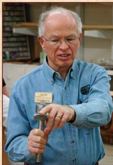
SHOP-MADE TOOL REST