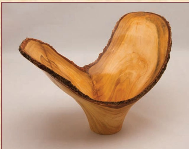
TIM ALEY 12" x 3½" NATURAL-EDGE WINGED BOWL [APRICOT]