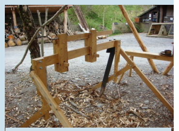
Spring Pole Lathe