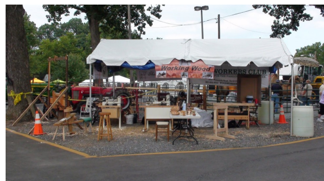
MCW's 2011 Demonstration Area