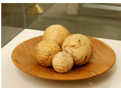
By Clif Poodry