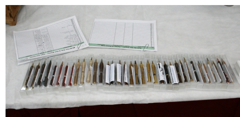
Some of the results!