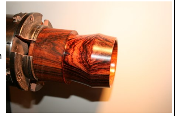
(Continued on page 19)

I then used the remaining part of the original blank to turn a separate cover about ¼-inch thick for the bottom of the cup, again using the Forstner bit to