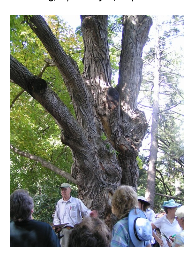
Montgomery County Champion Sugar Maple Tree

Always use common sense. Things that work in one situation may not work in another. Follow all Safety Rules. If it feels wrong, it probably is; stop and rethink. Your Mileage May Vary