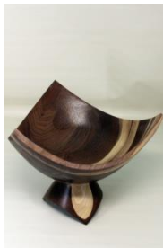
Bob Grudberg, Try sq, 10x8, Walnut