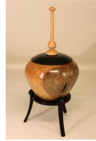
Paul Sandler, Hollow form on stand, 6, Lacewood