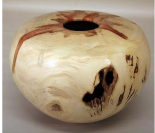
Eliot Feldman, Hollow form, 5x7, Box Elder