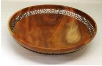
Paul Sandle, Bowl with piercing, 10, Fl mahogany