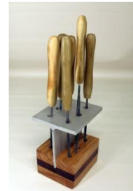
Michael Morse, Jewelers file set, 3x4, Oak, Black Walnut, Poplar