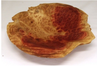
11 x 3 bowl - burl