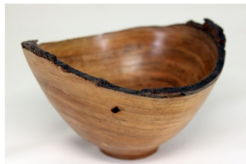
6 x 5 natural edge bowl - black cherry