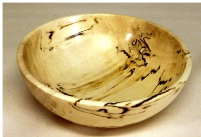
5 1/2 x 2 bowl - spalted holly