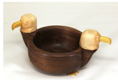
5 x 4 double eagle bowl walnut