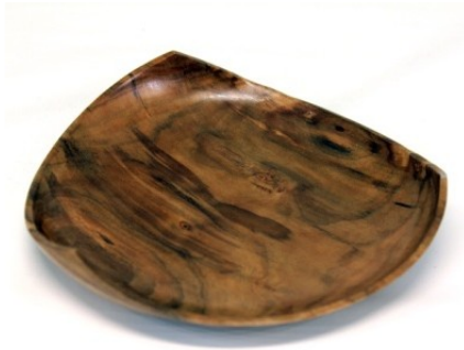
6 x 1 candy dish - cherry