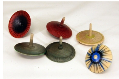
1 x 1 painted tops - maple