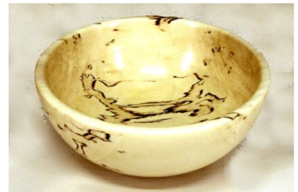
6 1/2 x 2 1/2 bowl - spalted holly