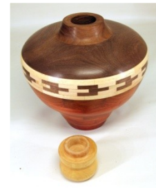
9 x 8 urn red heart