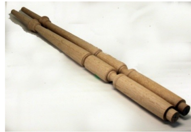
2 x 33 2 balustrades white oak