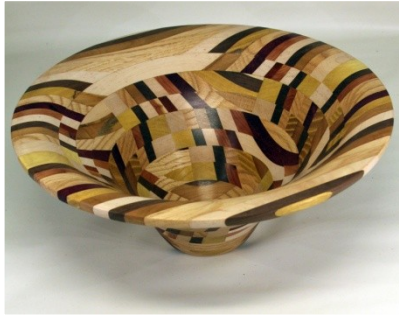
13 x 6 bowl from a board assorted woods