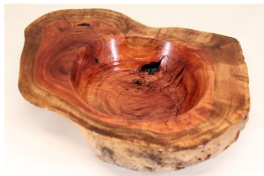
8 x 10 bowl red gum burl