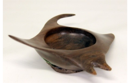
8 x 1 1/2 manta bowl - maple 7 x 1 1/2 manta bowl walnut