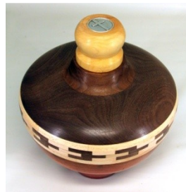
9 x 8 urn red heart