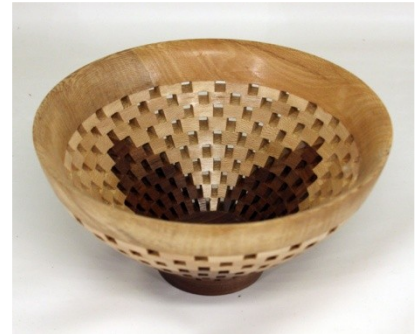
8 x 5 bowl walnut