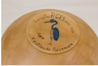
Tim Aley 5 x 3 bowl (sycamore) (c)