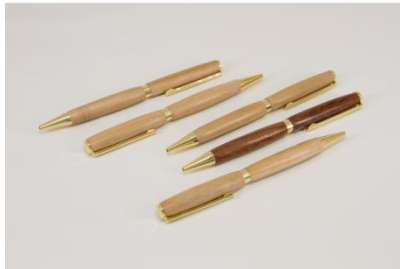
Stephen Price 5 pens for turn for the troops!