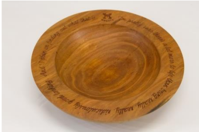
Matt Radtke 7 x 2 inscribed bowl (cherry) Zoolander (b)