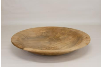
Stephen Price 12 x 2 bowl (wood) (a)