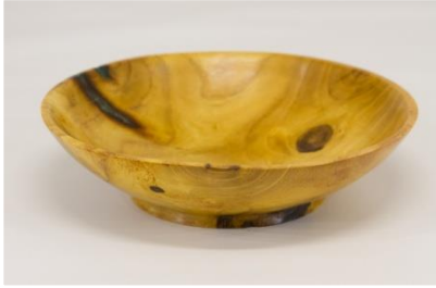
Joe Barnard 5 x 1 bowl (Kentucky coffeewood) (a)