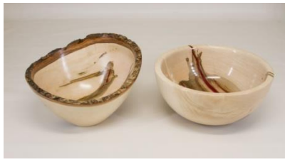
William Flint 6 x 2.5 2 bowl (maple) (d)