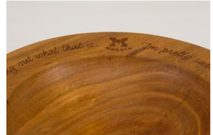
Matt Radtke 7 x 2 inscribed bowl (cherry) (c)