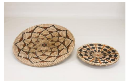
Richard Webster basket illusion (maple) (b)