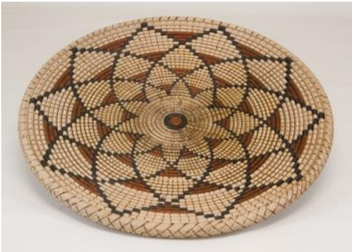
Richard Webster 10” basket illusion platter (maple)