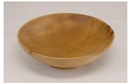
Tim Aley 5 x 3 bowl (sycamore) (a)