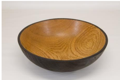
Gary Guenther 9.5 x 4 bowl (charred oak) (b)