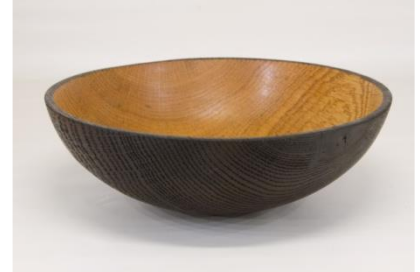
Gary Guenther 9.5 x 4 bowl (charred oak) (a)