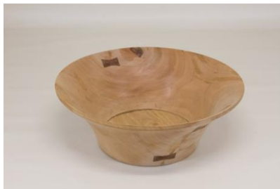
Joe Barnard 10 x 3 fluted bowl (Basswood)