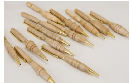
Jeff Tate slimline pens 88-101 for TFTT!!! (a)