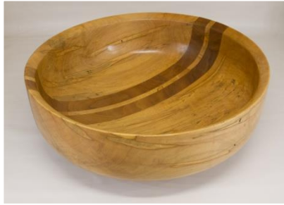
Benji Omasore 16 x 5 bowl with insert (maple walnut)