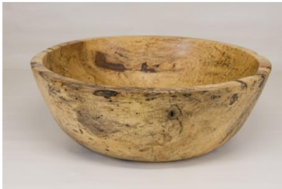
Stephen Price 12 x 4 bowl (spalted maple) (b)