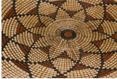
Richard Webster 10 basket illusion platter (maple) (b)