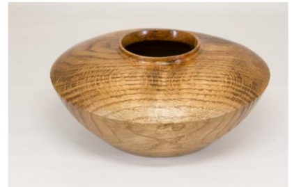
Steve Haddix 8.5 x 4 hollow form (oak)