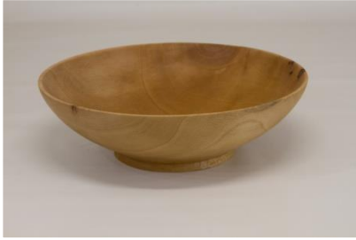
Tim Aley 5 x 3 bowl (sycamore) (b)