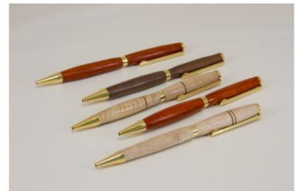
Paul Wodiska 5 pens for TFFT