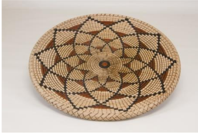
Richard Webster 10 basket illusion platter (maple) (a)