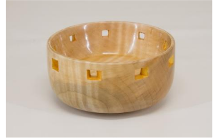
Tina Chisena 4 x 2 bowl (curly maple) (bring back challenge) (a)