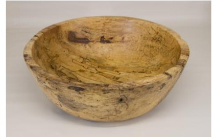
Stephen Price 12 x 4 bowl (spalted maple) (a)