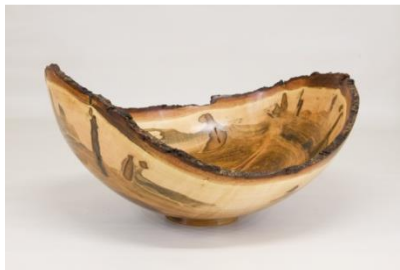
Steve Haddix 9 x 10 Natural edge bowl (maple) (b)