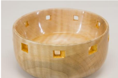
Tina Chisena 4 x 2 bowl (curly maple) (bring back challenge) (b)