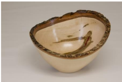
William Flint 6 x 2.5 bowl (maple) (a)