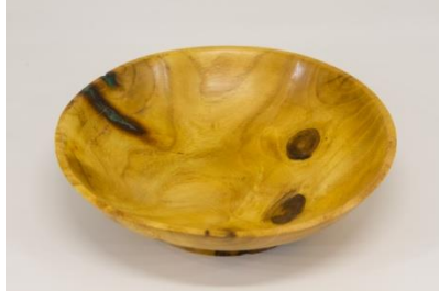
Joe Barnard 5 x 1 bowl (Kentucky coffeewood) (b)