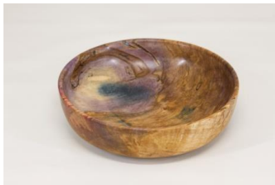
Michael Colella 6 x 3 bowl (spalted maple stabilized with colored Cactus Juice)