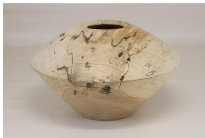
Paul Wodiska hollow form (b)