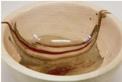
William Flint 6 x 2.5 bowl (maple) (c)