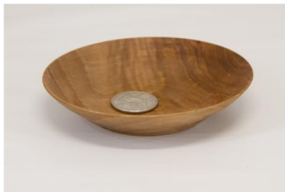
Ellen Davis 4 x 1 Coin dish with a story (cherry)