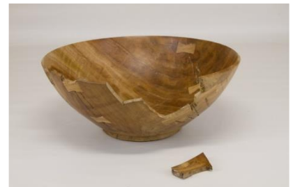
Joe Barnard 10 x 4 shattered bowl (chestnut)