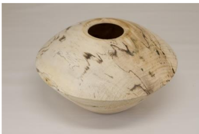
Paul Wodiska hollow form (a)