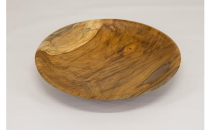
Joe Barnard 7 x 1 bowl (cherry)