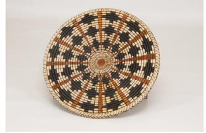
Richard Webster 7 basket illusion platter (maple) (a)