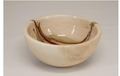
William Flint 6 x 2.5 bowl (maple) (b)