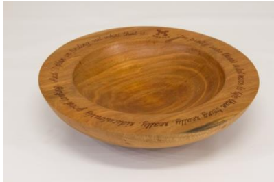
Matt Radtke 7 x 2 inscribed bowl (cherry) (a)