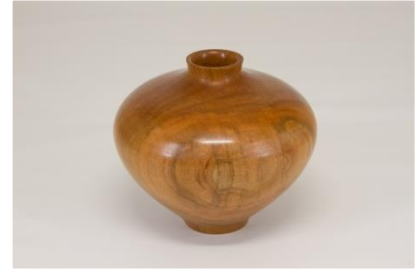
Eliot Feldman 4 x 4 hollow form (cherry)