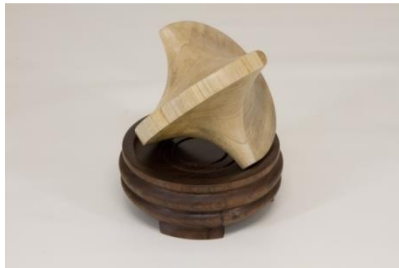
Gary Guenther 9.5 x 4 sphericon on a pedestal (sycamore walnut) (a)