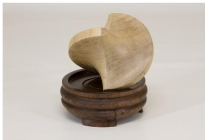
Gary Guenther 3 sphericon on a pedestal (sycamore walnut) (b)