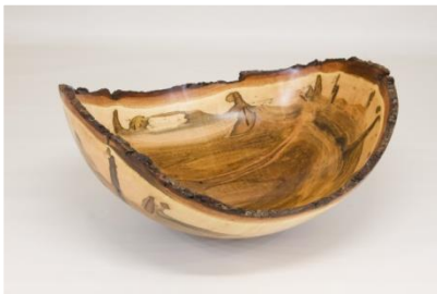
Steve Haddix 9 x 10 Natural edge bowl (maple) (a)