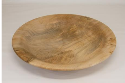
Stephen Price 12 x 2 bowl (wood) (b)