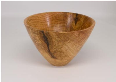
Tim Aley 6 1/4 x 4 bowl oak