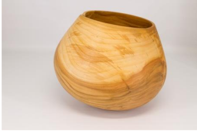
Jim Allison 9 x 7 1/2 hollow form Yoshino Cherry