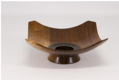
Steve Haddix 6" x 2" four sided bowl winged bowl tealight [walnut]