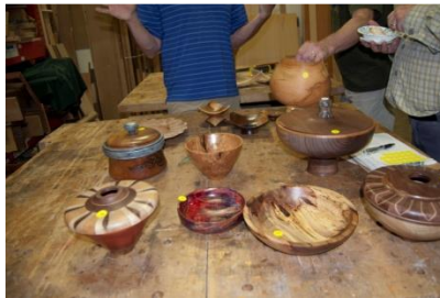
items ready to be photographed.