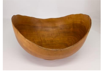
Bill Long 11 1/2 x 6 1/4 natural edge bowl black cherry