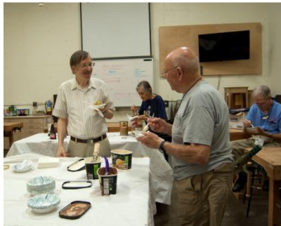
the ice cream is going fast.