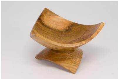
Steve Haddix arrow through apple walnut poplar