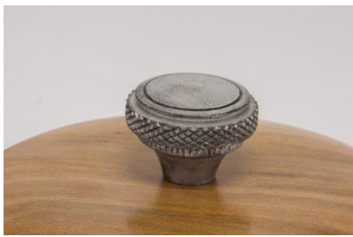
Steve Haddix 7 1/2 x 5 Beads of Courage box cherry