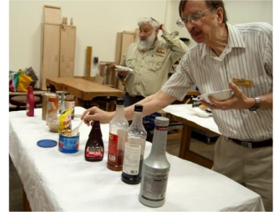
So many toppings!