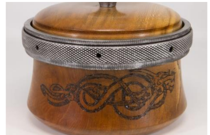
Steve Haddix 7 1/2 x 5 Beads of Courage box cherry