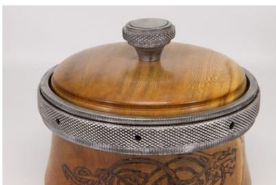
Steve Haddix 7 1/2 x 5 Beads of Courage box cherry