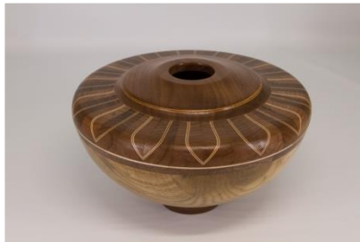
Bob Grudberg 8 x 4 1/2 hollow form walnut