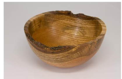
Gary Guenther 7 x 3 1/2 hybrid rim