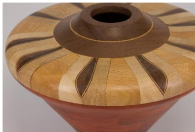
Bob Grudberg 7 1/2 x 4 1/2 hollow form walnut