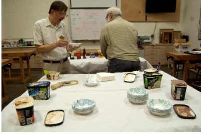
Cold ice cream for a hot July night.