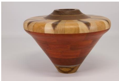
Bob Grudberg 7 1/2 x 4 1/2 hollow form walnut