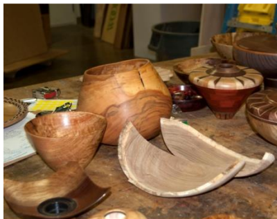
Sometimes you have to cut a bowl to see how you are doing.