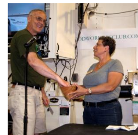
Time to pick the Bring Back winner.