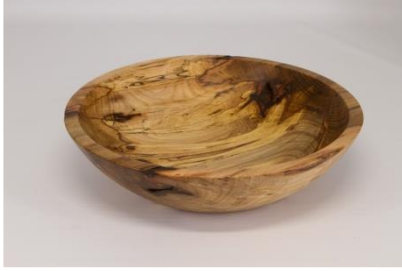
Jeff Struewing 9 x 2 1/2 bowl hickory