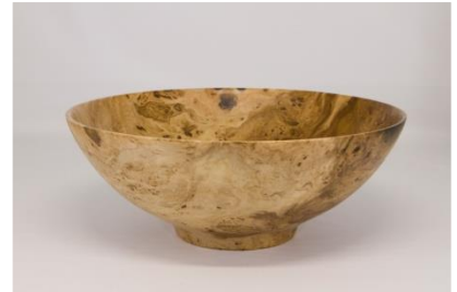
Bill Long & Jeff Tate 10 x 4 bowl black poplar burl