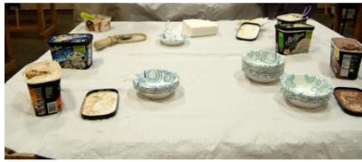
Quite a spread.