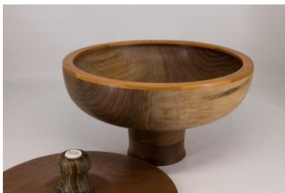
Bob Grudberg 11 x 6 1/2 Beads of Courage Box walnut