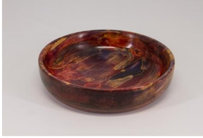
Mike Colella 6 x 1 1/2 bowl resin colored maple