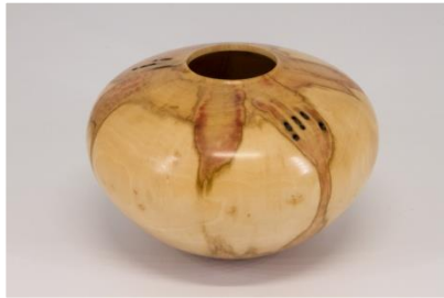
Gary Guenther 4 x 2 5/8 hollow form box elder