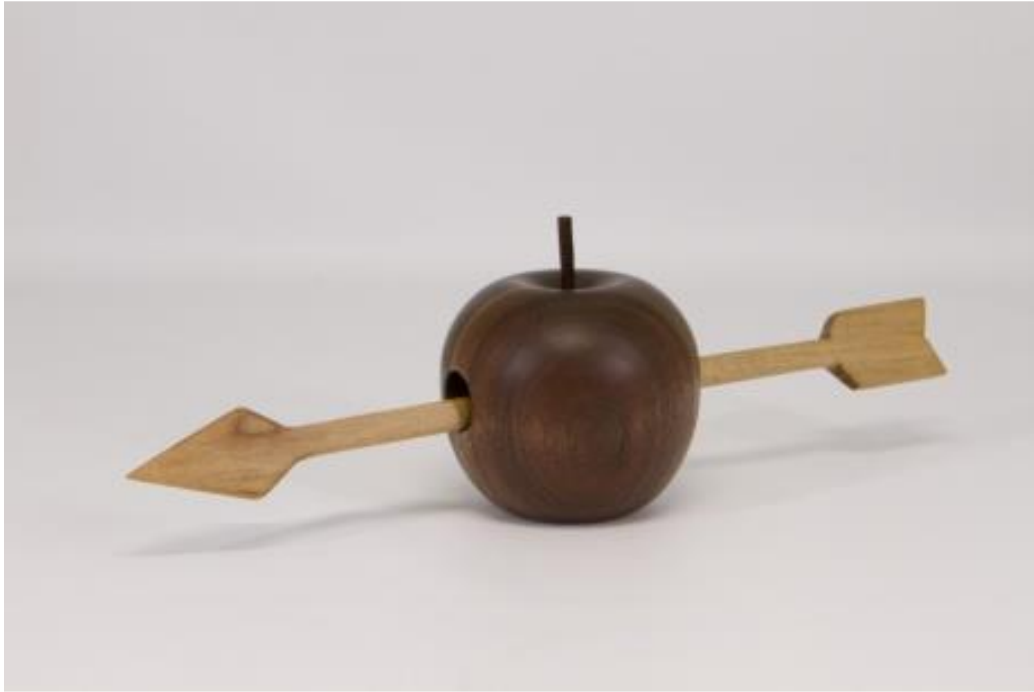
Steve Haddix - Arrow through apple [walnut, poplar]