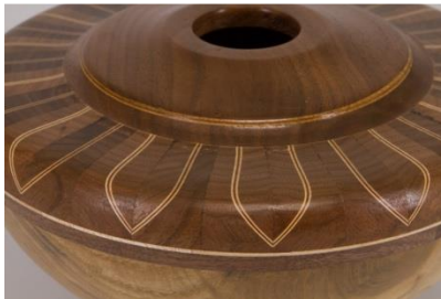
Bob Grudberg 8 x 4 1/2 hollow form walnut