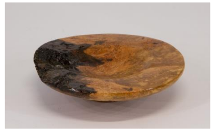
Tim Aley 3 1/2 x 1/2 bowl oak