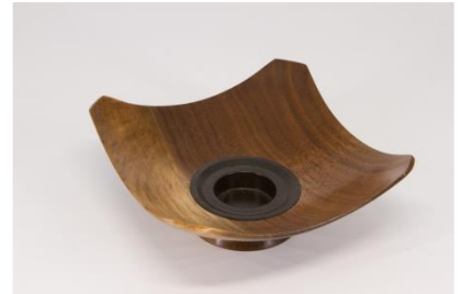
Steve Haddix 6" x 2" four sided bowl winged bowl tealight [walnut]