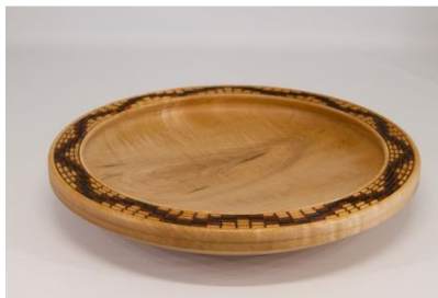
Richard Webster 11 x 2 platter with basket edge maple