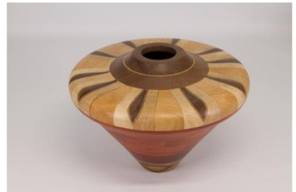
Bob Grudberg 7 1/2 x 4 1/2 hollow form walnut