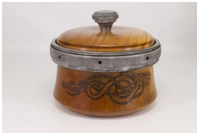
Steve Haddix 7 1/2 x 5 Beads of Courage box cherry