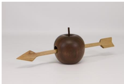
Steve Haddix arrow through apple [walnut, poplar]