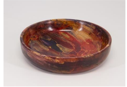
Mike Colella 6 x 1 1/2 bowl resin colored maple