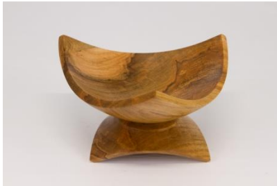
Steve Haddix 5 1/2 x 3 three sided bowl maple