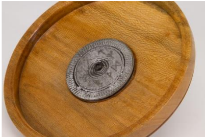
Steve Haddix 7 1/2 x 5 Beads of Courage box cherry