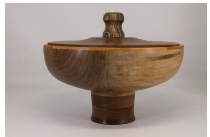
Bob Grudberg 11 x 6 1/2 Beads of Courage Box walnut