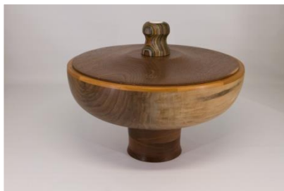
Bob Grudberg 11 x 6 1/2 Beads of Courage Box walnut