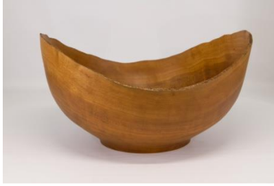
Bill Long 11 1/2 x 6 1/4 natural edge bowl black cherry