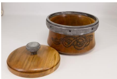
Steve Haddix 7 1/2 x 5 Beads of Courage box cherry