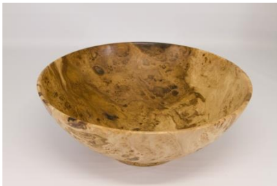
Bill Long & Jeff Tate 10 x 4 bowl black poplar burl