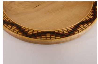
Richard Webster 11 x 2 platter with basket edge maple