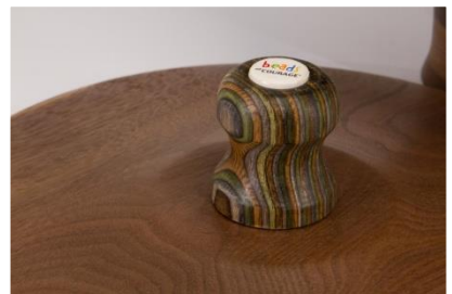
Bob Grudberg 11 x 6 1/2 Beads of Courage Box walnut