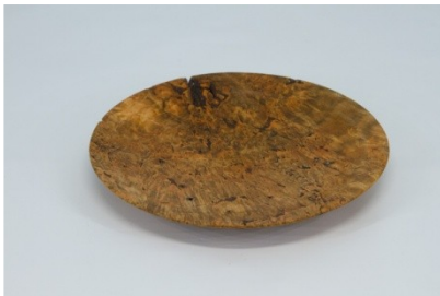
Tim Aley 5 x.5 nested bowls (red maple burl) (e)