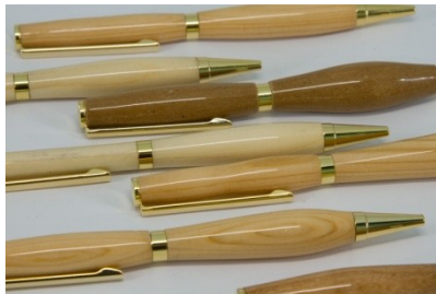
Dean Elliott 7 pens (maple Trex pine 2x4) (b)