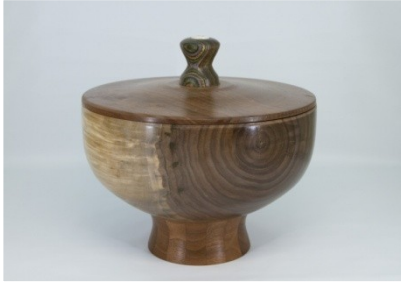
Bob Grudberg 10 x 10 Beads of Courage Box (walnut) (a)