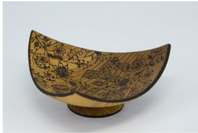
Steve Haddix 5 x 5 3 corner bowl (black locust) (a)