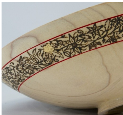
Steve Haddix 9.5 x 2.5 star bowl with pyro (poplar acrylic paint goldleaf) (c)