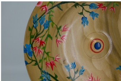
Ken Poirier 12 dia Platter (poplar 1 stroke painting) (b)