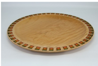
Richard Webster 15 x 1 platter