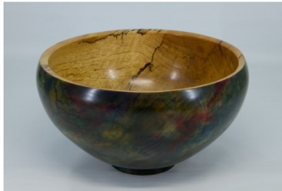
Steve Haddix 8.25 x 5.25 bowl of many colors (spalted maple paint) (b)