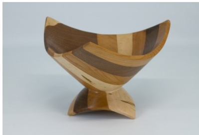
Bob Grudberg 6 x 6 3 corner bowl (mix) (a)