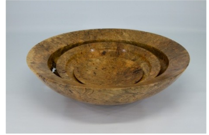
Tim Aley 12 x 3.5 8.25 x 2 5 x.5 nested bowls (red maple burl) (a)