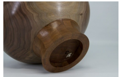
Bob Grudberg 10 x 10 Beads of Courage Box (walnut and music box) (d)