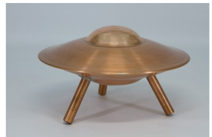
William Flint fleet of UFO's (copper) (c)