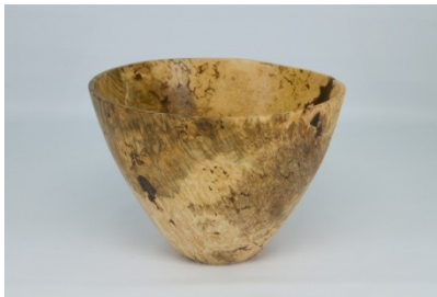
Tim Aley 7 x 5 bowl (red maple burl)