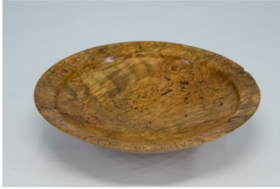
Tim Aley 8.25 x 2 nested bowls (red maple burl) (d)