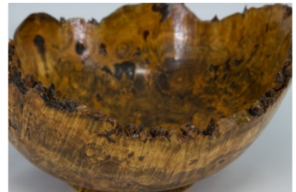
Tim Aley 7 x 5 natural edge bowl (red maple burl) (b)