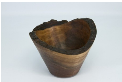
Ellen Davis 6.5 x 4.5 bowl (Walnut)