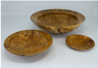
Tim Aley 12 x 3.5 8.25 x 2 5 x.5 nested bowls (red maple burl) (b)