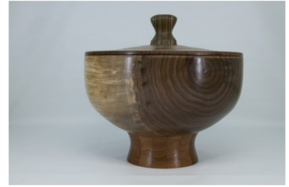
Bob Grudberg 10 x 10 Beads of Courage Box (walnut) (c)