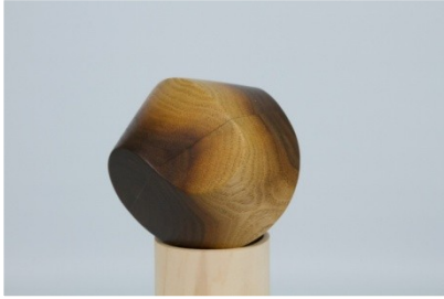
Gary Guenther 2.25 flat-to-flat hexasphericon (walnut on temp stand) (c)