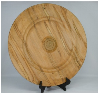
Ken Poirier 20 dia Platter (Ambrosia)