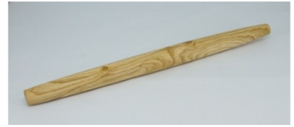
Joe Barnard 16.5 x 1 rolling pin (chestnut)