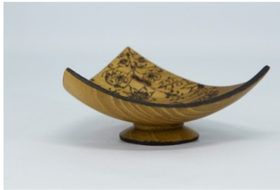
Steve Haddix 5 x 5 3 corner bowl (black locust) (b)