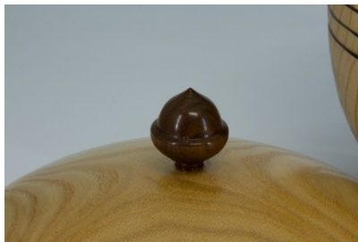
Bob Browning 7.5 x 7.5 Beads of Courage box (Paulownia) (c)