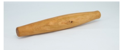
Ellen Davis 12 x 2 rolling pin (Cherry)