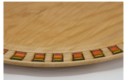
Richard Webster 15 x 1 platter