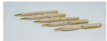
Steve Price 5 pens TFFT (maple)