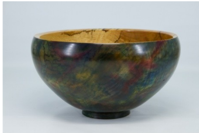
Steve Haddix 8.25 x 5.25 bowl of many colors (spalted maple paint) (a)