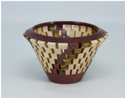
Bob Grudberg 4 x 4 open segmented corner bowl (mix)