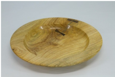
Joe Barnard 9 x 1 plate (yellowwood) (a)