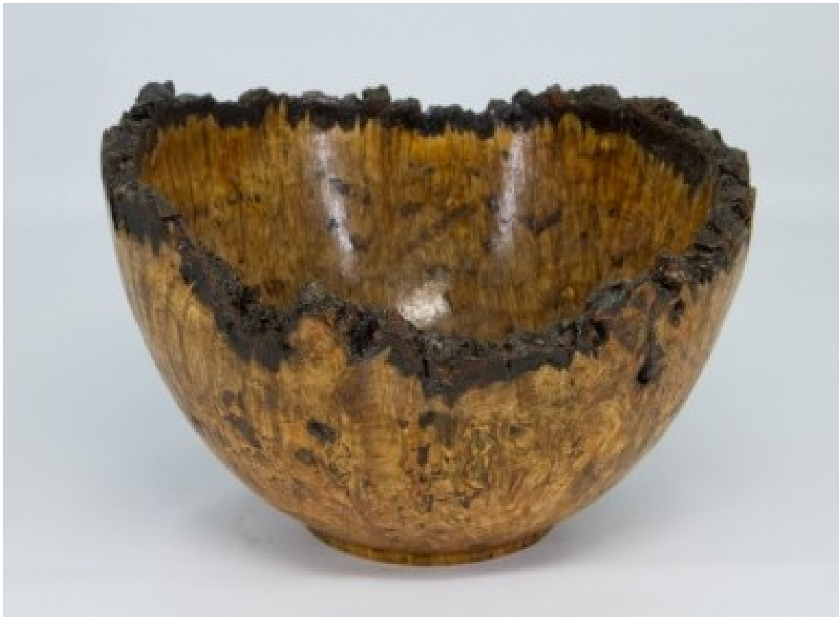
Tim Aley 8 x 5 natural edge bowl (red maple burl)