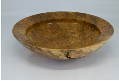
Tim Aley 12 x 3.5 nested bowls (red maple burl) (c)