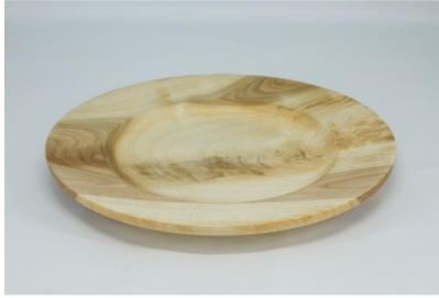
Joe Barnard 10.25 x 1 plate (maple crotch)