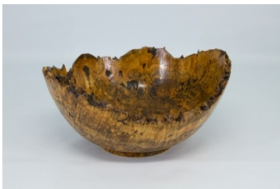
Tim Aley 8 x 5 natural edge bowl (red maple burl) (a)