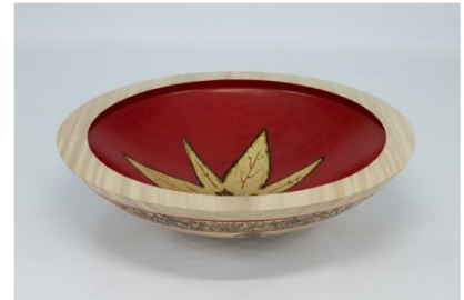
Steve Haddix 9.5 x 2.5 star bowl with pyro (poplar acrylic paint goldleaf) (a)