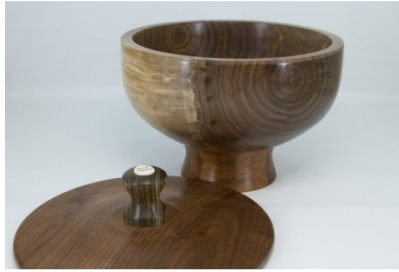
Bob Grudberg 10 x 10 Beads of Courage Box (walnut) (b)