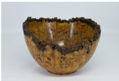
Tim Aley 8 x 5 natural edge bowl (red maple burl)