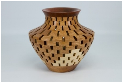
Bob Grudberg 6 x 7 open segmented corner bowl (mix)