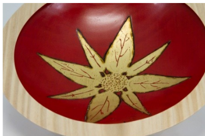
Steve Haddix 9.5 x 2.5 star bowl with pyro (poplar acrylic paint goldleaf) (b)