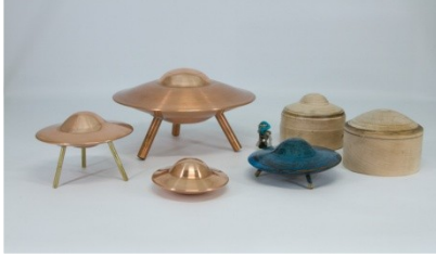
William Flint's fleet of UFO's [copper] and patterns used for spinning the copper.