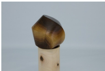
Gary Guenther 2.25 flat-to-flat hexasphericon (walnut on temp stand) (a)