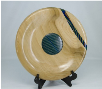
Ken Poirier 12 dia Platter (poplar) (a)