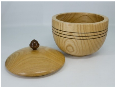
Bob Browning 7.5 x 7.5 Beads of Courage box (Paulownia) (b)