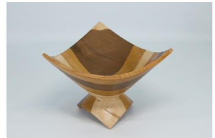
Bob Grudberg 6 x 6 3 corner bowl (mix) (b)