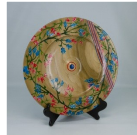
Ken Poirier 12 dia Platter (poplar 1 stroke painting) (a)