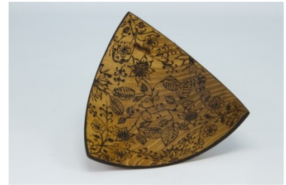
Steve Haddix 5 x 5 3 corner bowl (black locust) (c)