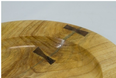
Joe Barnard 9 x 1 plate (yellowwood) (b)