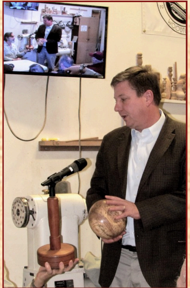
William Flint 7" x 4" semi-closed hollow form [spalted oak]