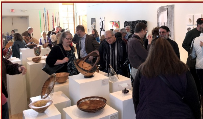
EXHIBIT ON VIEW: January 13 – February 24, 2018 The Kay Gallery at BlackRock Center for the Arts. 12901 Town Commons Drive, Germantown, MD 20874