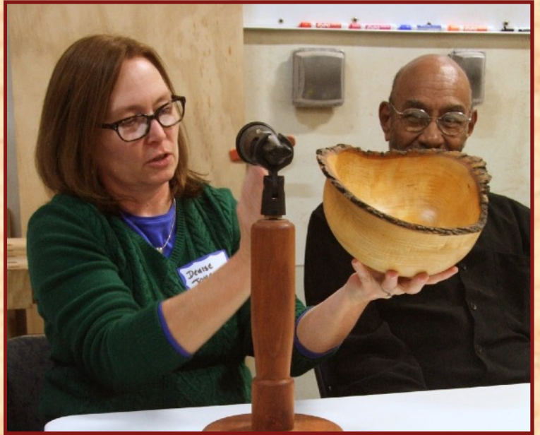
Richard Webster 10" x 5" Natural edge bowl [ash]