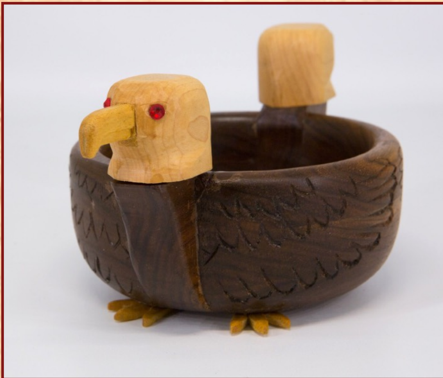
John Laffan 4" x 4" double eagle bowl [walnut, maple, yellowwood]