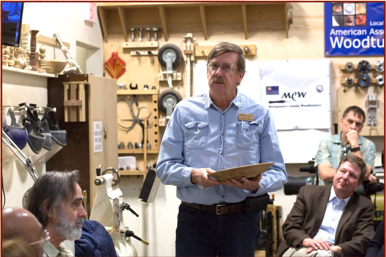
Stephen Price 12" x 2" platter [maple]