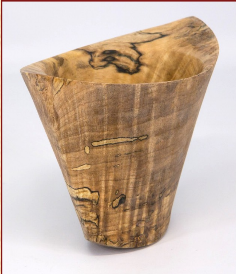
BEST IN SHOW! According to panelist Joe Dickey. Good job Tim.