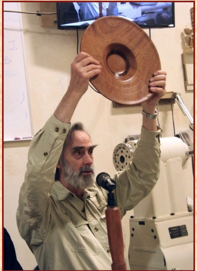
Rich Foa 14" x 2" bowl [mahogany, walnut]