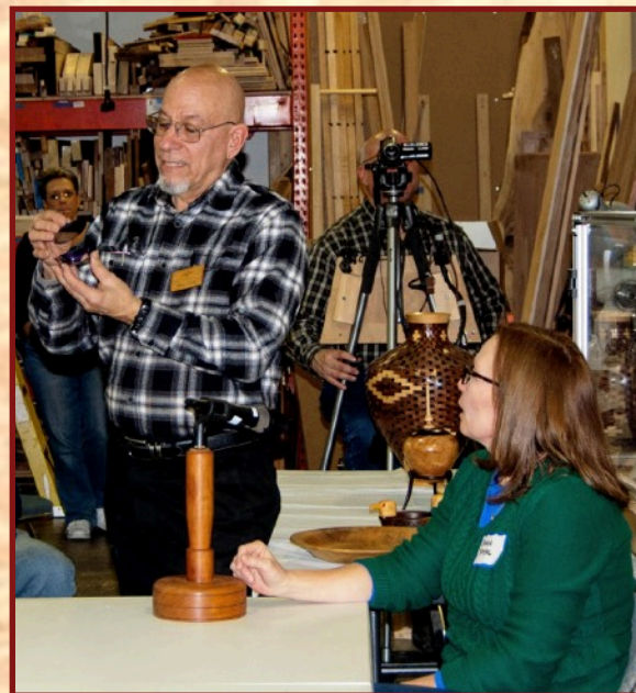
Michael Colella 2" x 2" Purple Box, stabilized with purple Cactus juice. [sycamore]