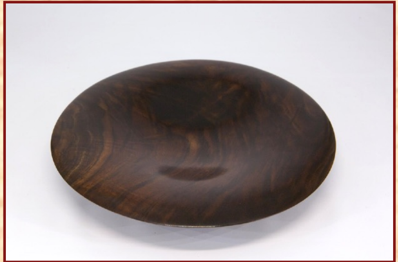
Joe Barnard 10 1/2" x 3" Plate-bowl conundrum [walnut root]