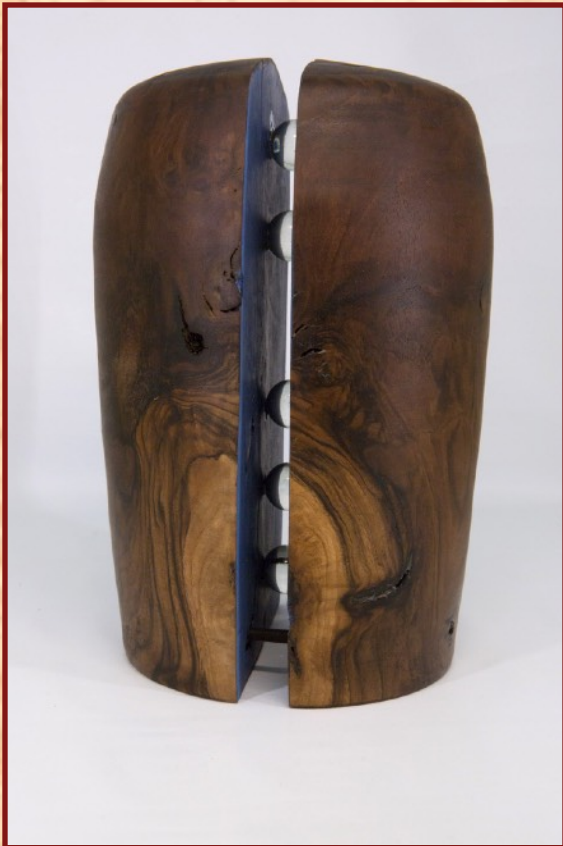
Joe Clark 13" x 8" sculpture [walnut veneer core, ebony, clear rock marbles, paint]