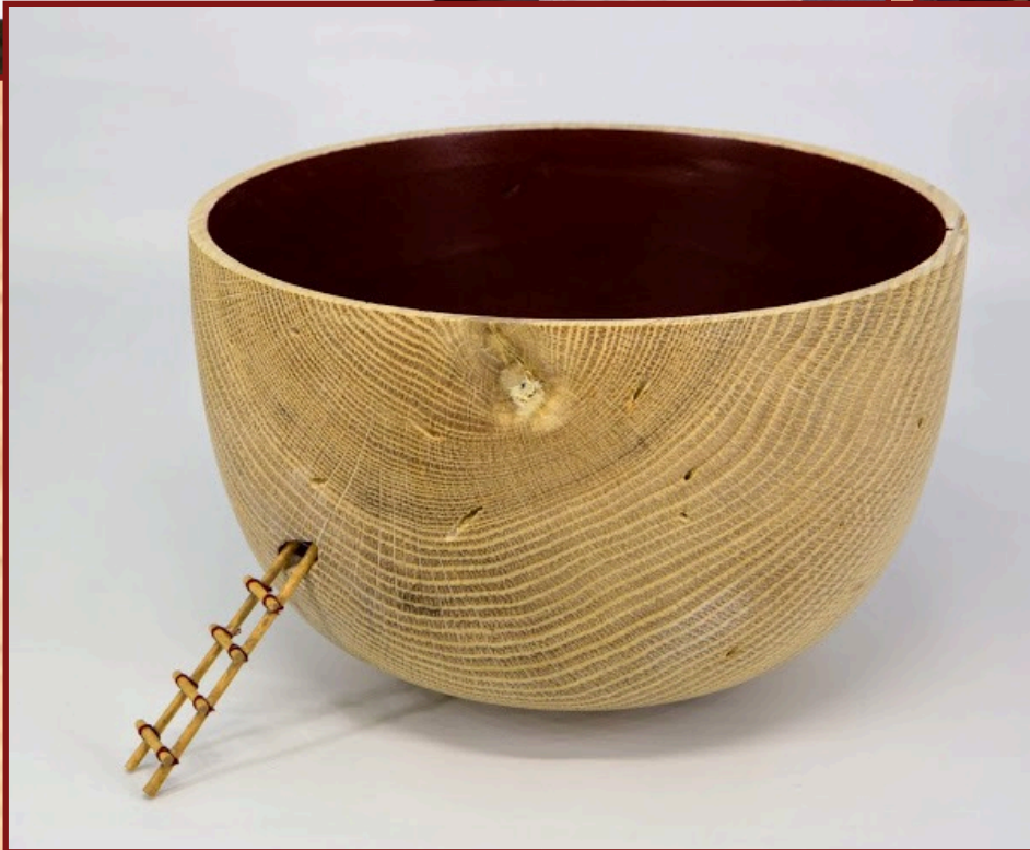
Gary Guenther 7 1/4" x 4 5/8" "kiva" bowl [bleached red oak, acrylic paint, stone, poplar, thread]