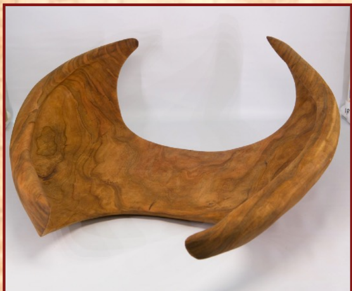
Benji Omisore 20" x 20" wall sculpture [bradford pear]