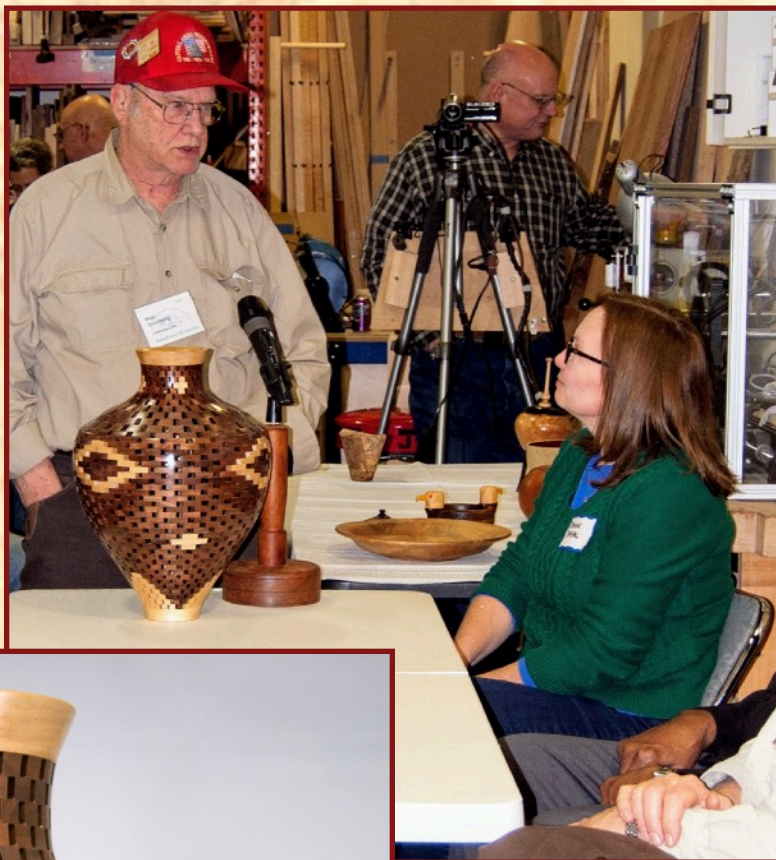
Bob Grudberg 18" x 10" open segmented vase [walnut, maple]