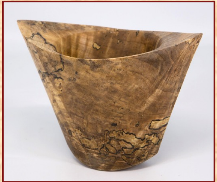
Tim Aley 6" x 3 1/2" x 4" bowl [spalted red maple]