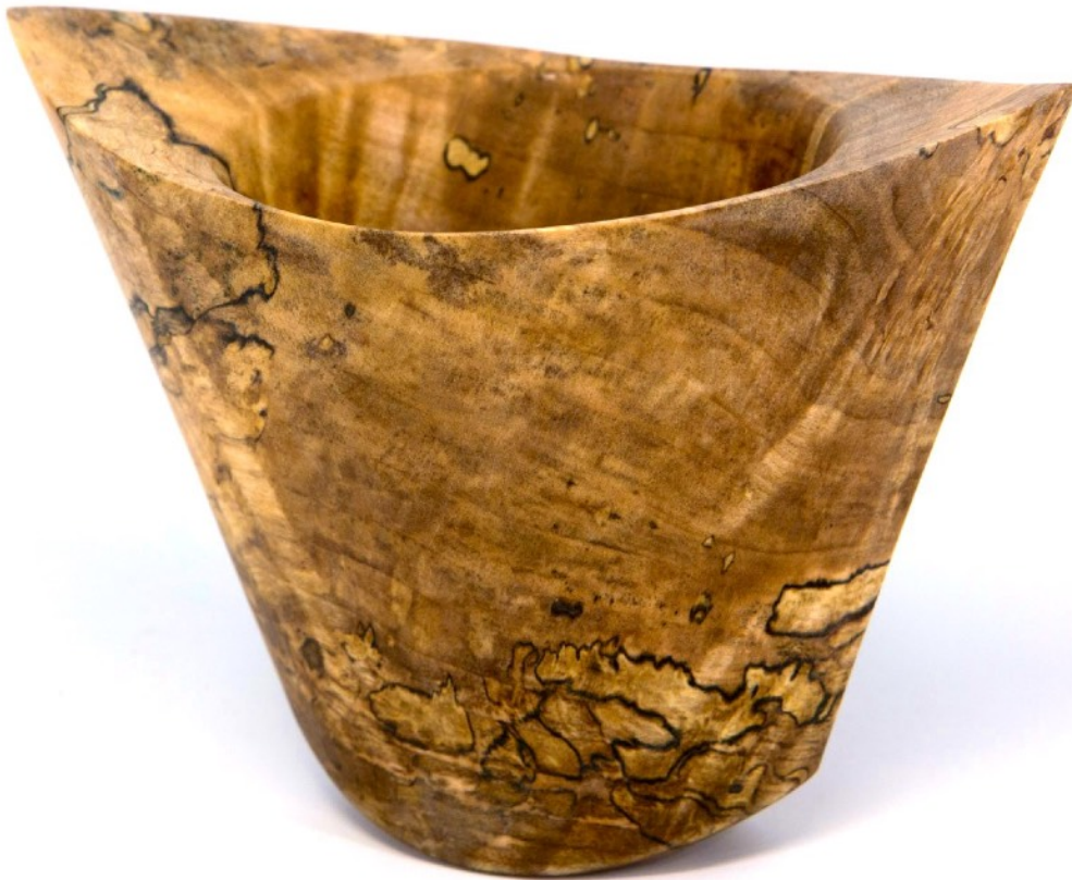
Spalted Red maple, multi axis turned, 6"x3.5"x4" Tim Aley, 2018