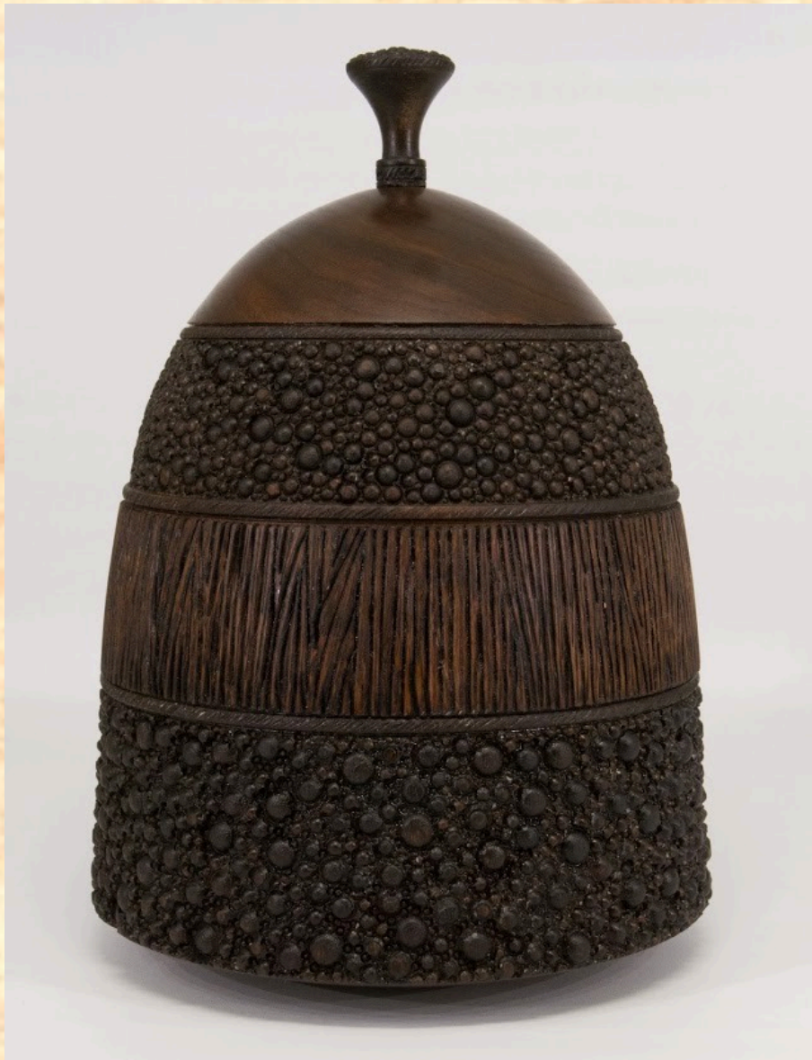
Steve Haddix 6" x 9" textured box [walnut]