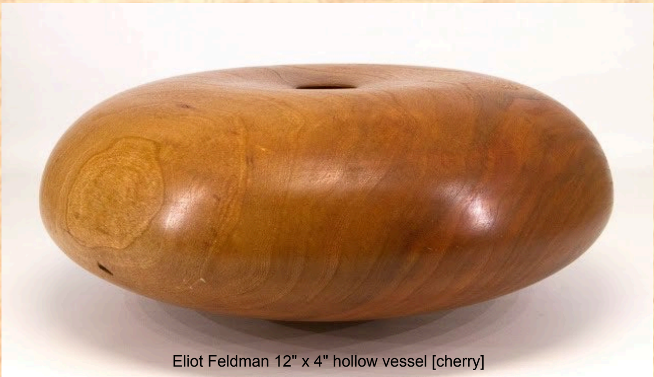
Eliot Feldman 12" x 4" hollow vessel [cherry]