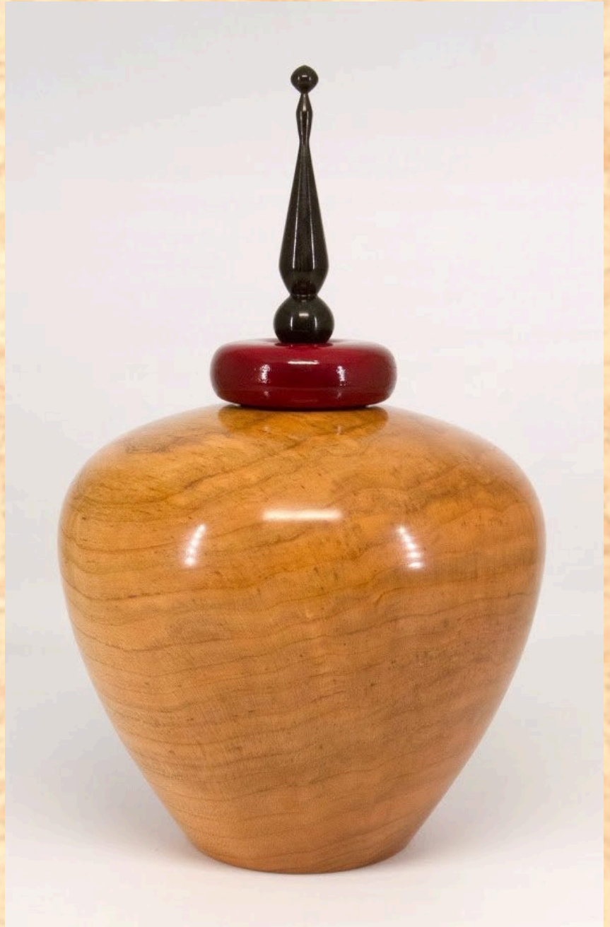
William Flint 7" x 12" Urn [cherry, ash, ebony]