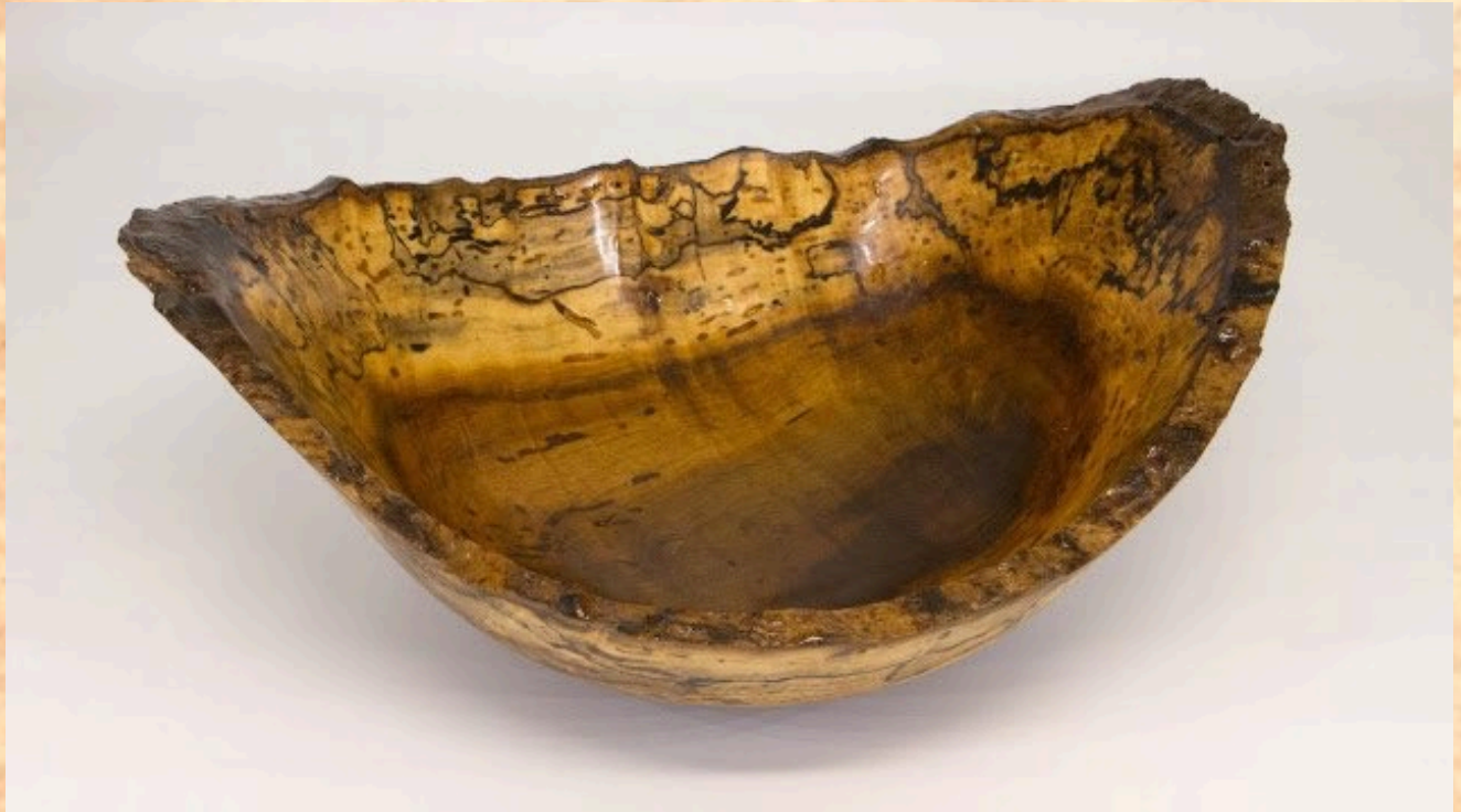
Joe Barnard medium natural edge bowl [spalted bug wood]