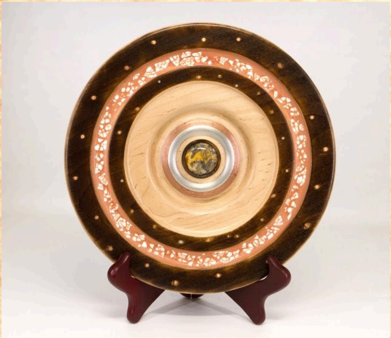
Ellen Davis 9 1/2" x 2" platter [ambrosia maple, copper, stone, pewter]