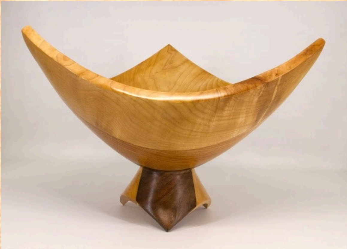
Bob Grudberg 11" x 9" three corner bowl [walnut, maple]