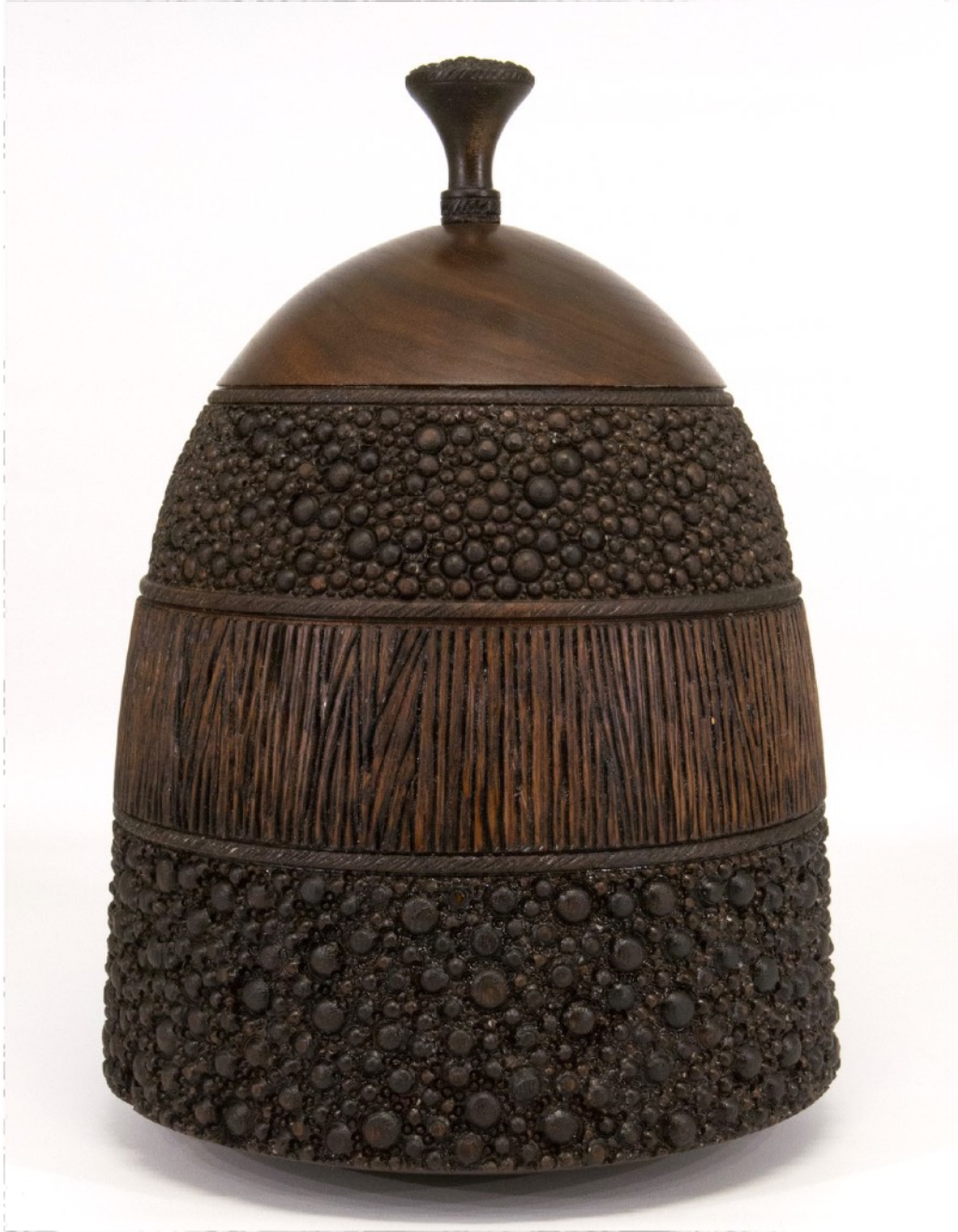
Steve Haddix 6" x 9" textured box [walnut]