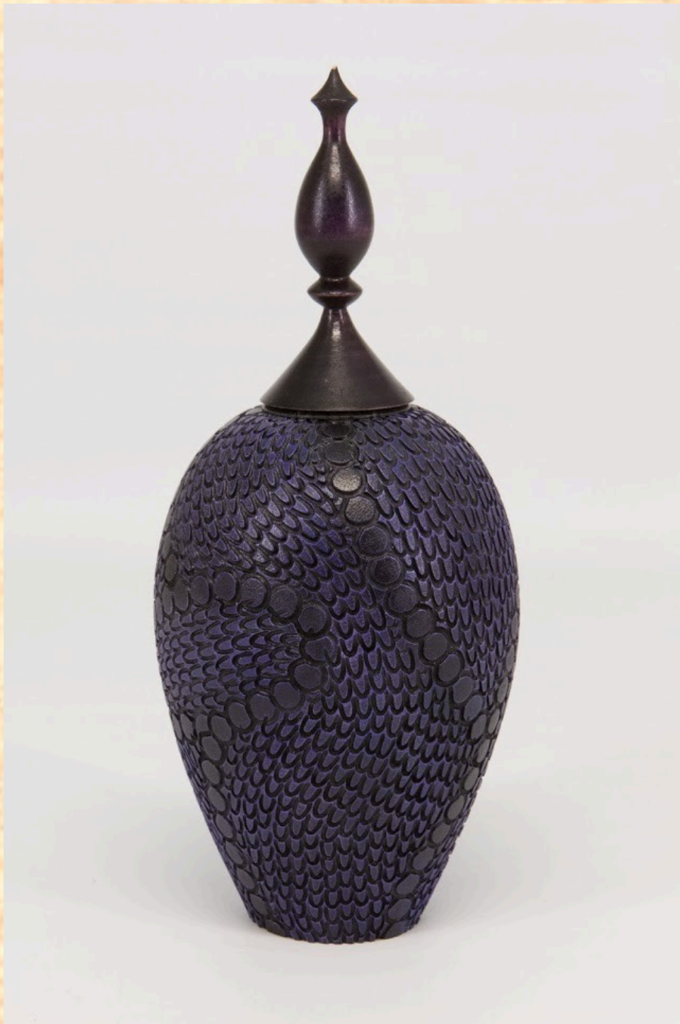
Jeff Struewing 2 1/2" x 6 1/2" hollow form with threaded lid [holly, Corian]