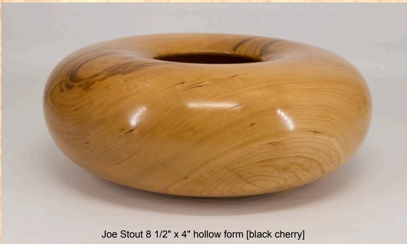
Joe Stout 8 1/2" x 4" hollow form [black cherry]