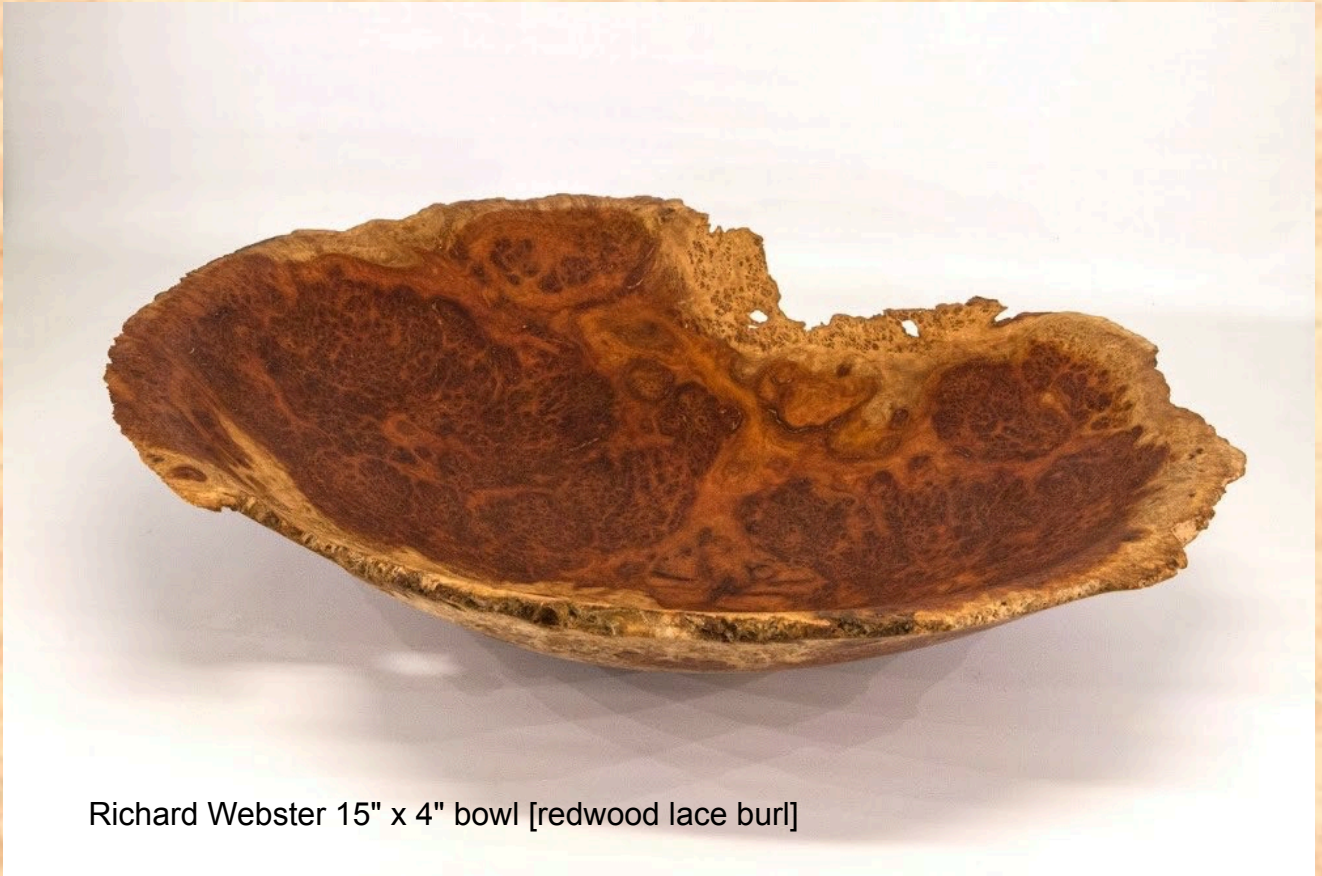
Richard Webster 15" x 4" bowl [redwood lace burl]