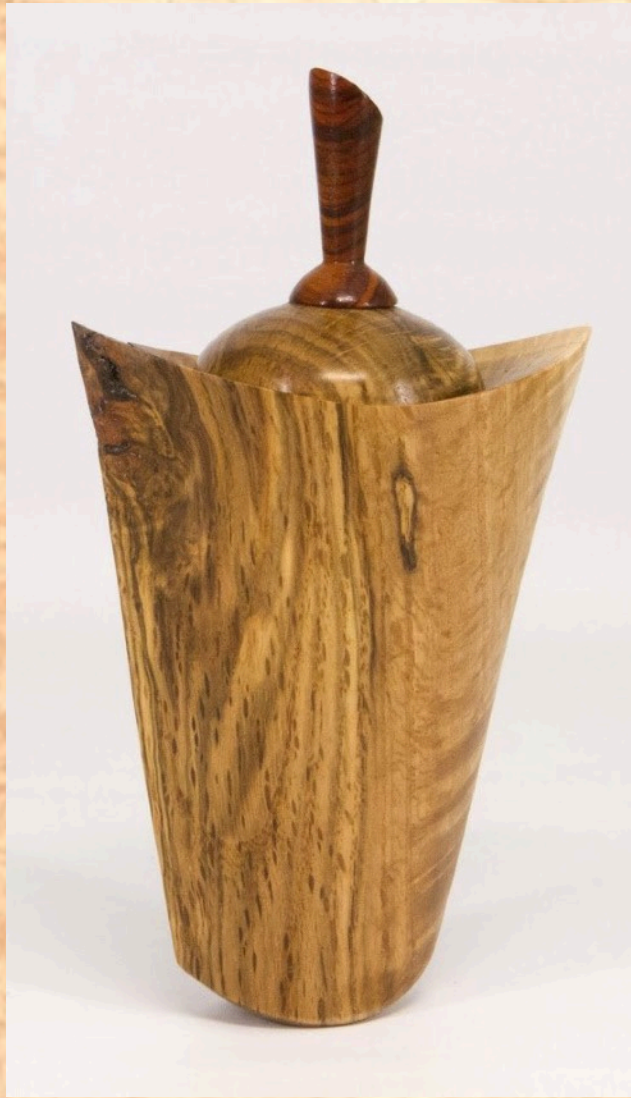
Tim Aley 4" x 2" x 7" box [oak, ?]