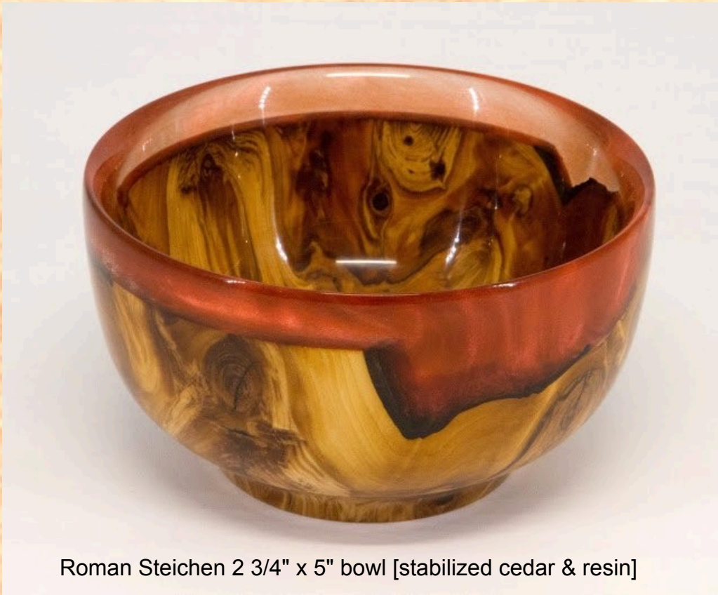
Roman Steichen 2 3/4" x 5" bowl [stabilized cedar & resin]