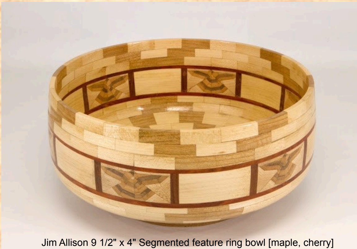
Jim Allison 9 1/2" x 4" Segmented feature ring bowl [maple, cherry]