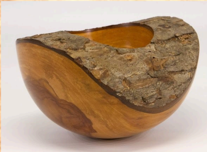
Gary Gunther 3" x 5" x 4 1/2" bark edge bowl "bark nest" [red maple, holly]