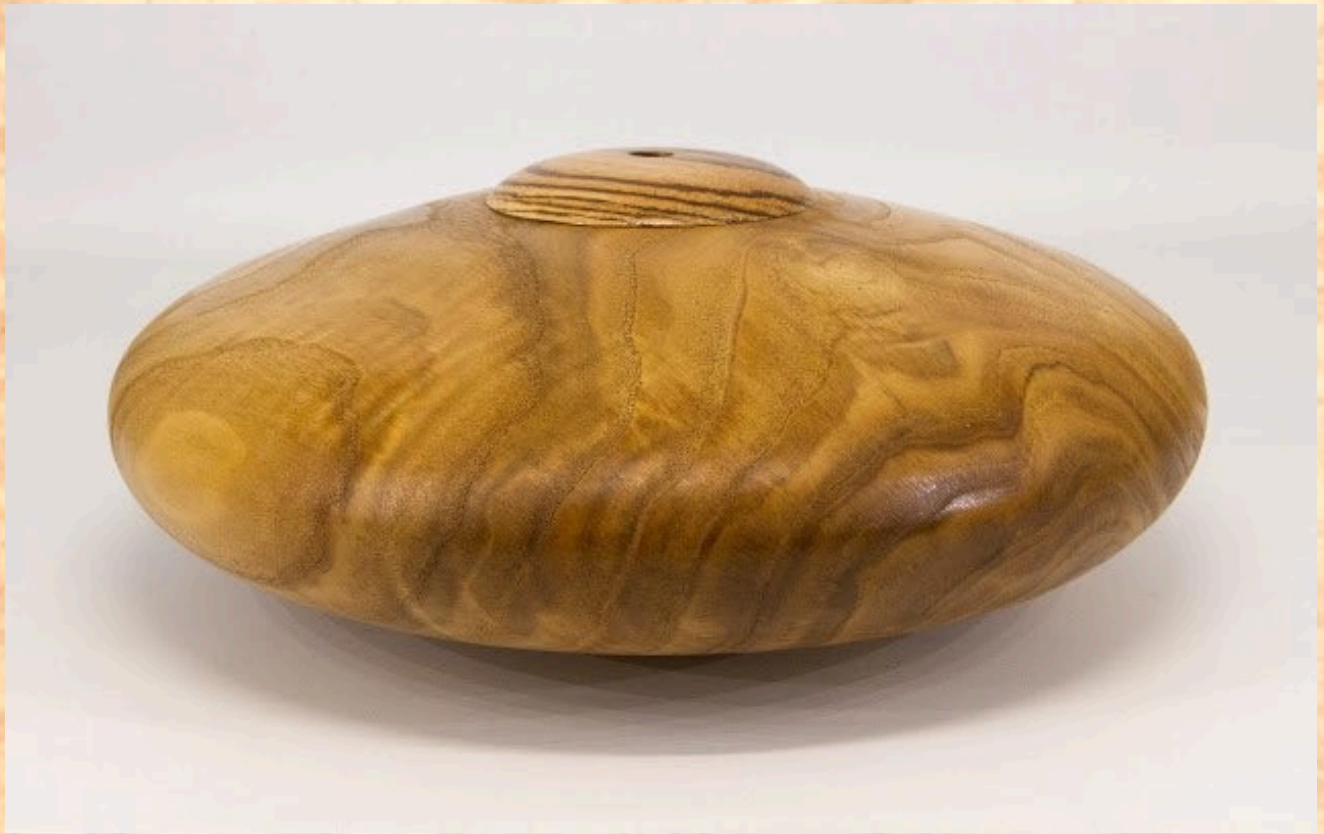
Steve Drake 10" x 4" hollow vessel [chestnut, zebrawood]