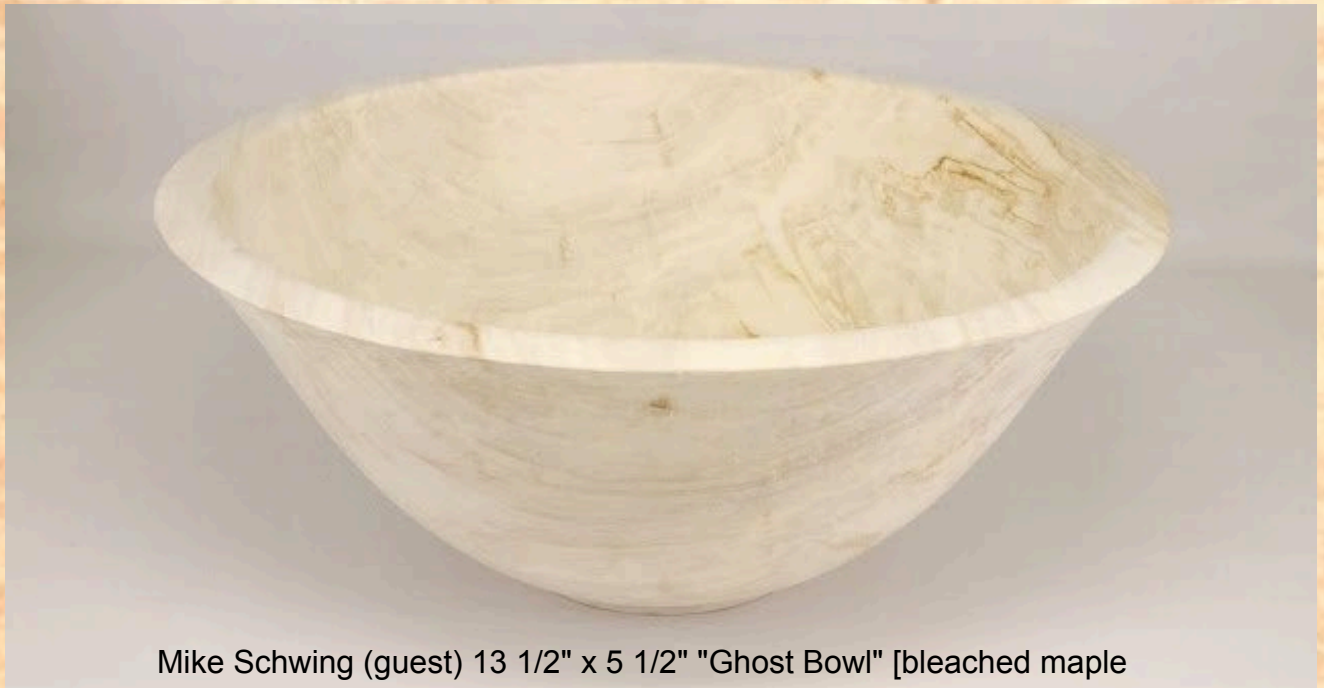
Mike Schwing (guest) 13 1/2" x 5 1/2" "Ghost Bowl" [bleached maple]