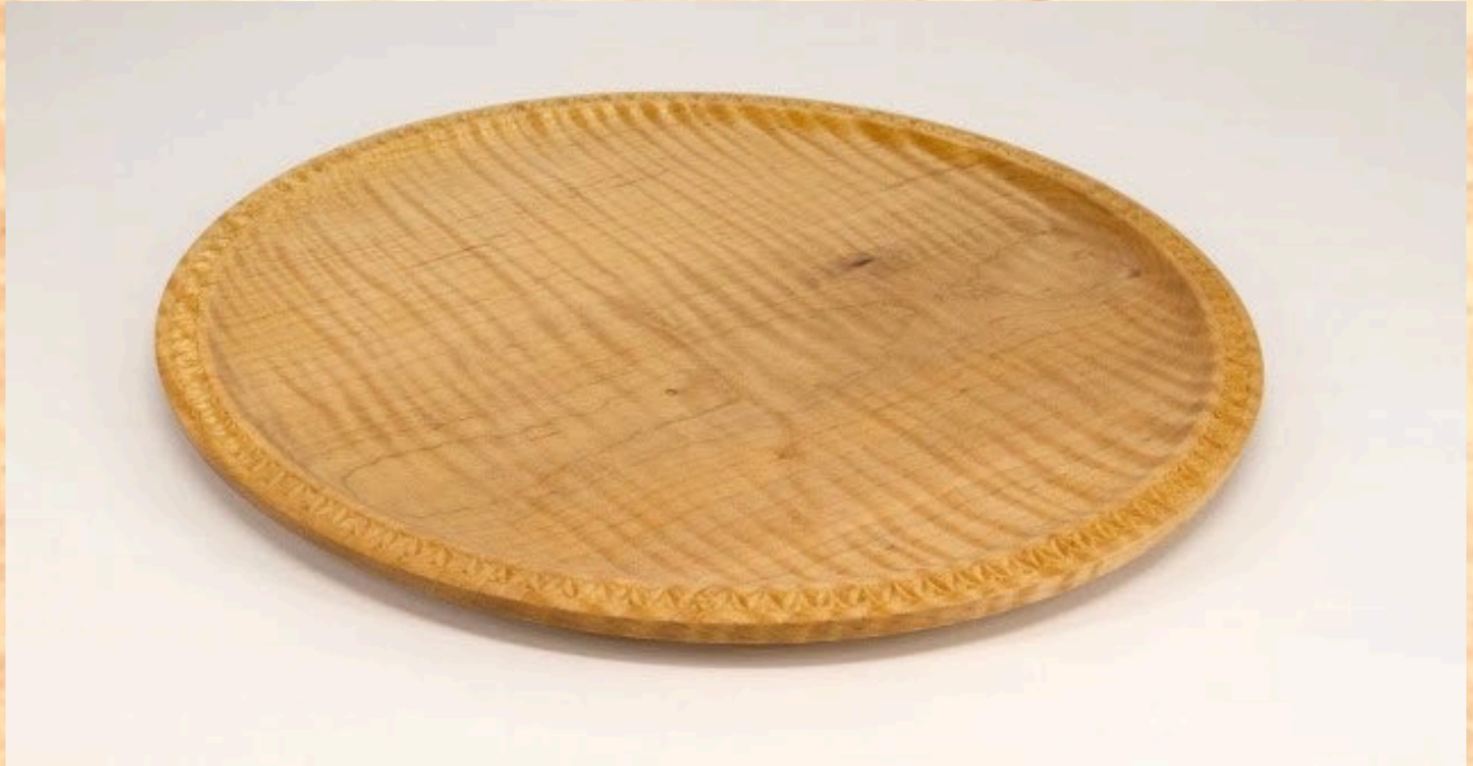
Margaret Follas 12" x 1" plate [curly maple]