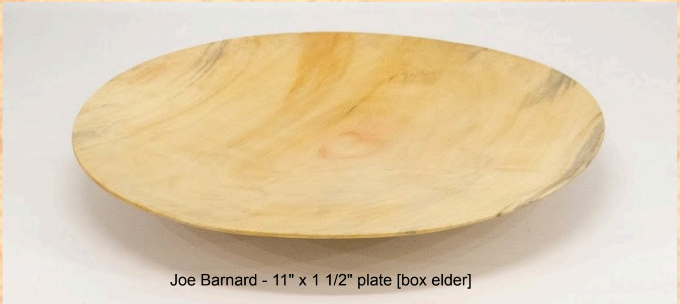
Joe Barnard - 11" x 1 1/2" plate [box elder]