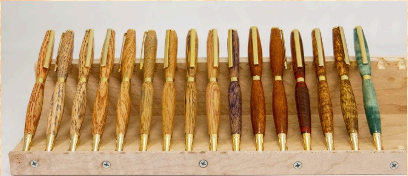
Roman Steichen - 16 Turn For Troops pens [oak, Brazilian cherry, maple]