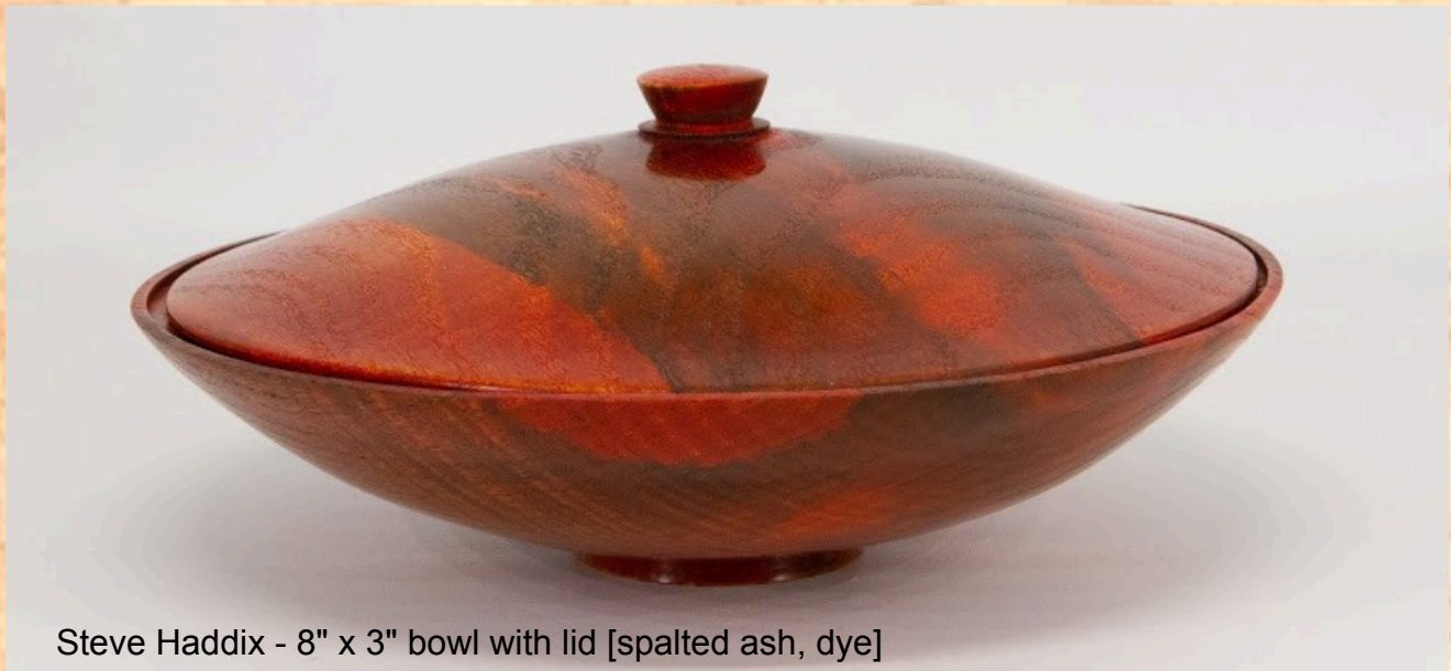
Steve Haddix - 8" x 3" bowl with lid [spalted ash, dye]