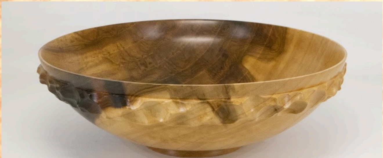
Steve Haddix - 12" x 4" bowl [poplar]