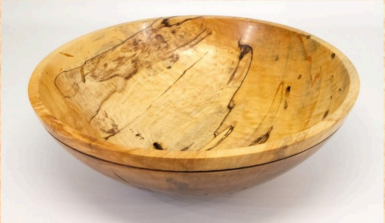
Steve Haddix - 9 1/2" x 3 1/4" bowl of two tones [spalted maple]