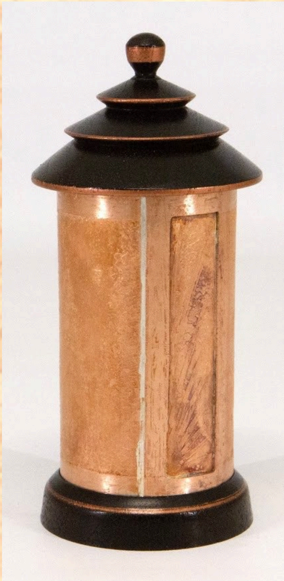
Bob Anderson - 5" x 2" x 2" copper box [copper, walnut, paint, stain]