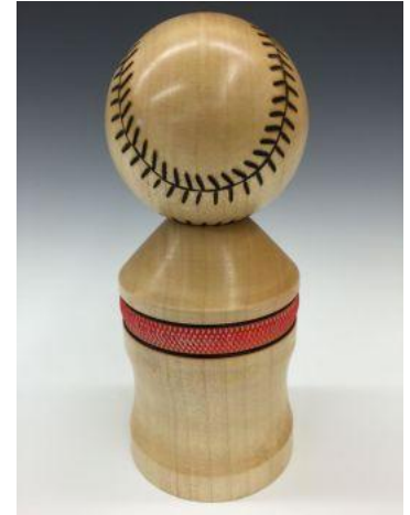
Just one of many!

Most of these hundreds of individual projects, from different sources, are available either as html web pages or as pdfs that you can download and read with Adobe Acrobat. A few are from the More Woodturning online magazine, and you'll have to skip those if you're not a subscriber. But most are readily available. Have fun playing.