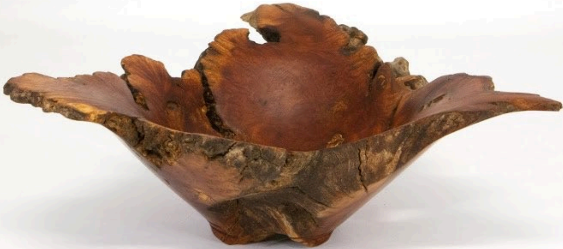
Richard Webster - 9" x 3" "wings" bowl [redwood burl]