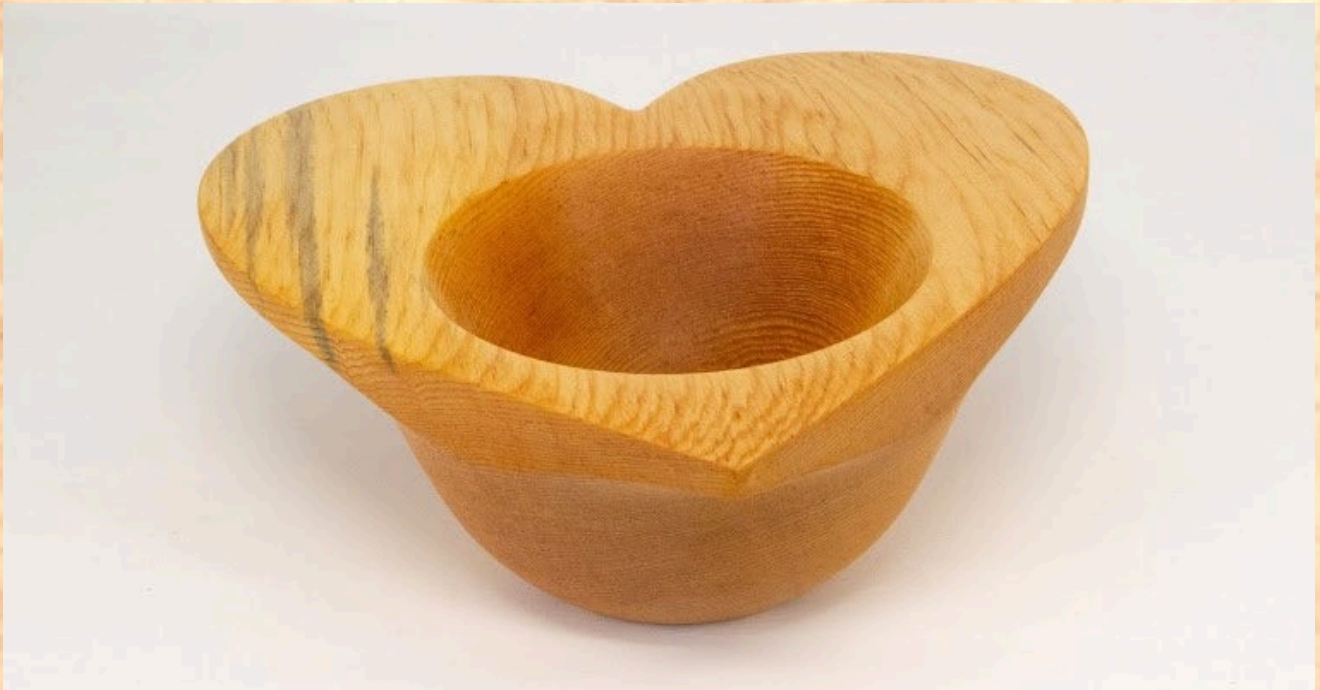
Roman Steichen - 8" x 3" heart bowl [pine]