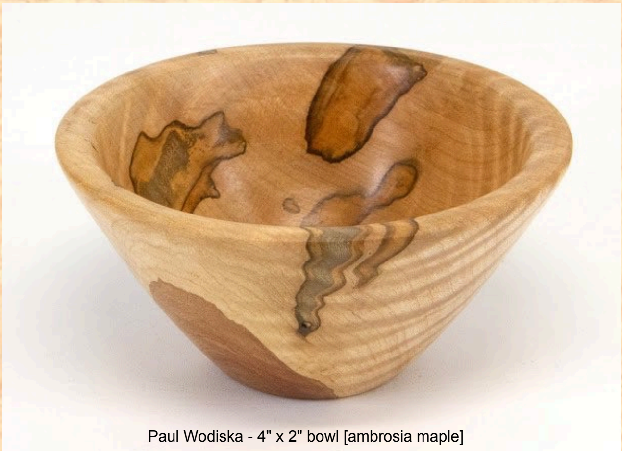
Paul Wodiska - 4" x 2" bowl [ambrosia maple]