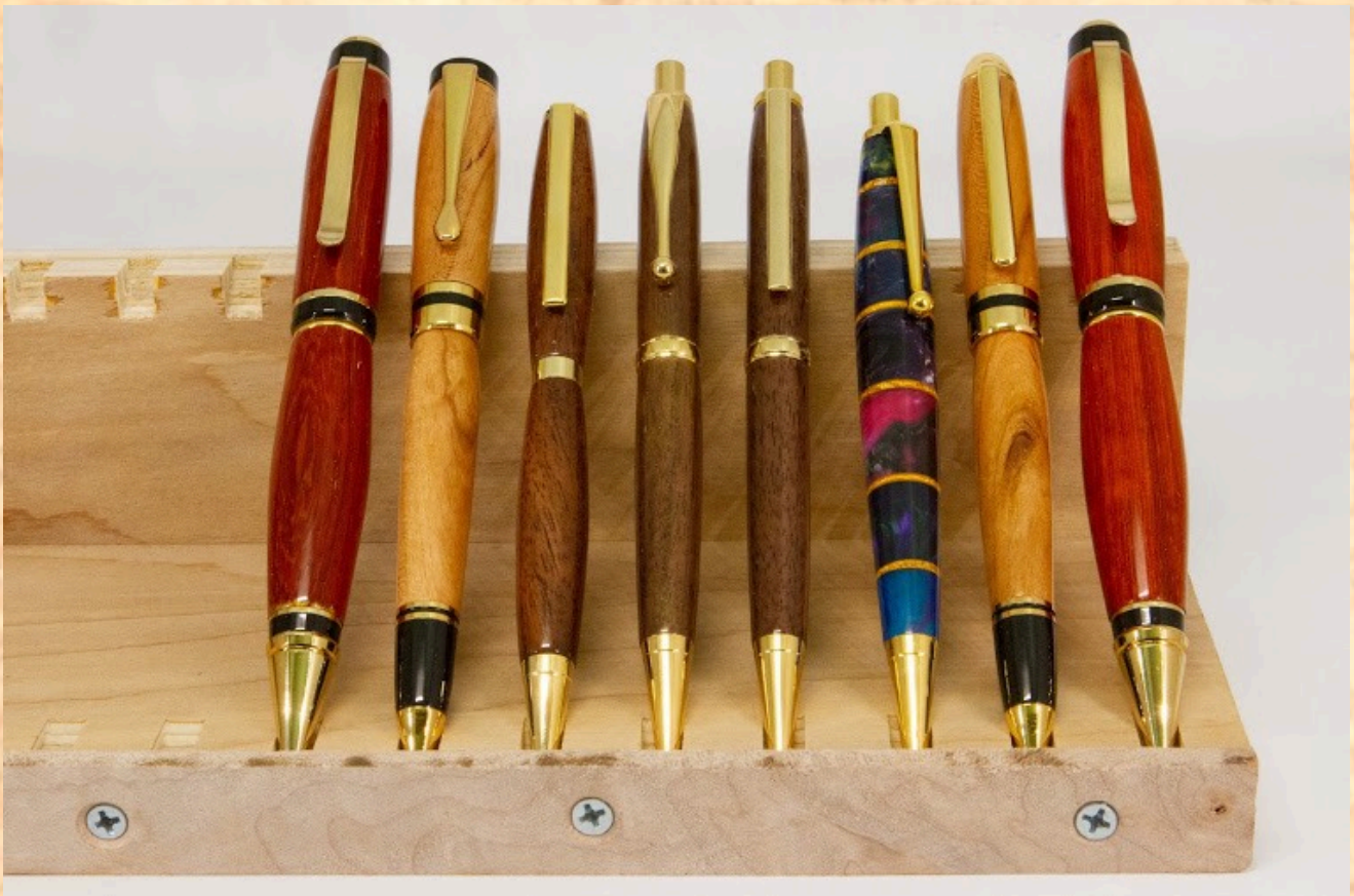
Roman Steichen - 8 Turn For Troops pens /pencils from Ellen [paduk cherry, walnut]