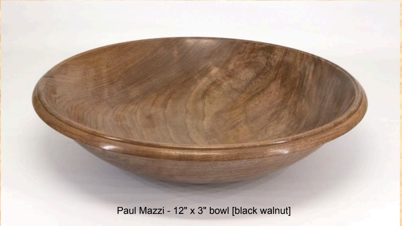
Paul Mazzi - 12" x 3" bowl [black walnut]