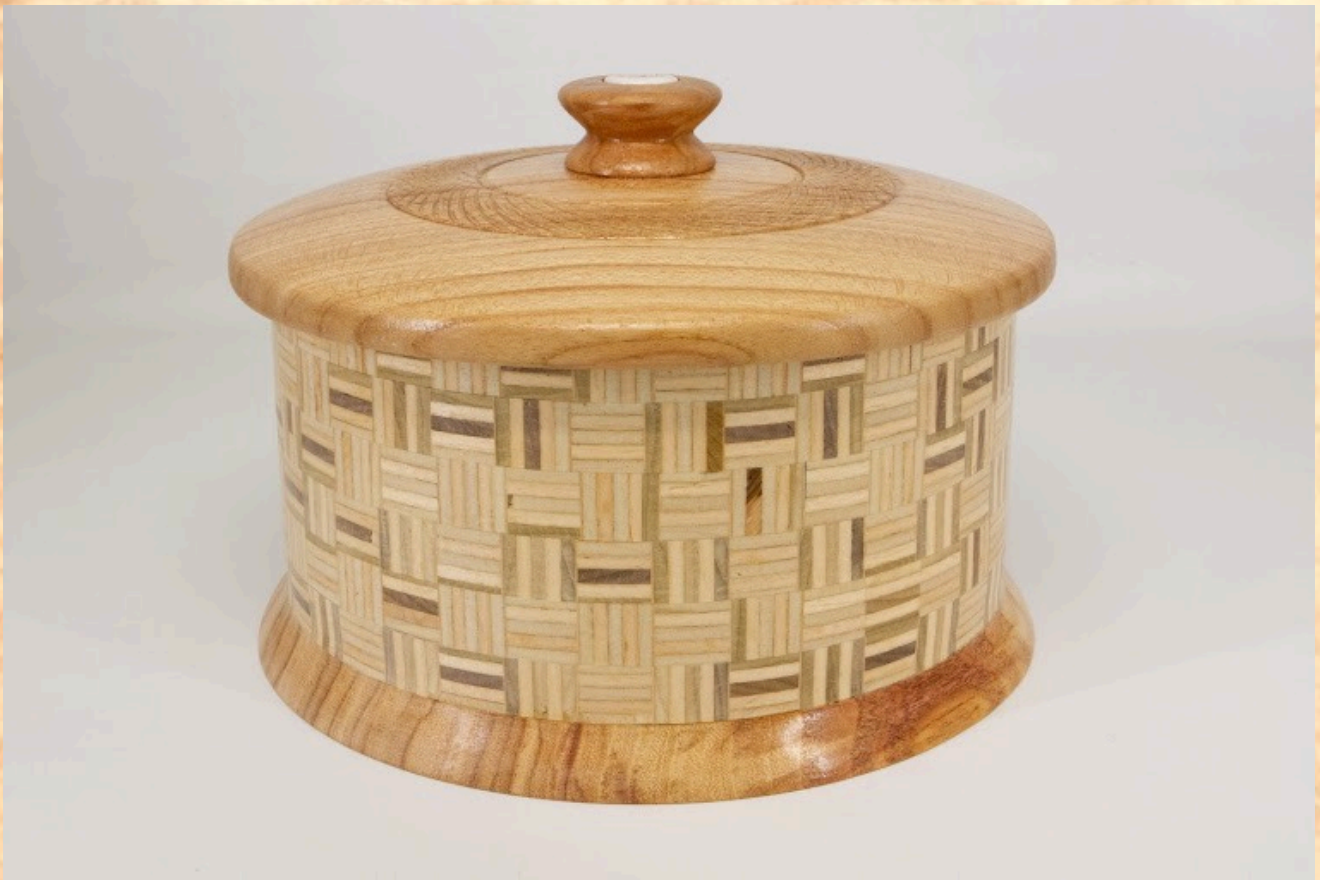
Stephen Price - 9" x 4 1/2" Beads of Courage box [plywood, locust] First-place winner in March Chesapeake Woodturners "plywood" challenge.