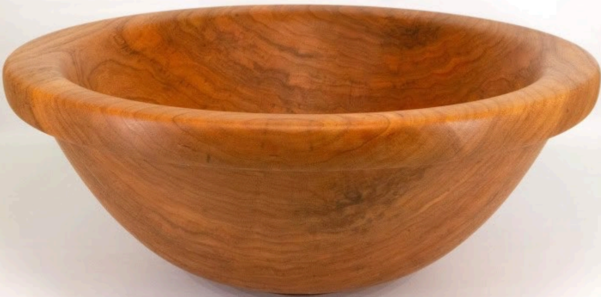
William Flint - 17" x 6 1/2" "B. A. B." bowl [cherry]