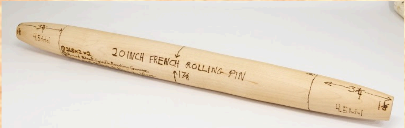
Matt Radke - 21" x 2" x 2" 20" French rolling pin Pattern [maple]