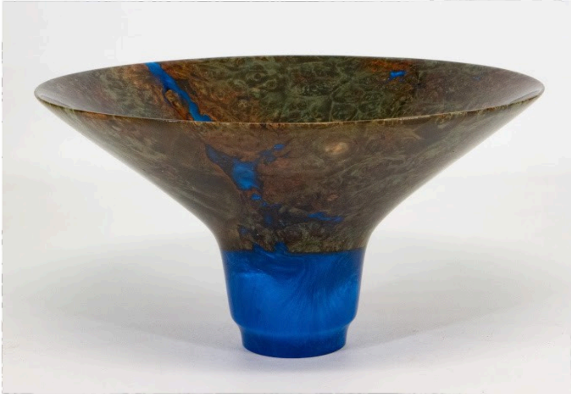
Roman Steichen - Phil Brown cored bowl [oak, resin].

Roman has made great strides in perfecting stabilizing woods and combining them with cast resin as seen here.