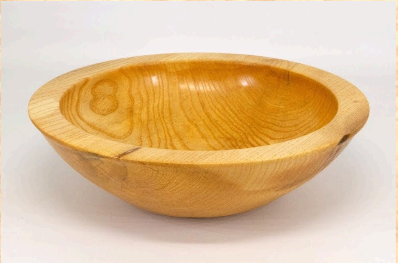
Tom Ankrum - 9" x 3" bowl [ash]