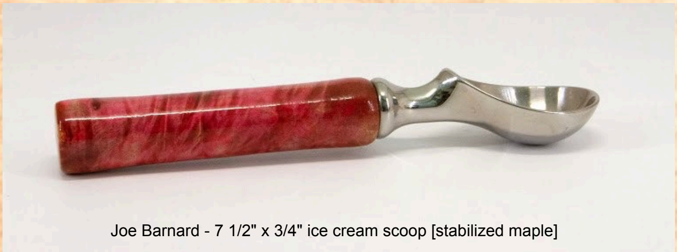
Joe Barnard - 7 1/2" x 3/4" ice cream scoop [stabilized maple]