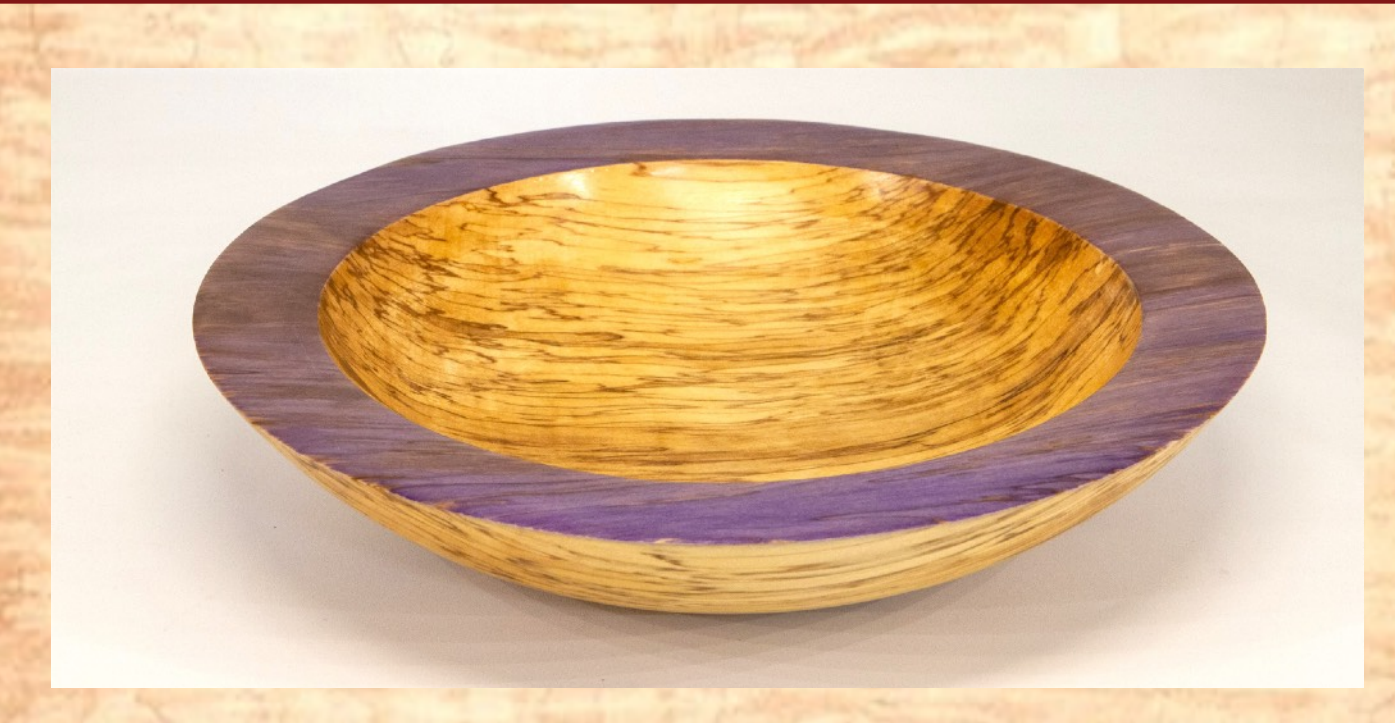
Joe Barnard 10-1/2" 2-1/4" bowl [spalted maple, dye]