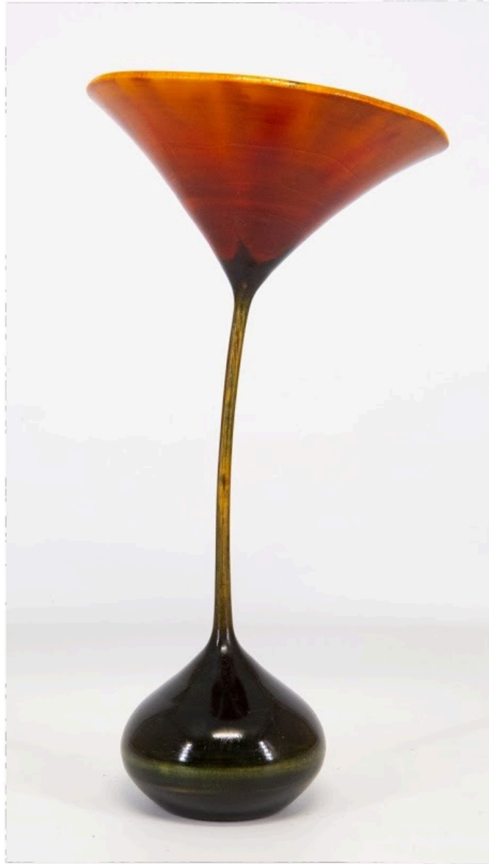
Steve Haddix - 5" x 10" flower pod [choke cherry]