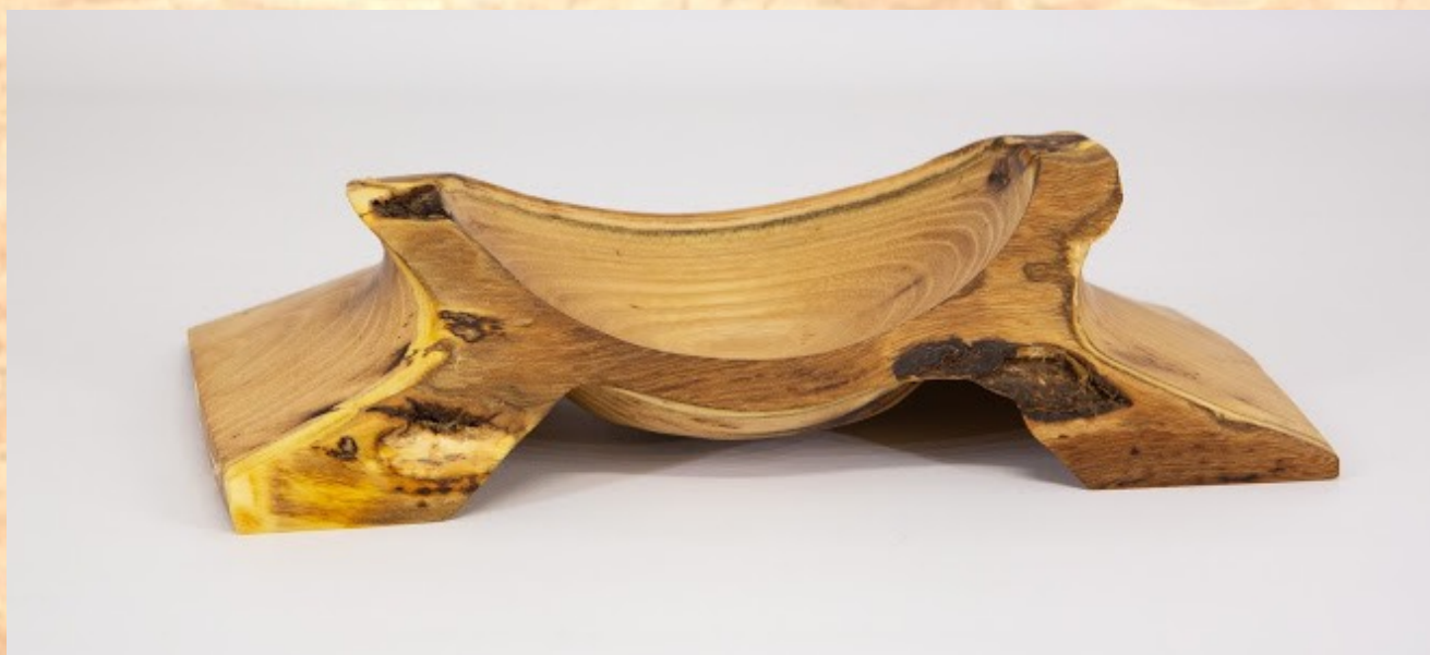
John Laffan - 8" x 4" winged bowl [sycamore]