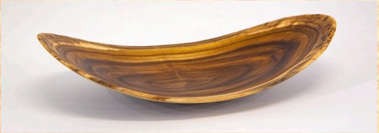
Steve Haddix - 10" x 5" x 3" natural-edge bowl [persimmon]