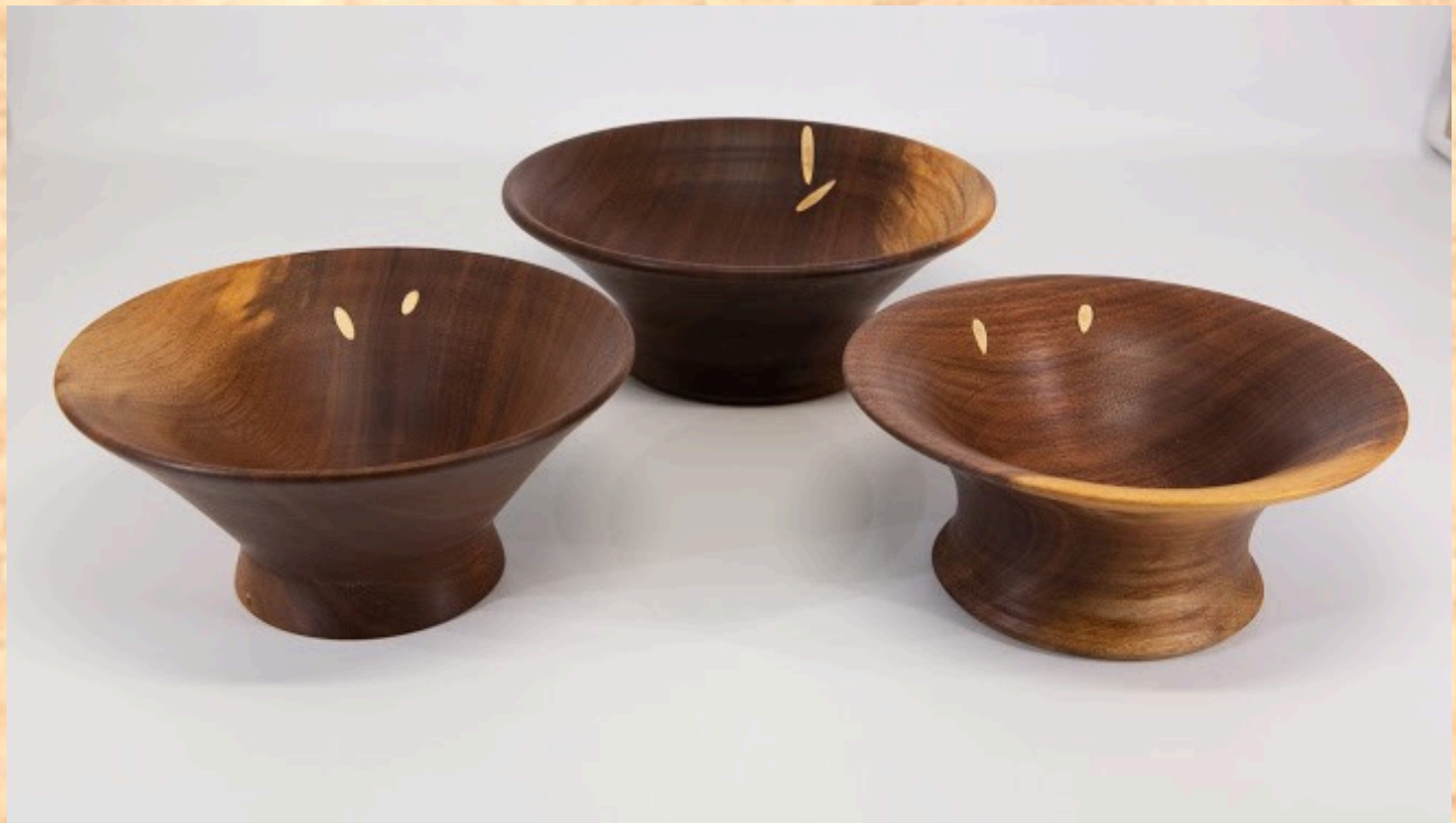
Manu Suarez - 7" x 3" three bowls [walnut]