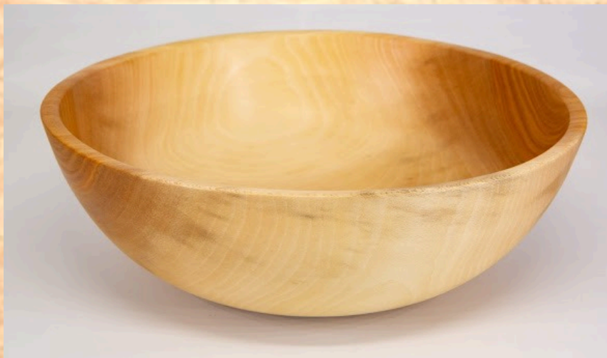
Jeff Struewing - 11" x 3" bowl [sycamore]