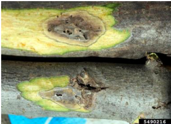
TCD canker on Southern California walnut.

It bans people from transporting nursery trees, grafts, green lumber and firewood, as well as living or dead walnut material including stumps, roots, branches and mulch. The firewood quarantine applies to any type of hardwood firewood because it is difficult to distinguish between the types of wood. Walnut material cannot be moved beyond the quarantined area without a certificate of inspection for the blight.