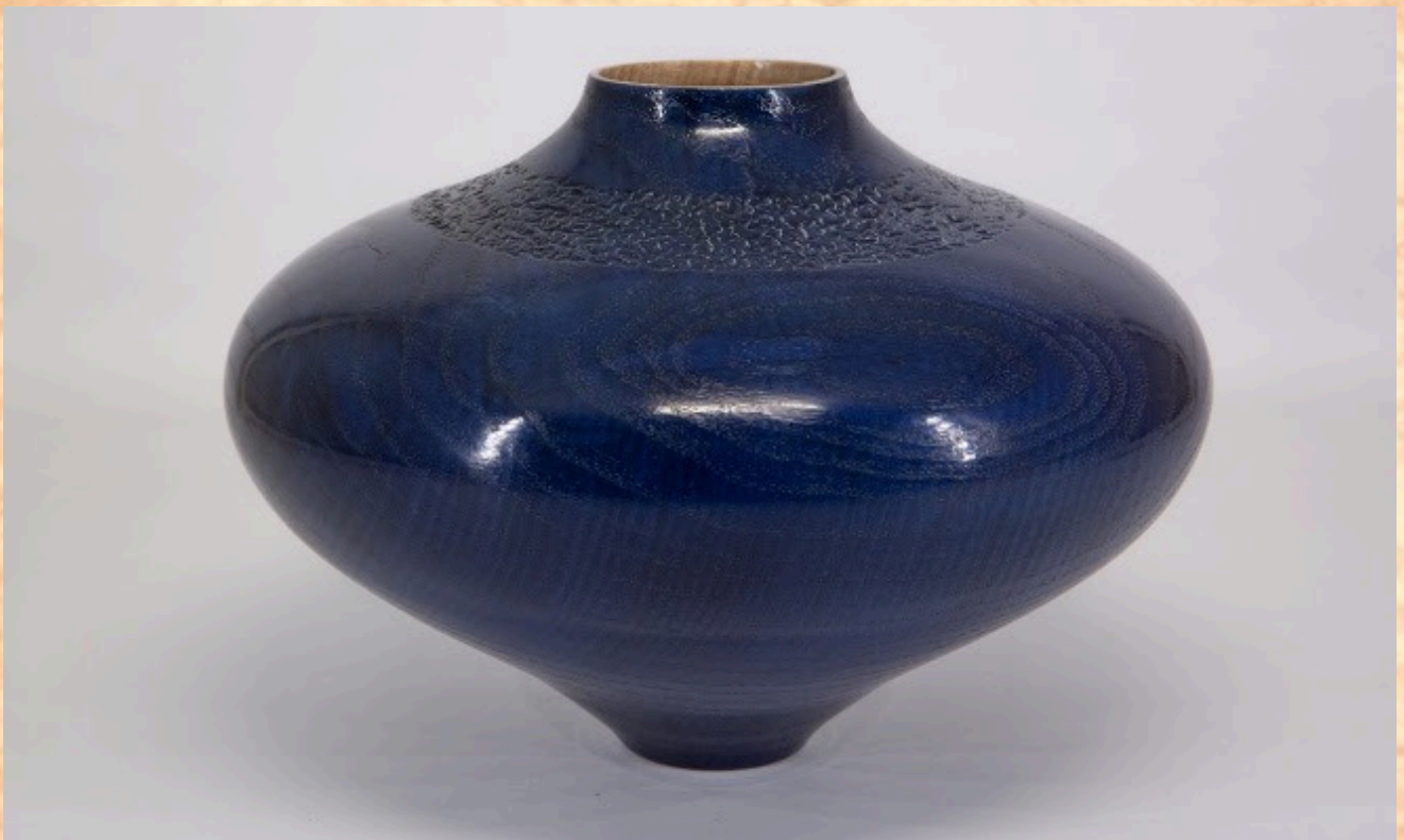
Steve Haddix - 7" x 5-1/2" hollow form with texture and color