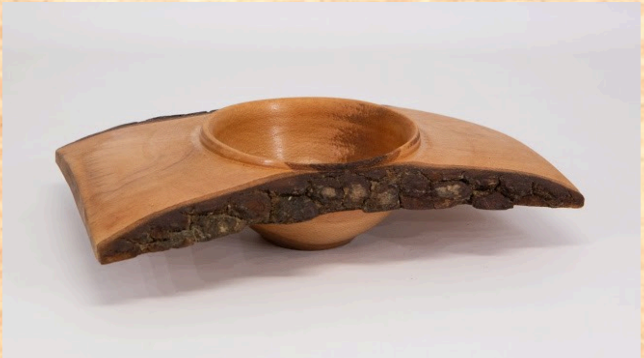
Eliot Feldman - 7" x 2" winged bowl [cherry]