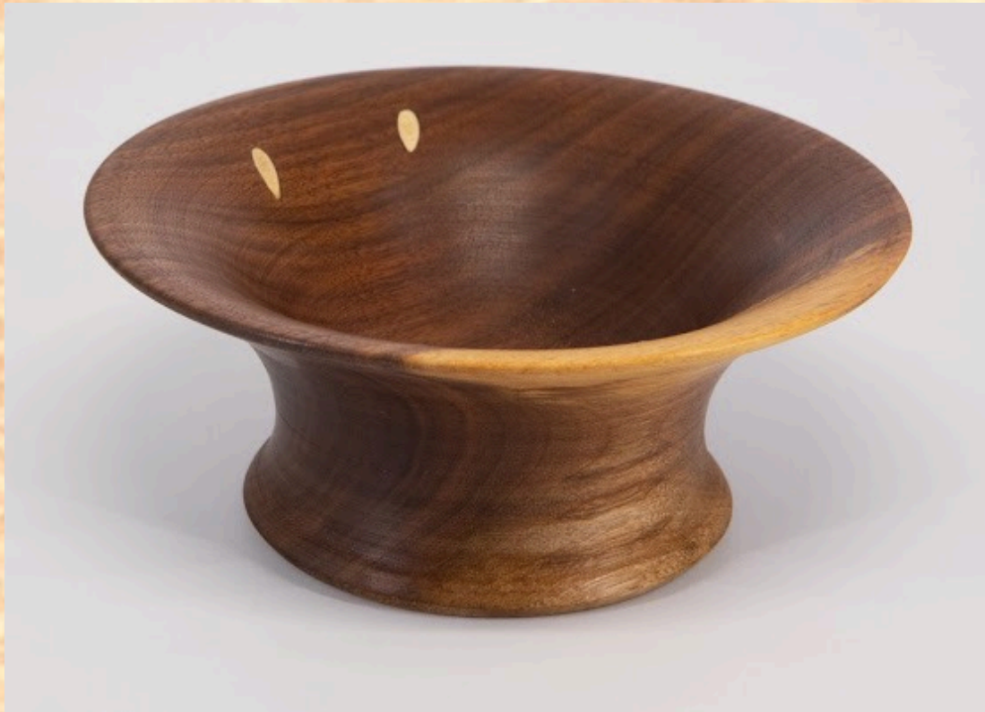
Manu Suarez - 7" x 3" bowl [walnut]