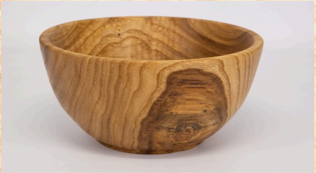
Stephen Price - 6" x 3" bowl [Chinese chestnut][ash]