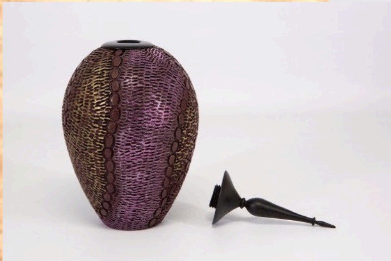
Jeff Struewing - 3" x 7-1/2" hollow form with finial [holly, pear, boxwood, color]