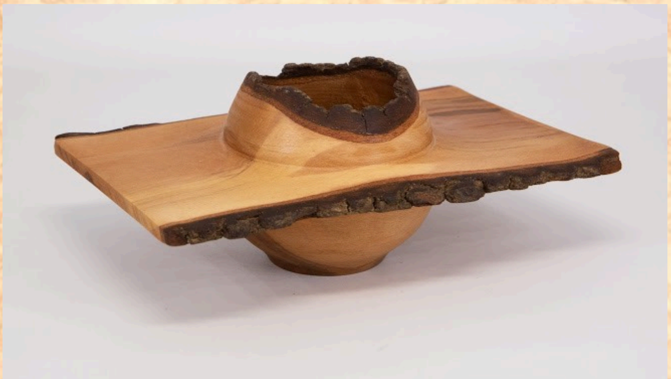
Eliot Feldman - 7" x 3" winged bowl [cherry]