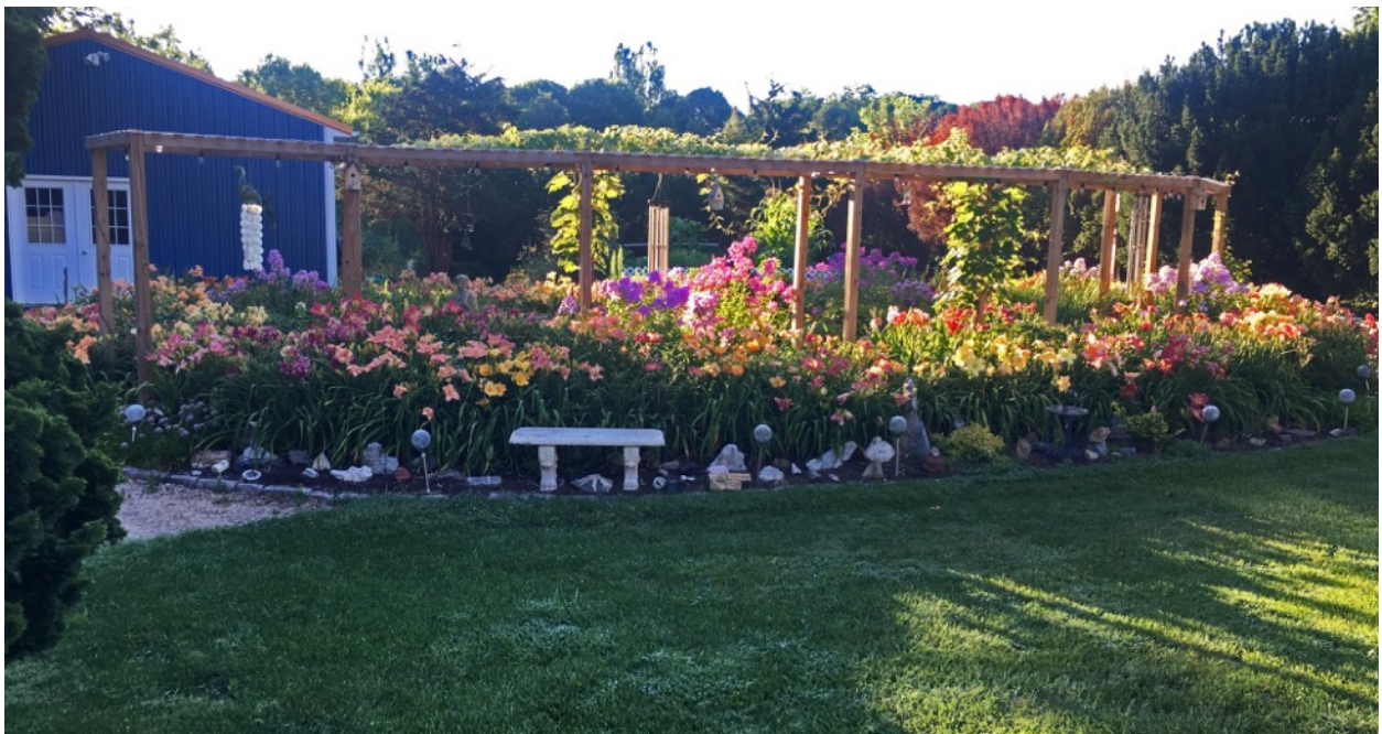
The Lily garden as of July 11th.