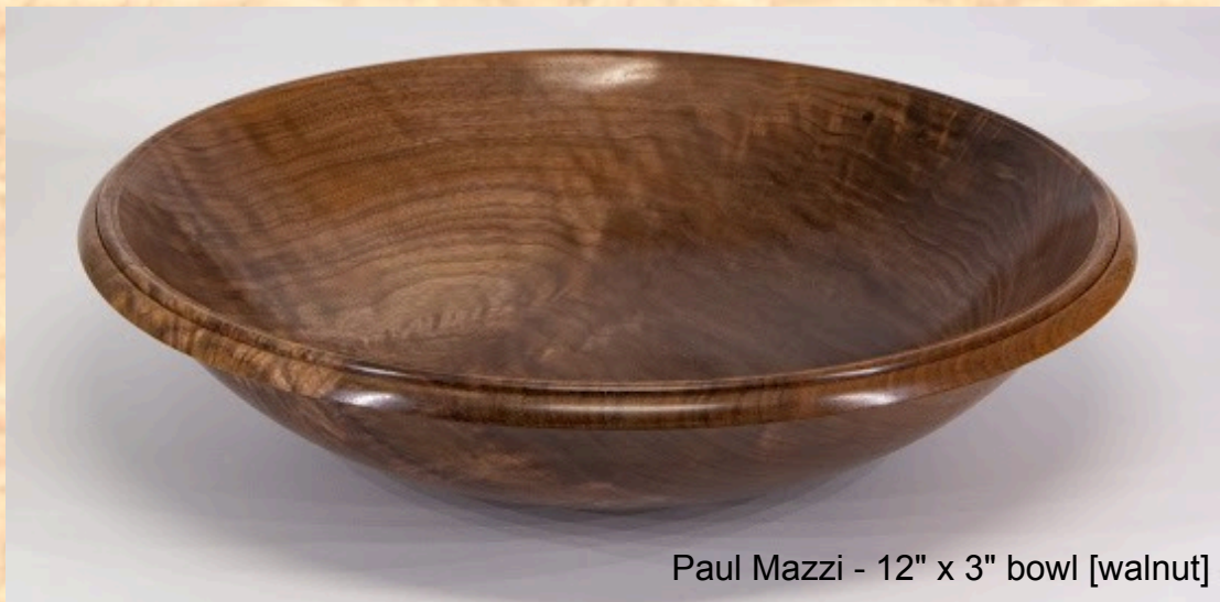
Paul Mazzi - 12" x 3" bowl [walnut]