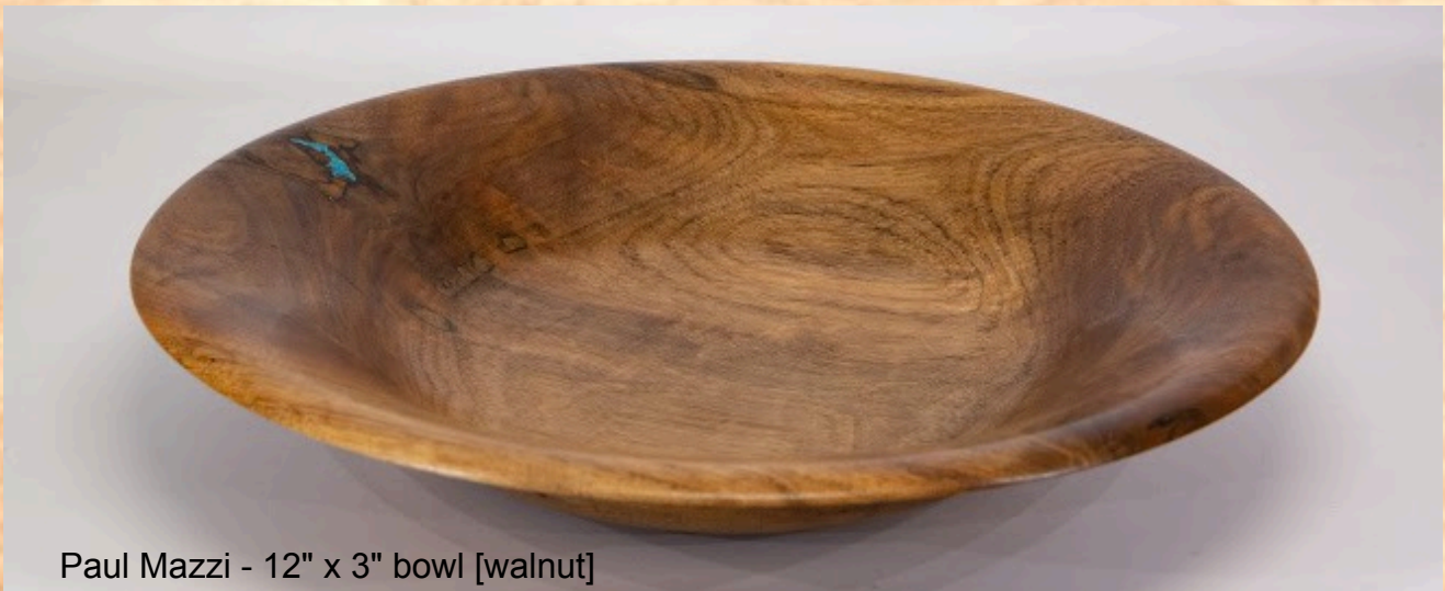
Paul Mazzi - 12" x 3" bowl [walnut]