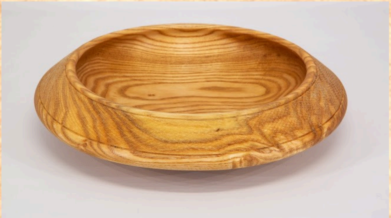
Stephen Price - 9-1/2" x 2" bowl [oak (Phil Brown)]