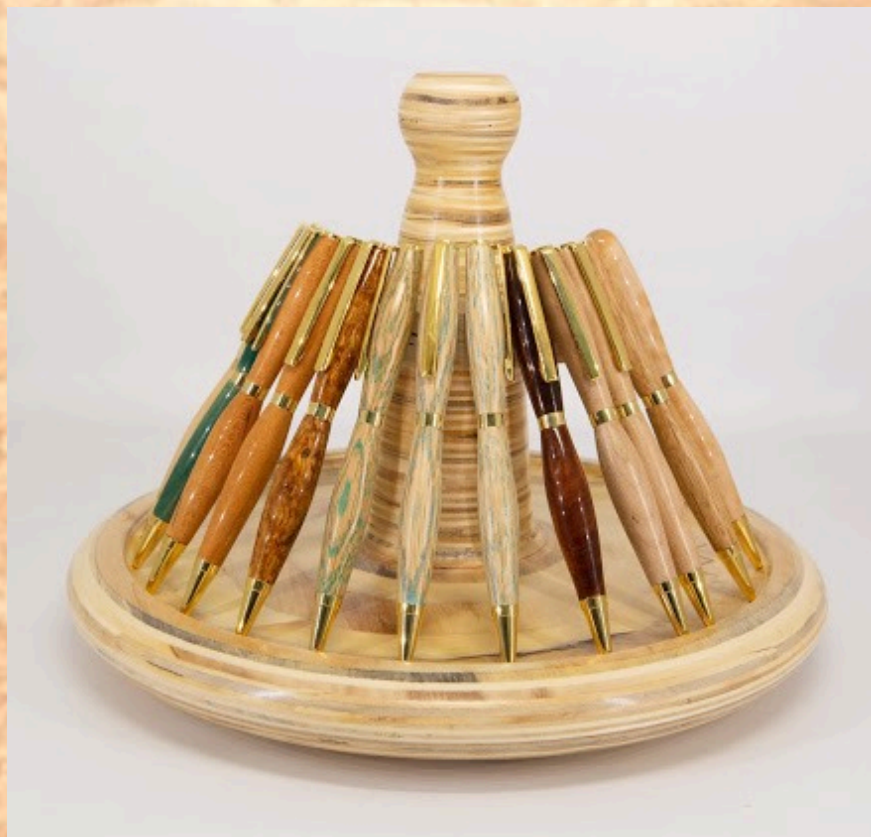
Roman Steichen - 13 Turn for Troops pens [oak, maple, sycamore, others]