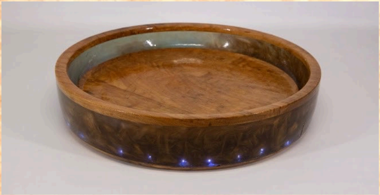
Joe Mosli - 9" x 2" lighted bowl [wood, resin, LEDs] gifted in Bring Back Challenge to winner Joe Stout