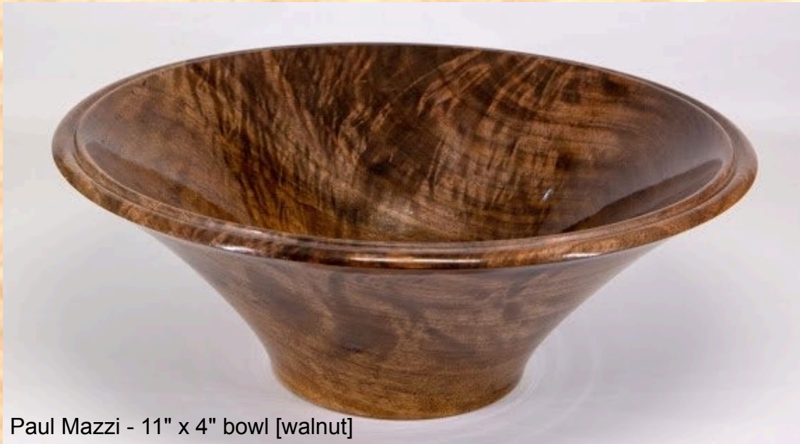
Paul Mazzi - 11" x 4" bowl [walnut]