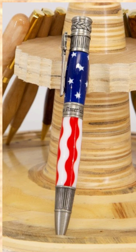
Roman Steichen - Patriotic pen [resin]