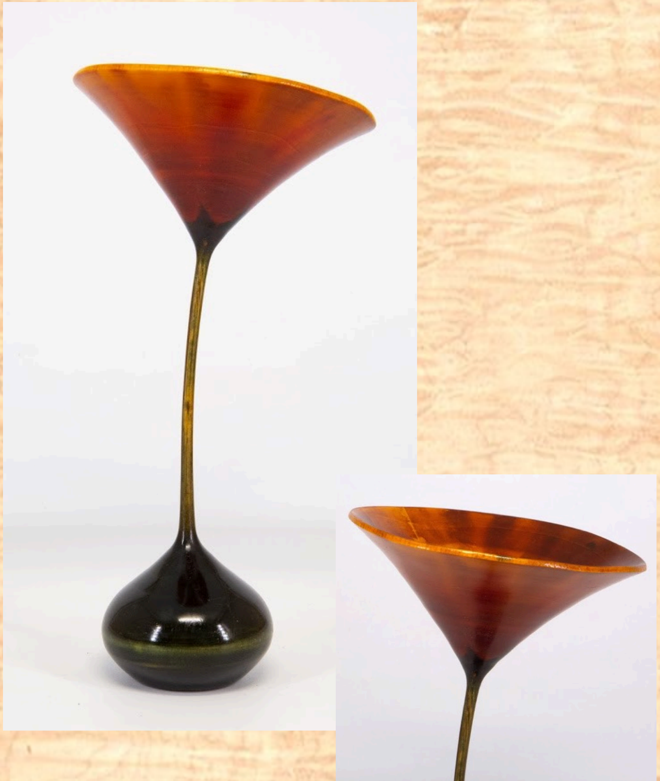
Steve Haddix - 5" x 10" flower pod [choke cherry]