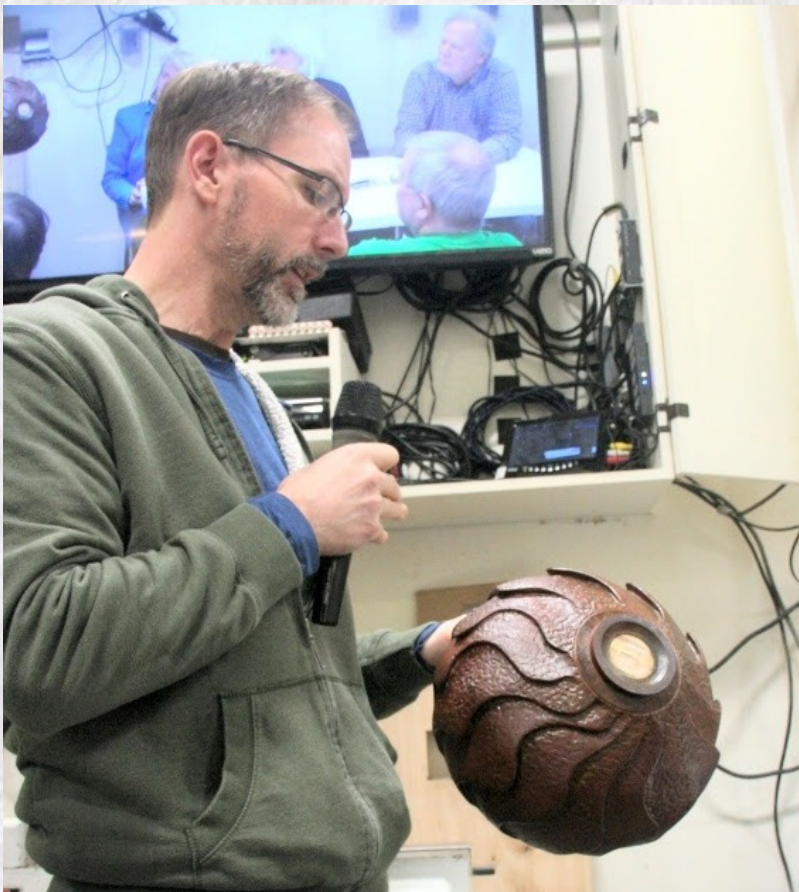
Steve Haddix 7" x 11" calabash bowl [spalted maple, rust finish]