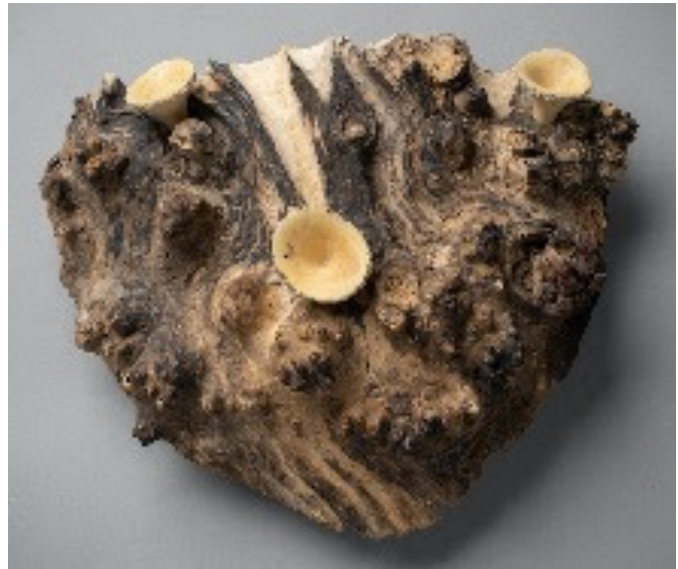
Marsh burled maple & boxwood 8 x 9 x 3 in.