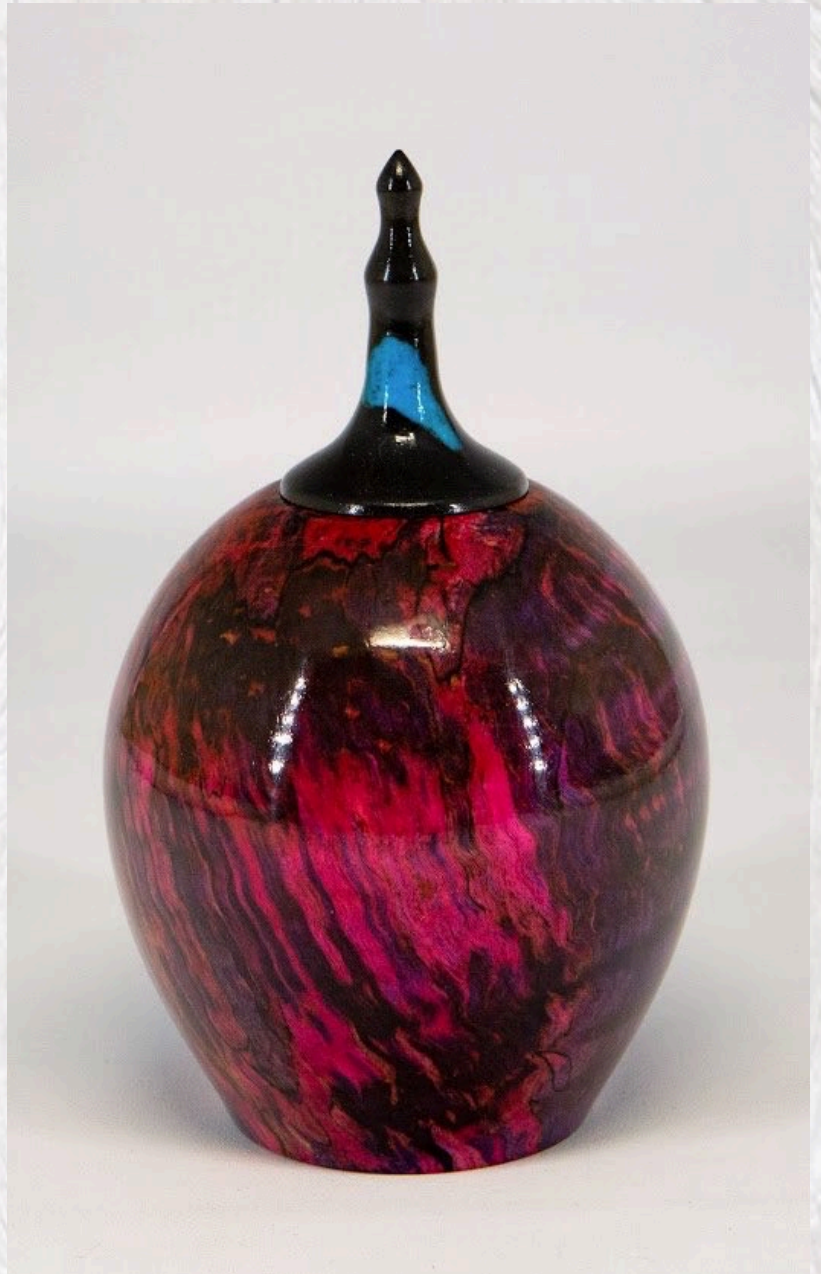
Mike Colella 4" x 2.5" Stabilized spalted maple, with hot pink and purple Cactus juice. Finial of ebony with turquoise fill