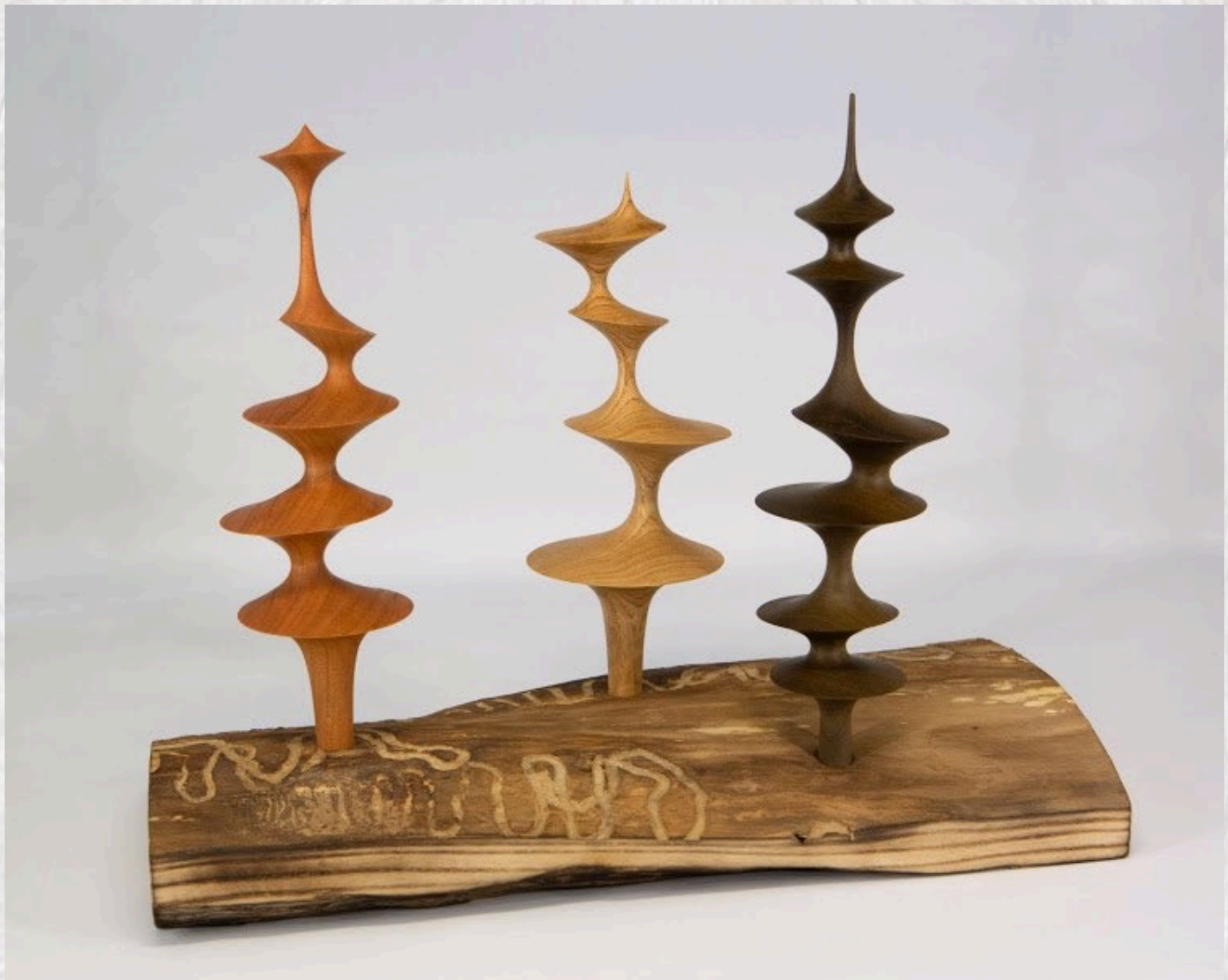
Duane Schmidt 10" x 13" x 6" sculpture [ash (killed by emerald ash borer), cherry, tuliptree, chestnut]