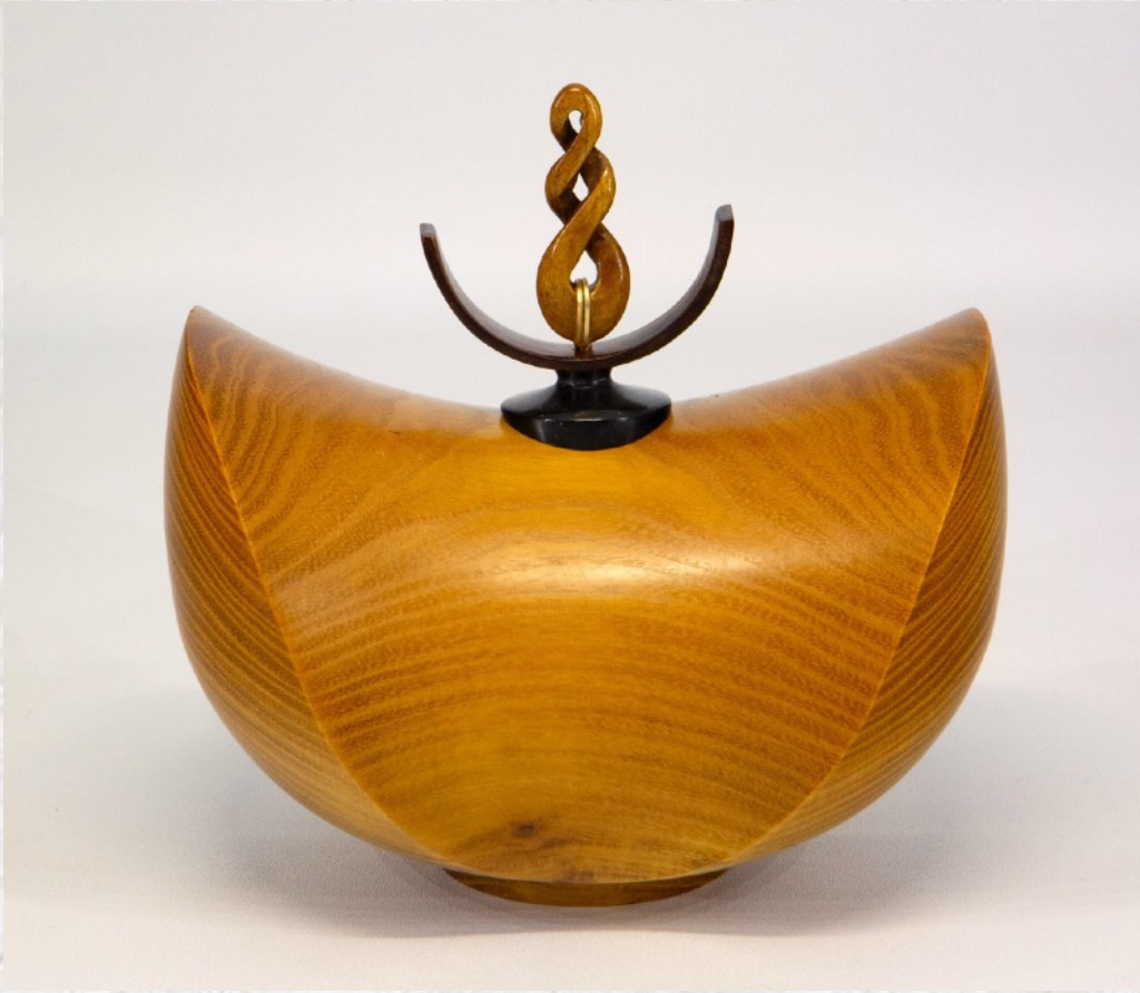
Gary Guenther 5" x 5" x 3-3/4" hollow form with finial "Offering" [osage orange, red maple, holly, stone, dye, brass wire]