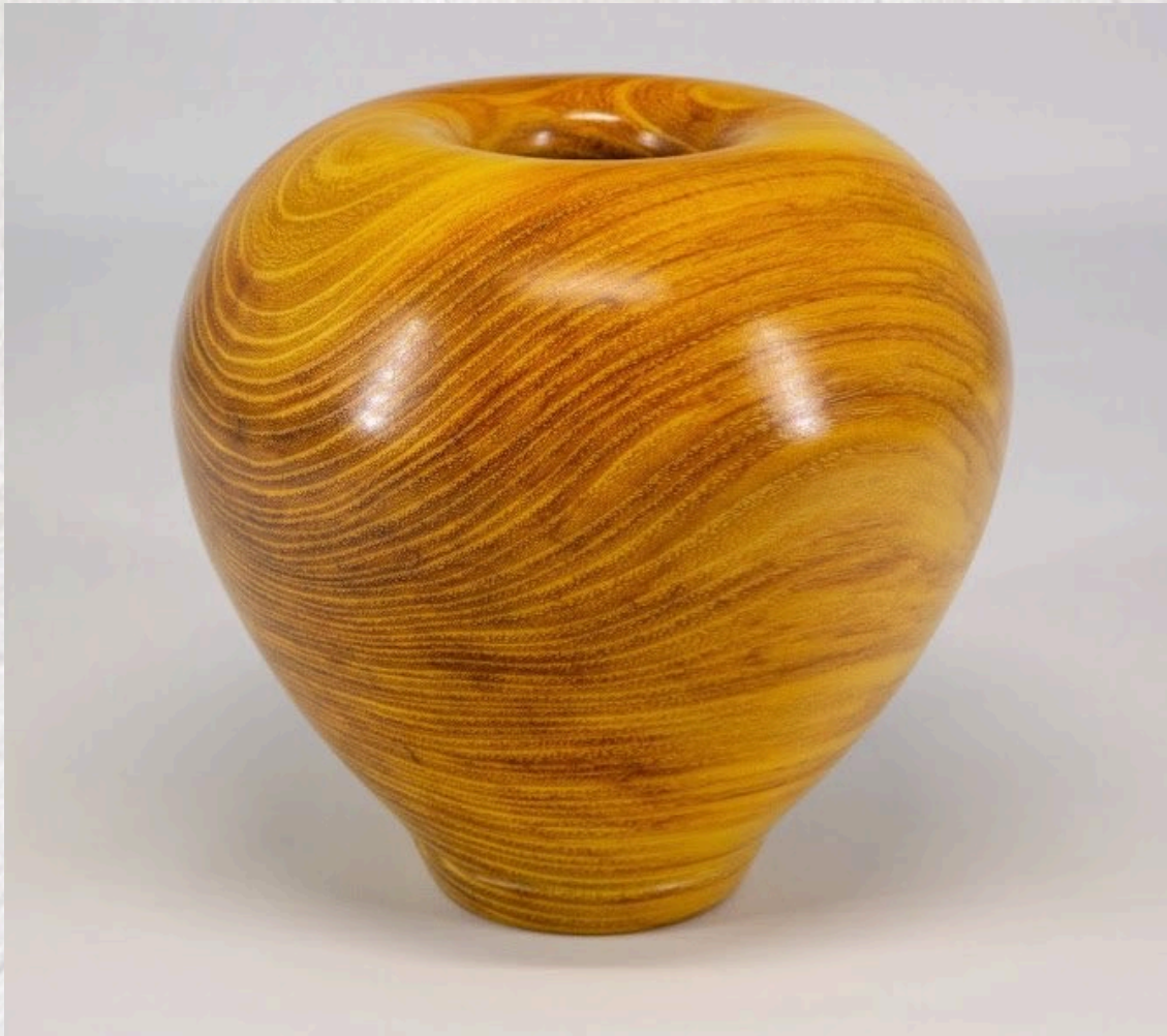
Scott Bleakney 6" x 4" hollow form [osage orange]