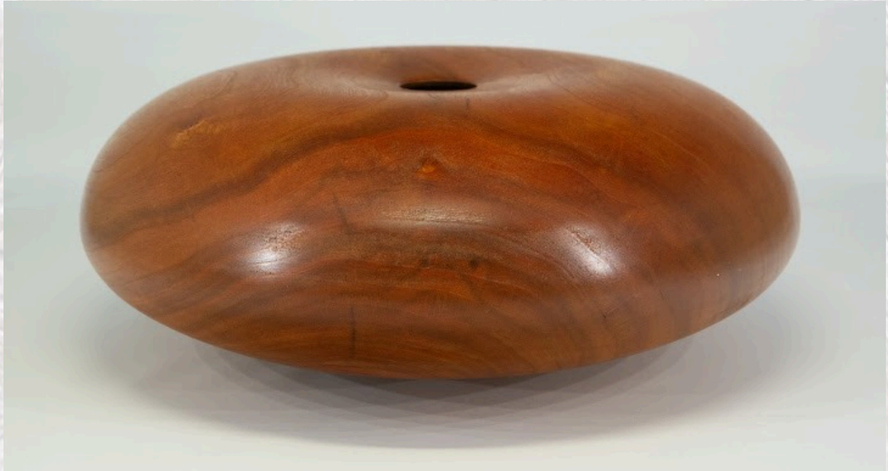
Eliot Feldman 3 1/2" x 12" hollow form [cherry]