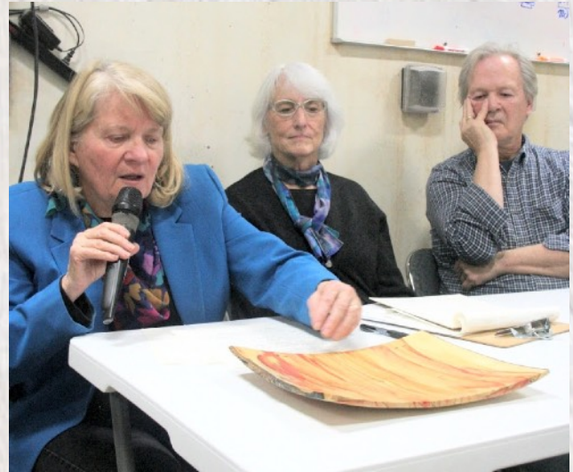
Joe Barnard 1" x 13" x 10-1/4" platter [ambrosia box elder]