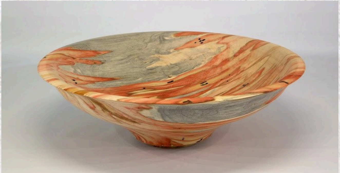
Paul Mazzi 3" x 12" bowl [ambrosia box elder]