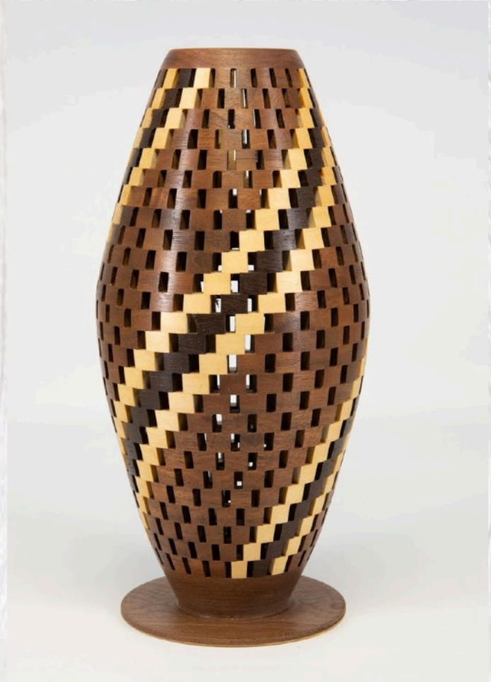
Bob Grudberg 10" x 3" open segmented vessel [mixed woods]