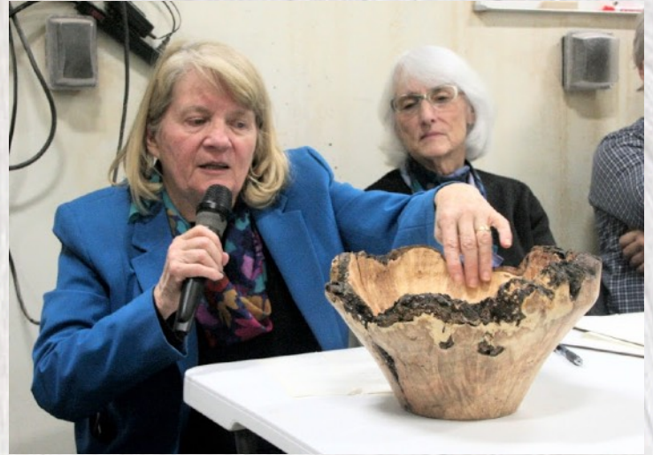
Ellie Trybuch 10" dia. bowl [maple burl]