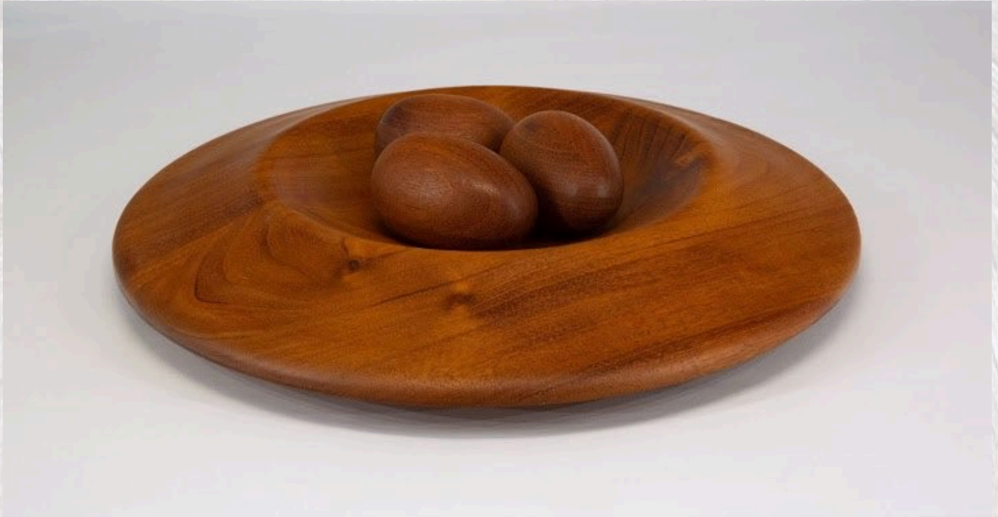
Rich Foa 2" x 12" nest with eggs [mahogany]