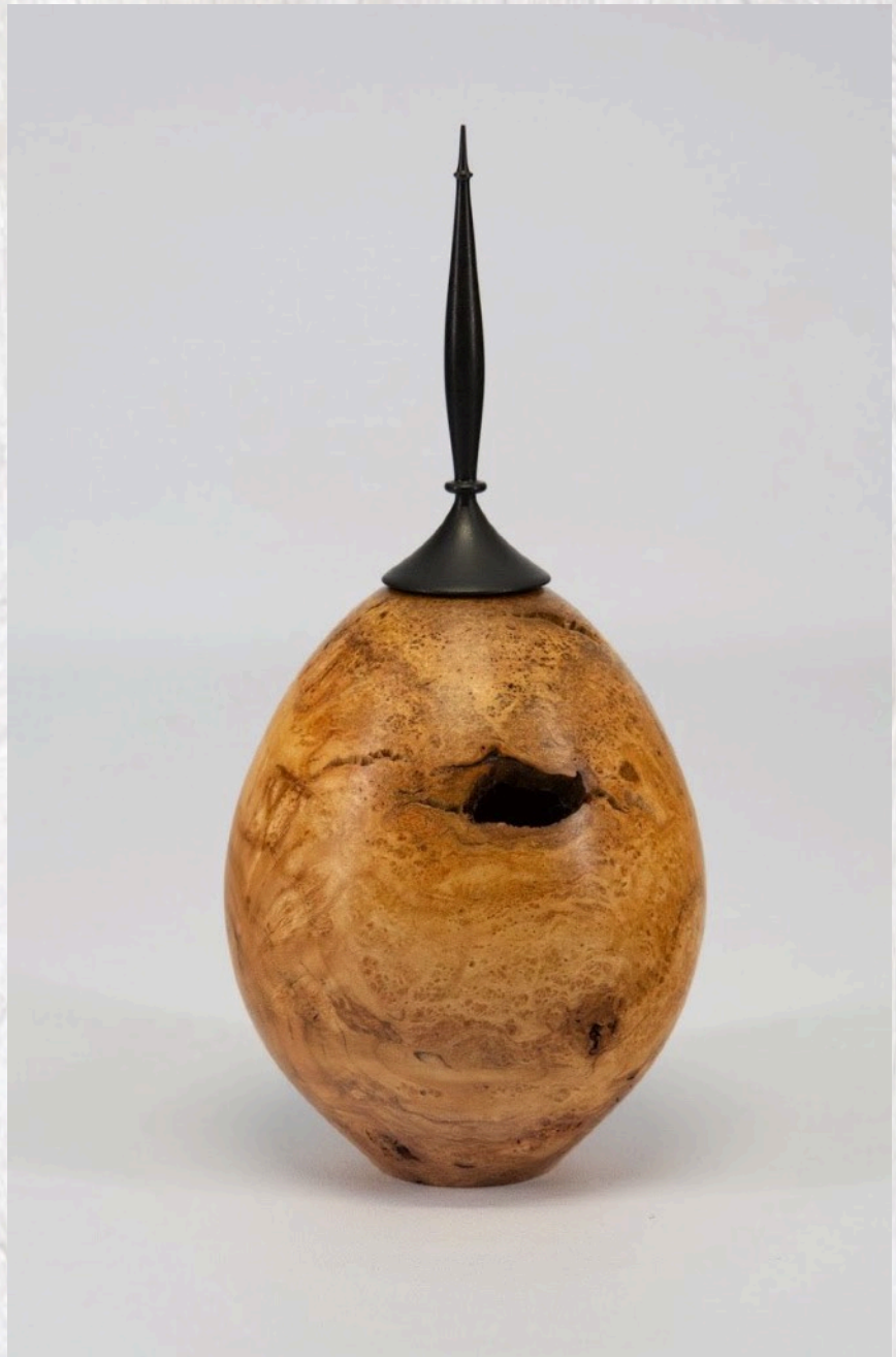
Jeff Struewing 3 1/2" x 3" burl vessel with finial [cherry burl, ebony, Corian]