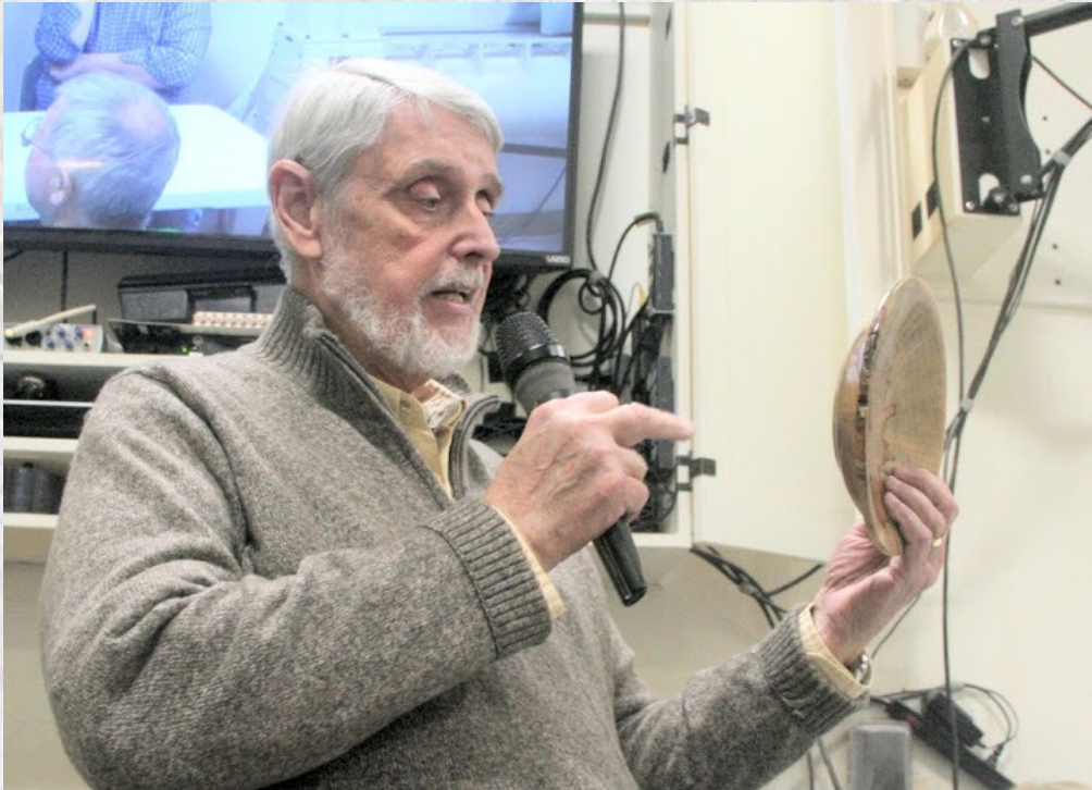
Paul Sandler 2" x 8-1/2" platter [Norfolk Island pine]