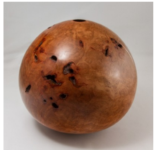
Eliot Feldman 10" x 11" hollow form [cherry burl]