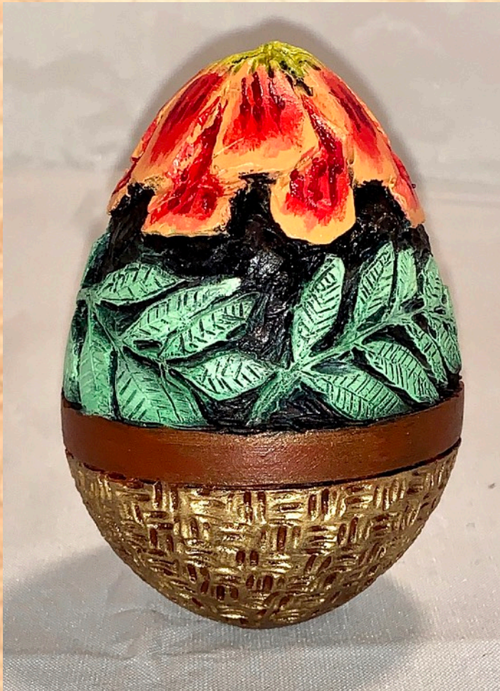
Tim Aley - Egg, painted and textured.