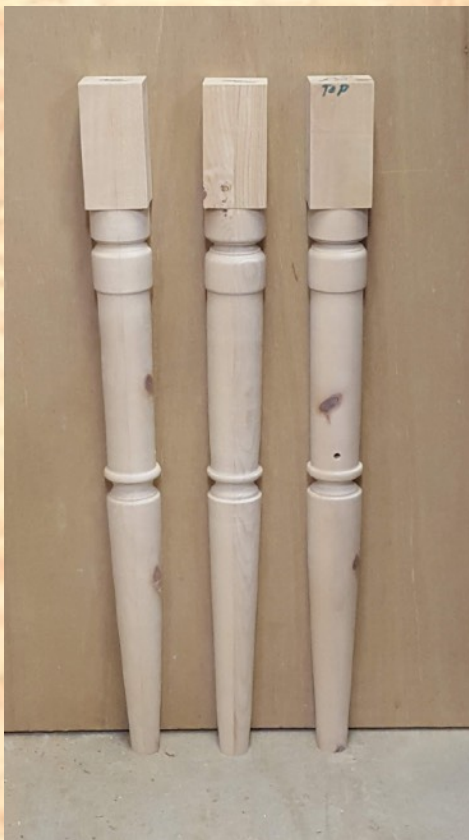
Stephen Price - Set of maple table legs