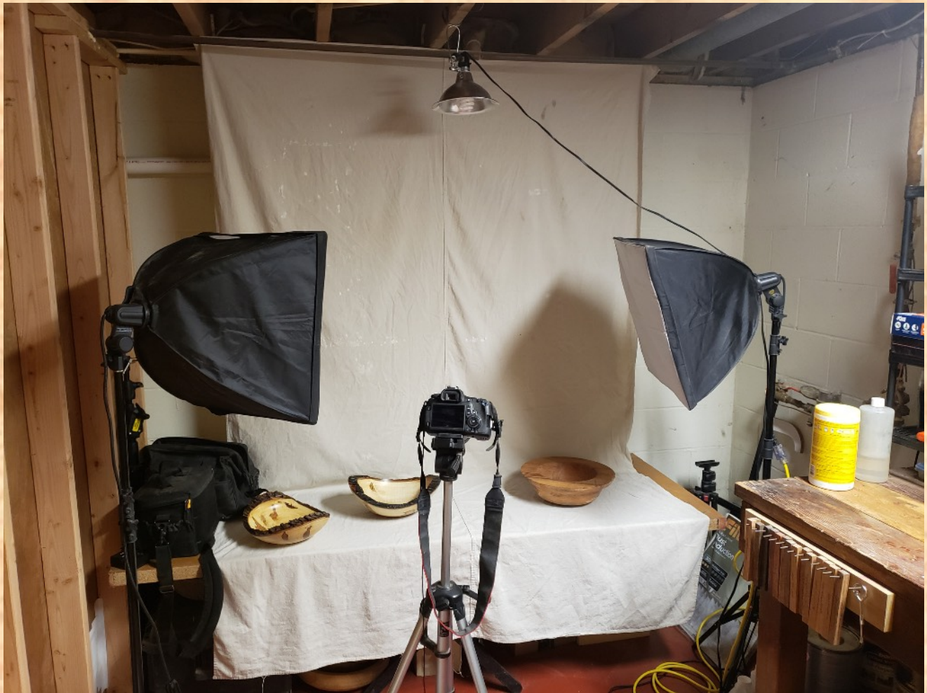
Tom Ankrum - Spray booth doubles as a photo booth, just change the background.