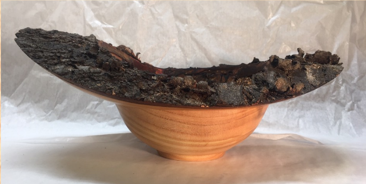
William Flint - Cherry bowl. 10" x 4". finished with Tried and True Original