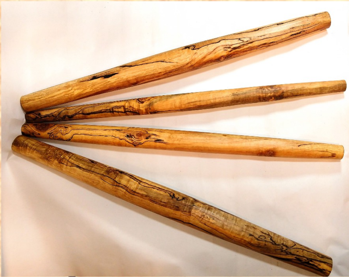
Joe Barnard - French rolling pins, spalted maple, walnut oil finished, roughly 19.5" long, various diameters.