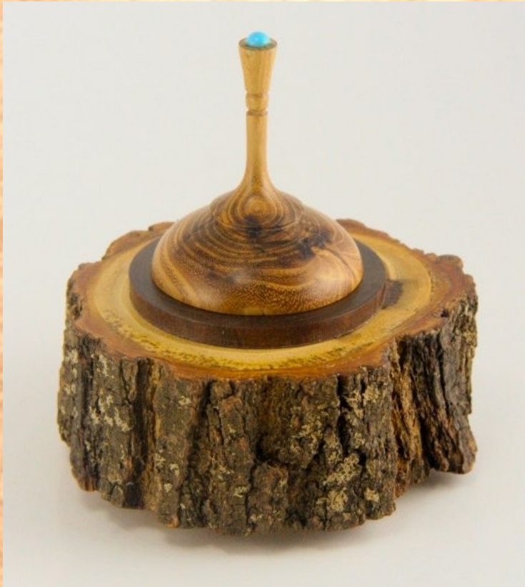
Gary Guenther - "spin-top ring box".