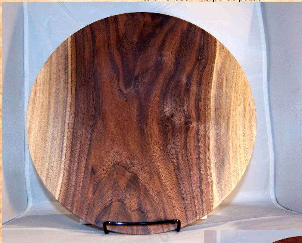
11 1/2" x 1" walnut platter... collaboration between Ellen Davis rough turned and Tim Aley final turned. Finished with oldies Oil

From our virtual meeting in June, the following pieces were shown online. Thanks to all those who participated.