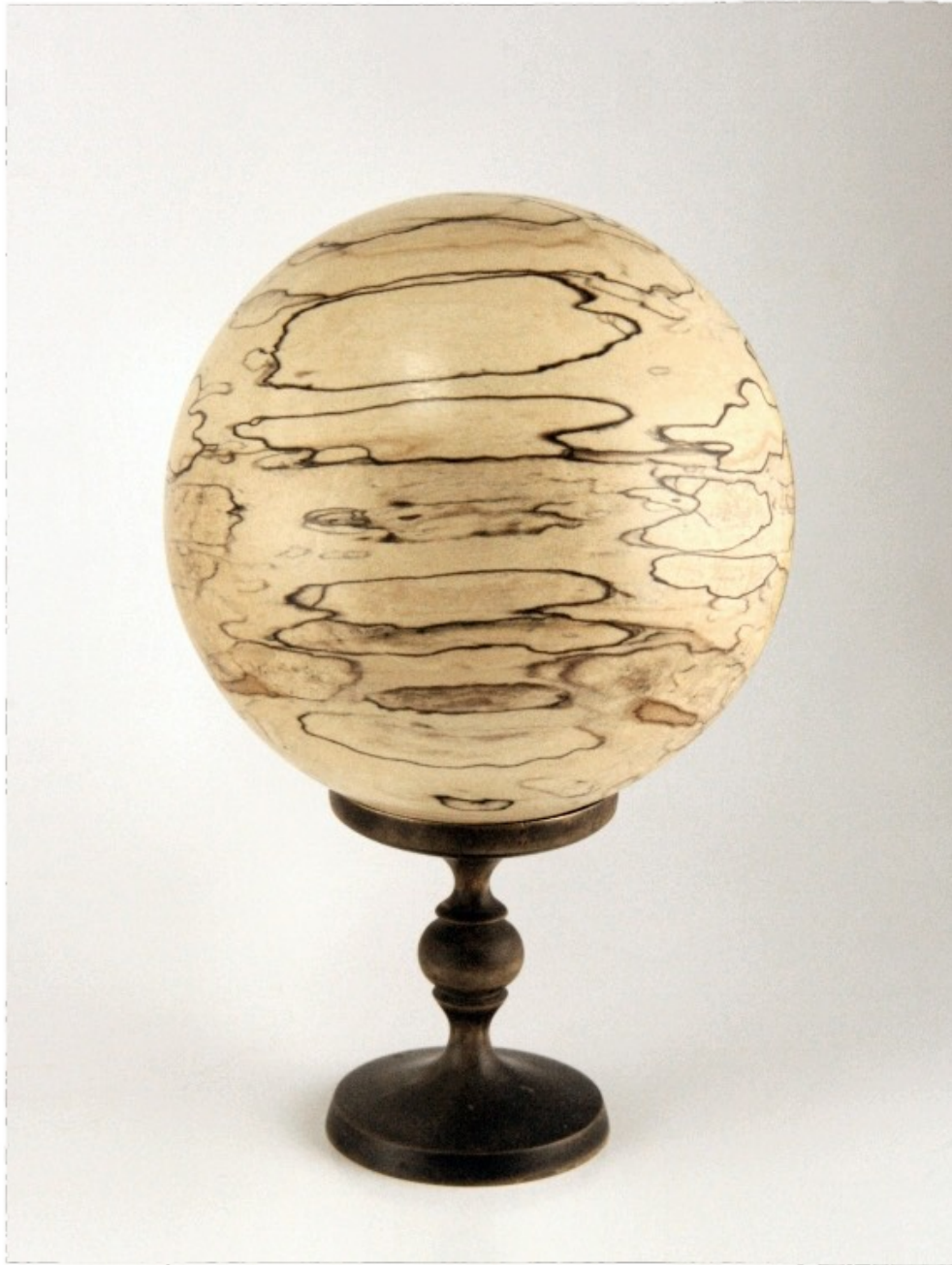
Gary Guenther - Spalted maple sphere