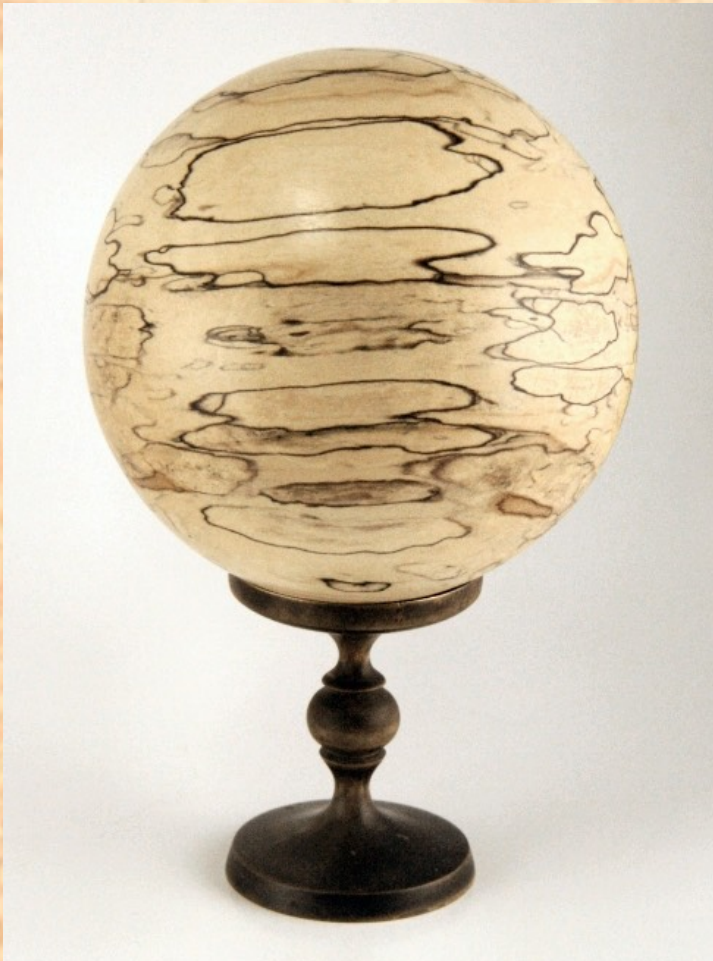
Gary Guenther - Spalted maple sphere 4" diameter