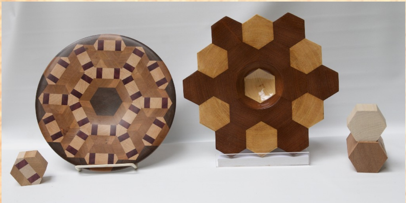
Ken Lobo - On Left - Platter 10" dia - woods are Maple, Purple Heart, Cherry and Walnut. Finish - Mylands On Right --- Bowl 10" dia - woods are Sapele and Poplar. Finish - Poly