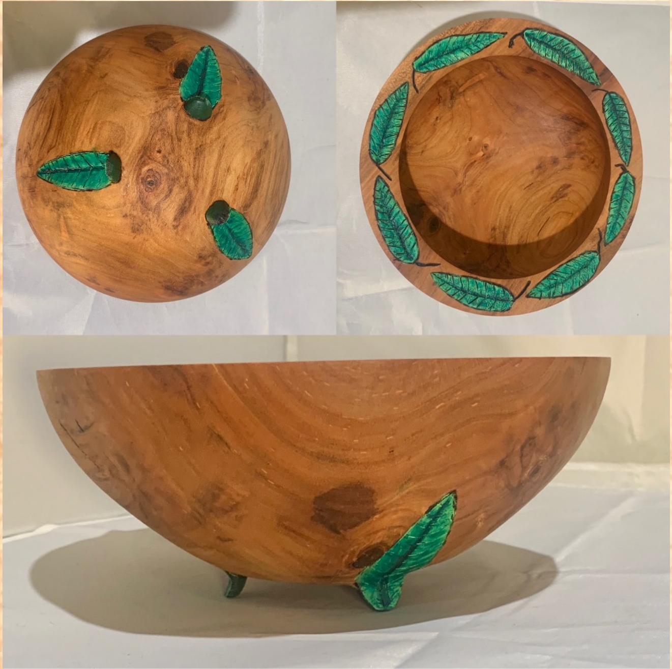
Tim Aley - Leaf bowl. 7" x 2 3/4" Cherry Turned cherry bowl, carved feet with a power rotary carver, burned leaf designs, carved the center of each, redefined the lines, coat of walnut oil, and painted the leaves with acrylic paint.