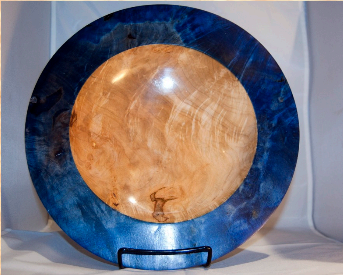
Tim Aley - 11 1/2" x 2" maple platter colored blue with dye. Finished with lacquer and buffed with wax.