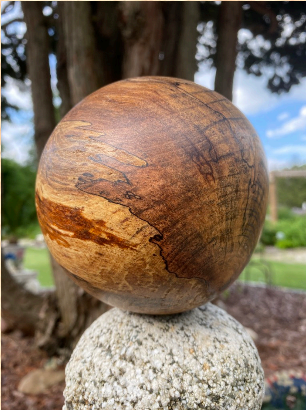
Mike Colella - 3" sphere from old rotted spalted log. Oiled.