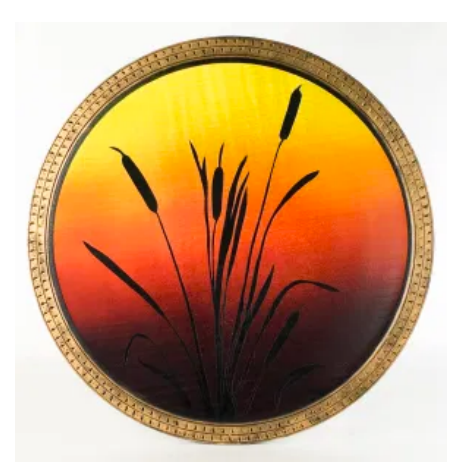
Check out his website at <u>www.thewalnutlog.com</u>

American Woodtuner, June 2018, Woodturning Magazine, November 2018 and St. Louis At Home Magazine, June 2017.