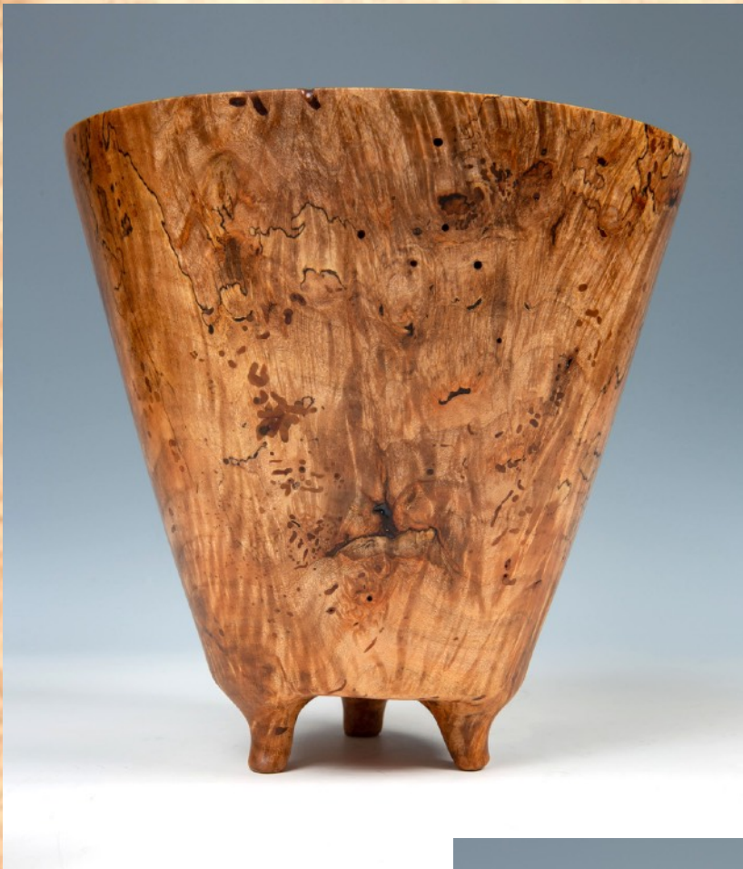
Mike Colella: Spalted Maple, bug holes and voids filled with epoxy resin. Finished with 3 coats of OSMO oil. 8"H x 8"W.