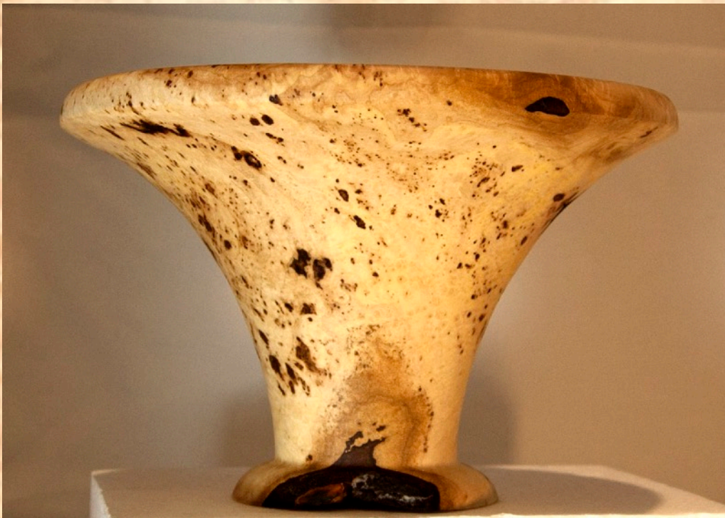
Tim Aley - "Square" is Black Cherry, 7.25 X 5.5