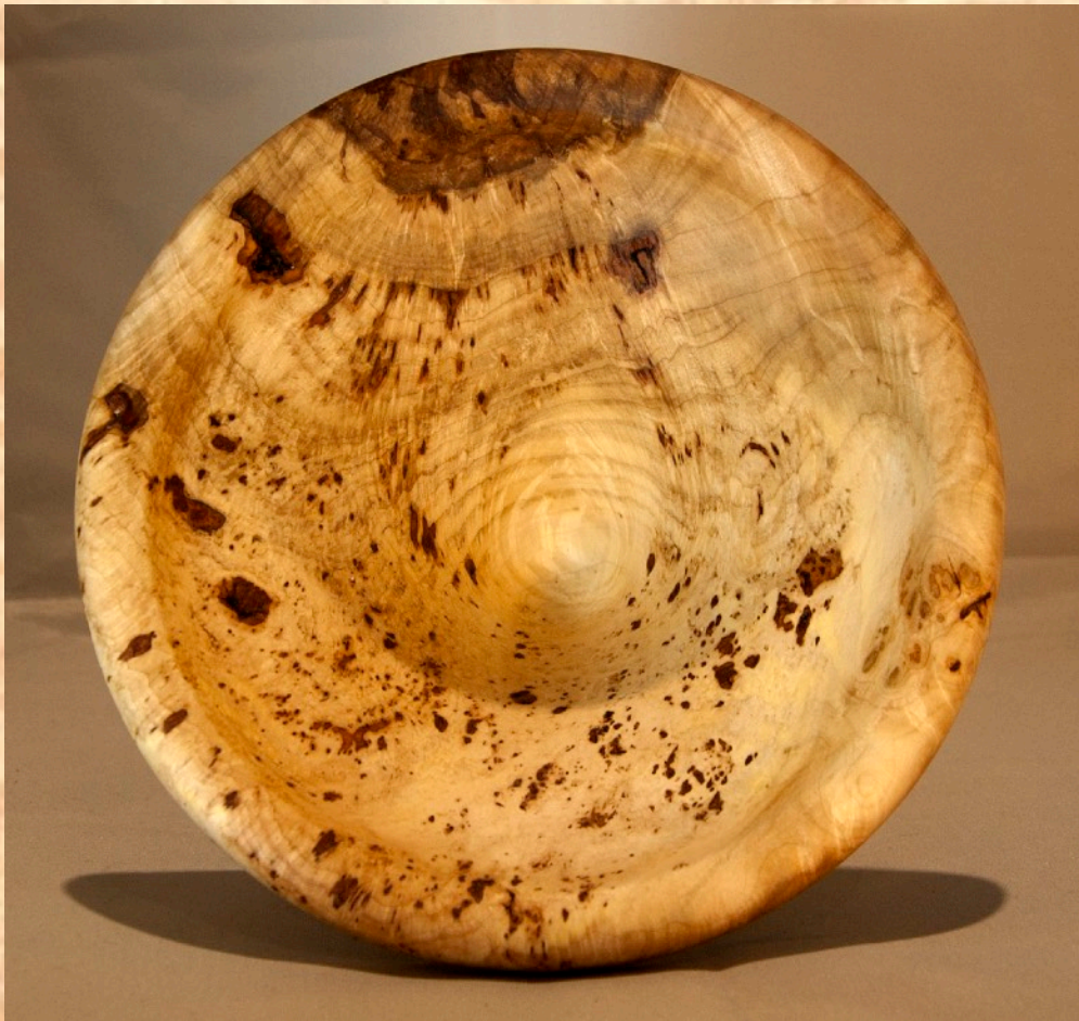
Tim Aley - Vase Wood unknown 7" top d x 3" bottom d x 4 ½" h Odies oil