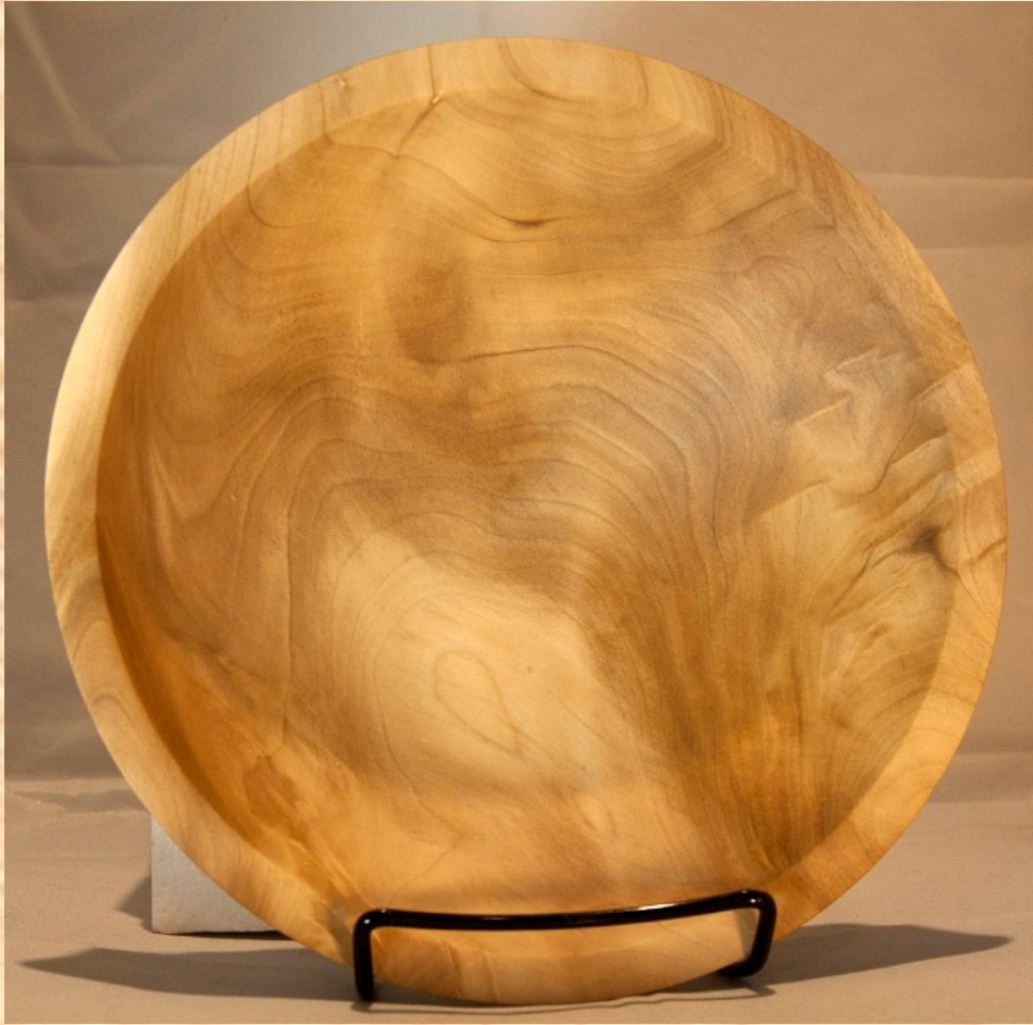
Tim Aley - Bowl, Gum from the Fairgrounds 8 1/2" d x 2 1/4"