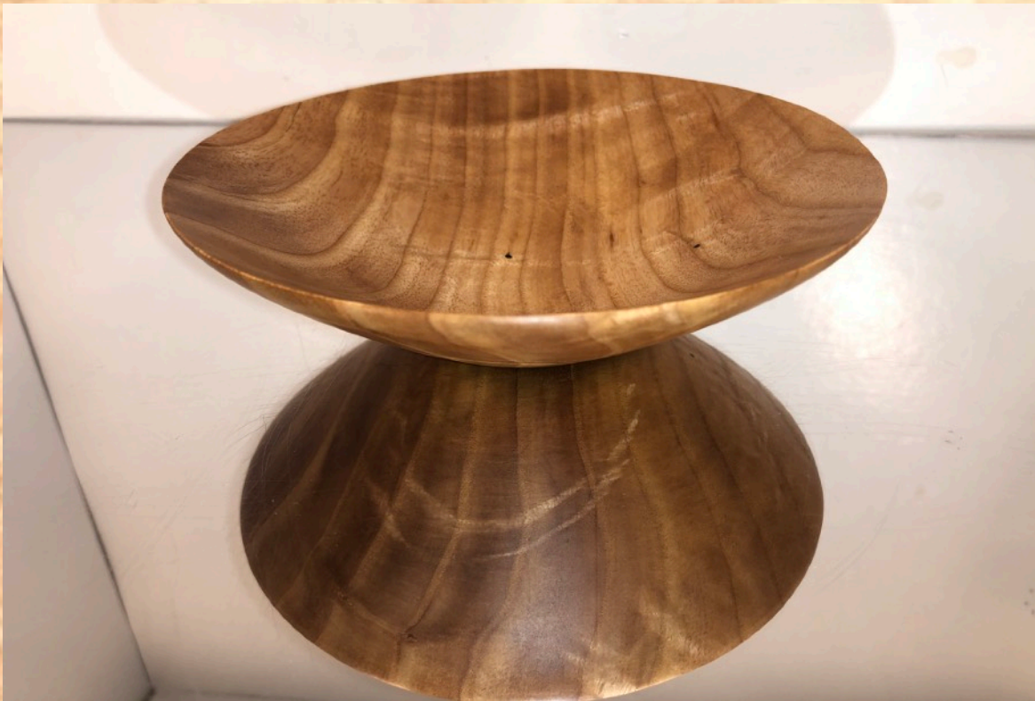
Roman Steichen: Oak bowl 6 x 1.75