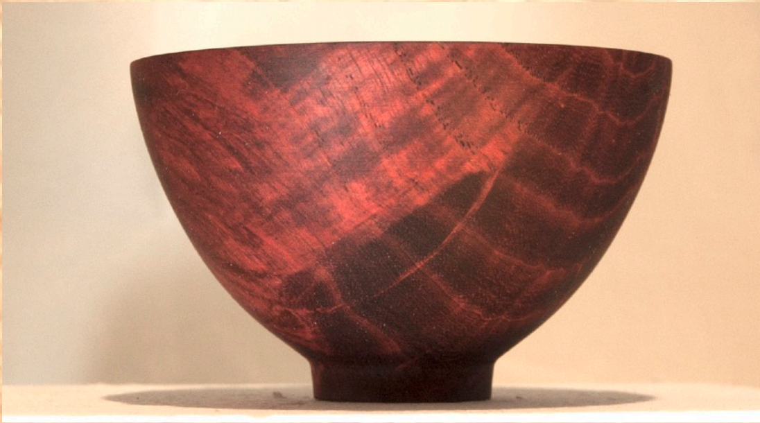
Tim Aley - Wood unknown Transtint dye blue, yellow, red 4" d x 2 1/4" h