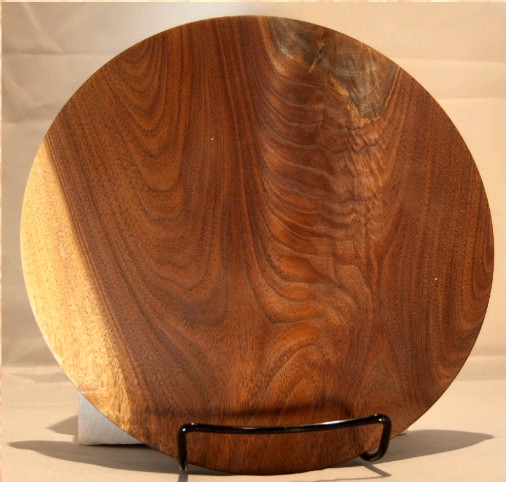
Tim Aley - Walnut platters 10" and 9" Odies oil