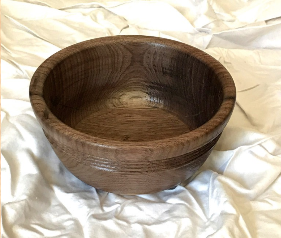
Frank Kirschner: Walnut bowl

From our virtual meeting in August, the following pieces were shown online. Thanks to all those who participated.