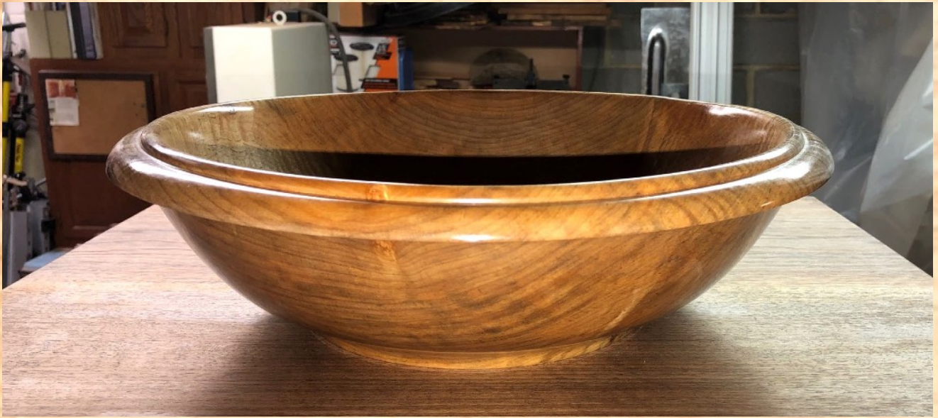
Paul Mazzi: "Repurposed Salad Bowl" Red fiddle back maple, Dia. 15" x Height 5", pop up mushroom drain 1 1/2" with maple cover. Finish is 2 coats of System 3 epoxy sealer and 3 coats of Minwax wipe on gloss polyurethane.