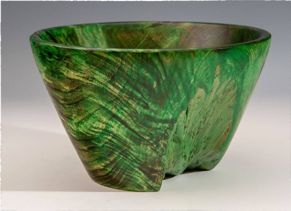
Mike Colella: Quilted Maple green alcohol dye over black. 6 x 4 with some natural tree surface on side.