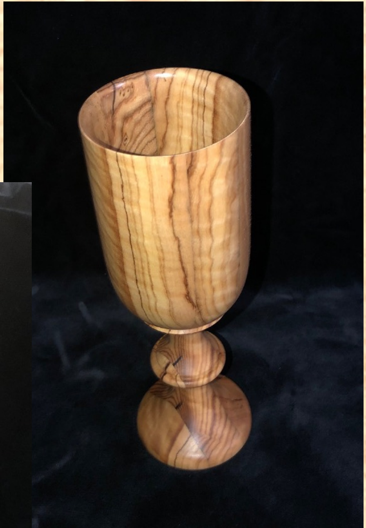
Paul Mazzi: Laminated Olive wood chalice. 2 1/2" dia. x 7 3/4" tall. Finish is Tightbond CA thin on the inside and outside is System 3 epoxy sealer with three coats wipe on flat poly.