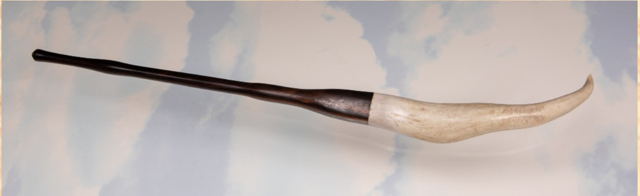
Mike Colella: Magic Wand of African Blackwood wand and deer antler handle, sanded to 1200, oiled and buffed to gloss. 17"