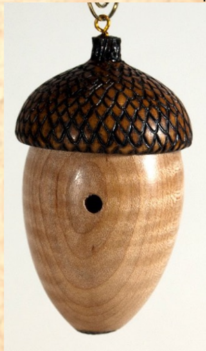
Tim Aley - acorn ornament - 3" x 1" [maple, cherry, pyrography]