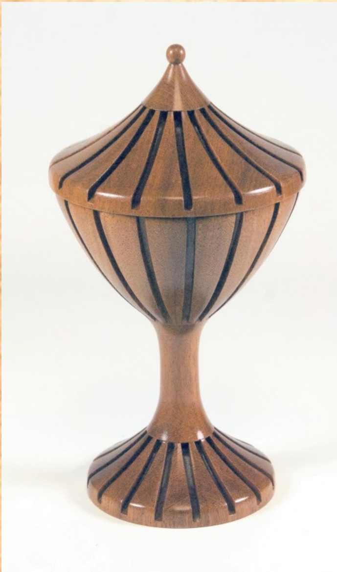
Ken Lobo - goblet - 7.5" x 4" [sapele] router carved; finished with lacquer.