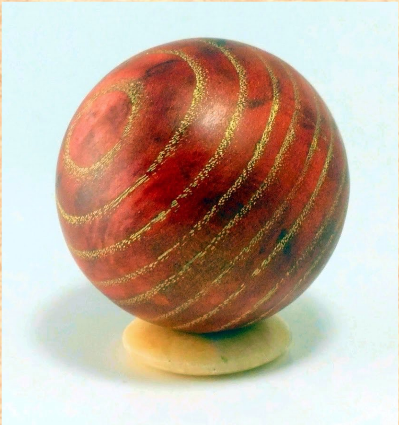
Gary Guenther "DRL" - sphere - 2.38" diameter [spalted hickory] brass brush, wood bleach, TransTint dyes, spray acrylic, Jolie gilding wax, paste wax. A good use for one-quarter of a cracked bowl blank.