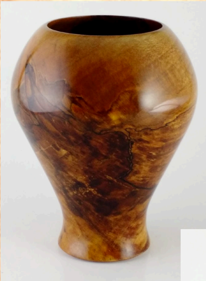
Bill Long "From Water to Wine to Shape and Shine" - urn - 4.75" x 3/75" [spalted maple burl] finished with Watco Danish Oil, U Beaut EEE Ultra Shine, and Simoniz carnauba wax