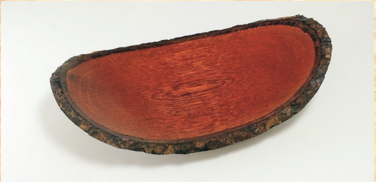
Gary Guenther "Upstairs Downstairs" - bark-edge oval shallow bowl - 2.25" x 8.25" x 4.5" [white oak] ammonia fumed; bottom: Watco Danish Oil; top: TransTint dyes, acrylic spray, black patinating wax, paste wax