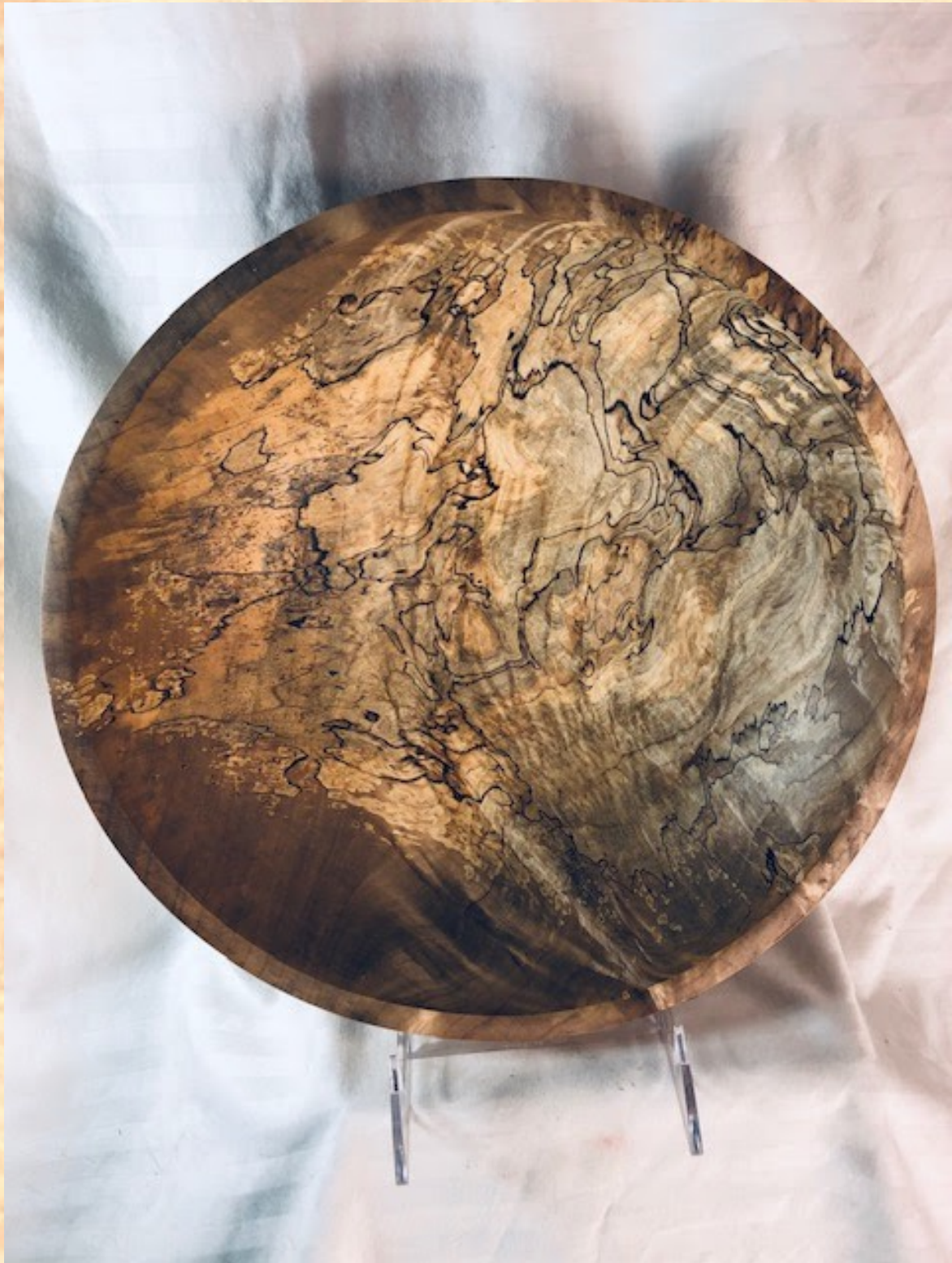
Richard Webster - bowl - 4" x 12" [spalted maple]