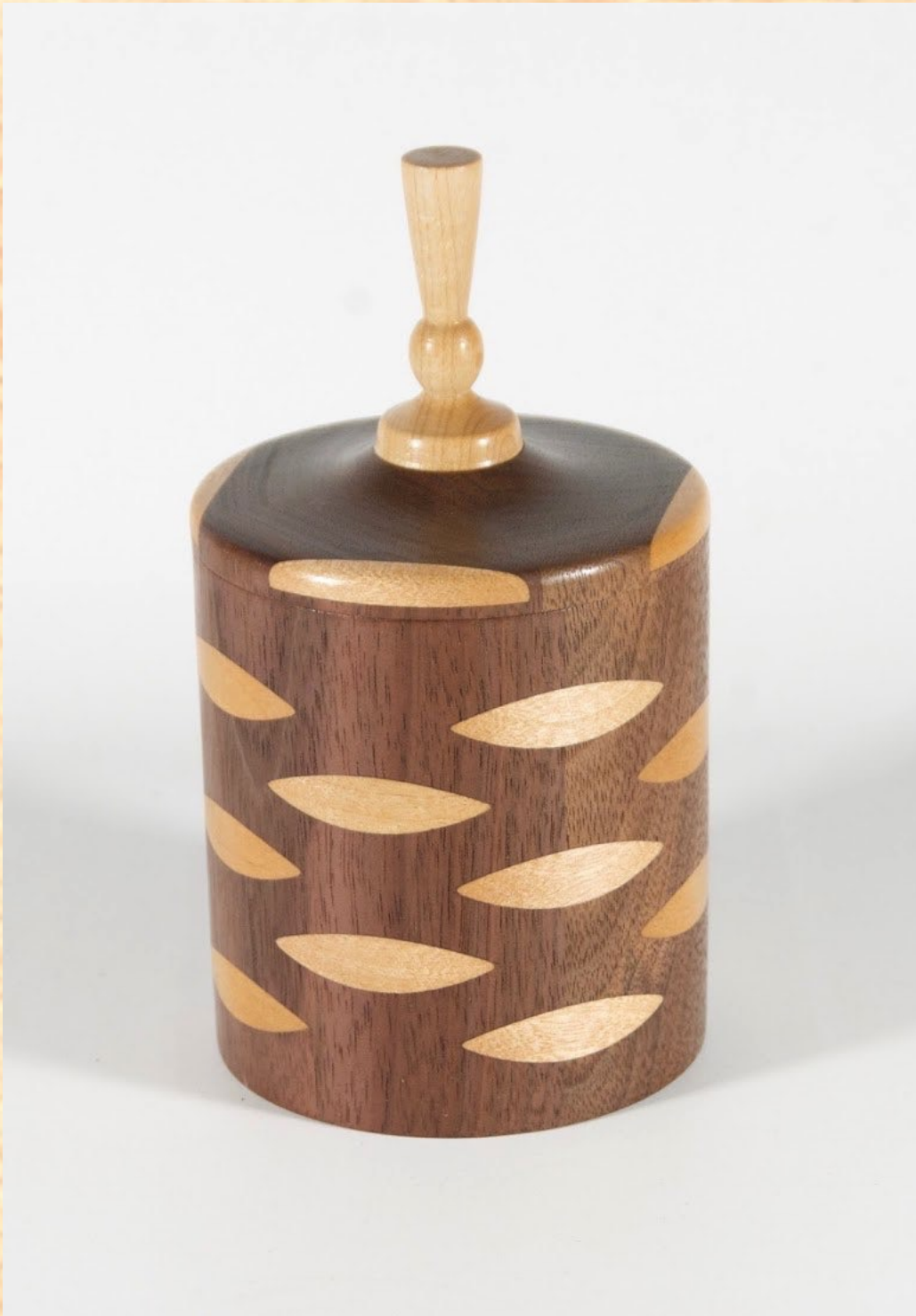
Ken Lobo - end-grain box - 5" x 3" [walnut, inlaid maple]; finished with poly