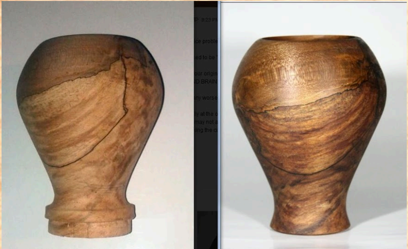
Bill Long "From Water to Wine to Shape and Shine" - urn - 4.75" x 3/75" [spalted maple burl] - finished with Watco Danish Oil, U Beaut EEE Ultra Shine, and Simoniz carnauba wax - before and after, completed and finished by Gary Guenther