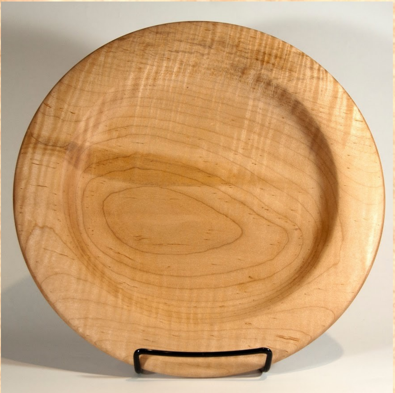
Tim Aley - plate - 1" x 10" [maple]