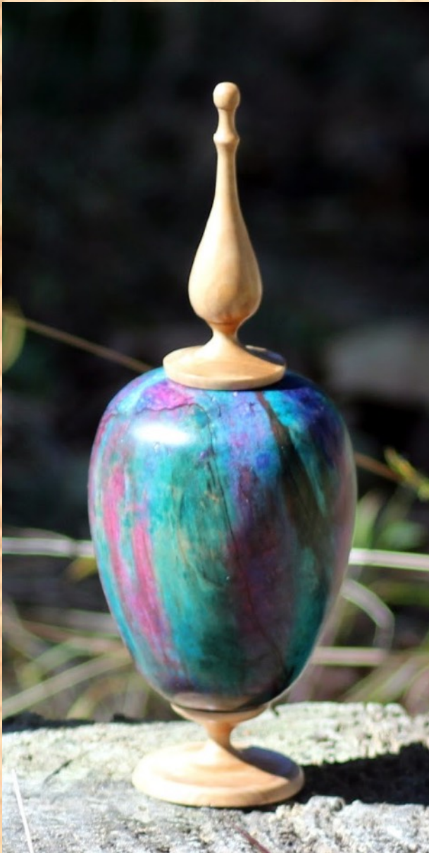
Joe Barnard - box - 8" x 2.75" [spalted maple hollow body, maple lid/finial and foot] dyed with a variety of colors for interest.