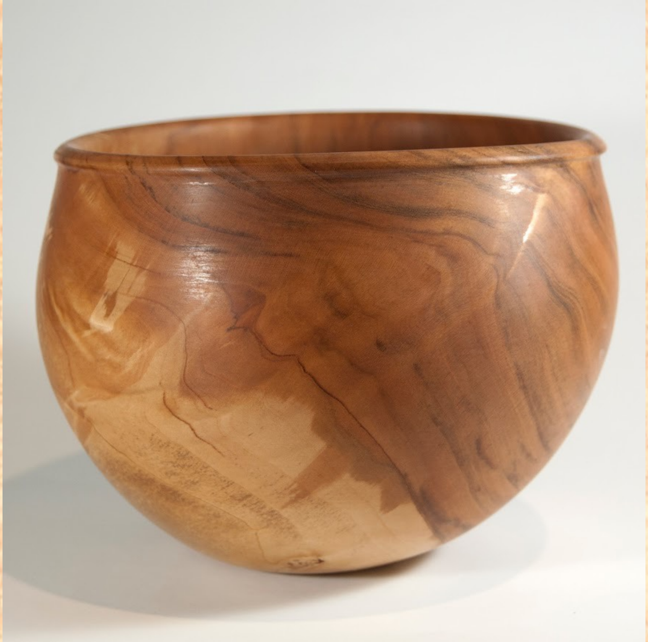
Tim Aley - natural-edge bowl with lichen - 2" x 6" [southern red oak]