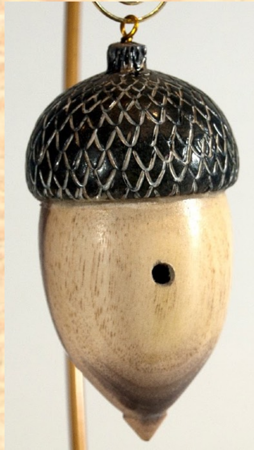
Tim Aley - acorn ornament w/ burned, painted, lime waxed cap - 3" x 1" [walnut, cherry, acrylic paint, liming wax]