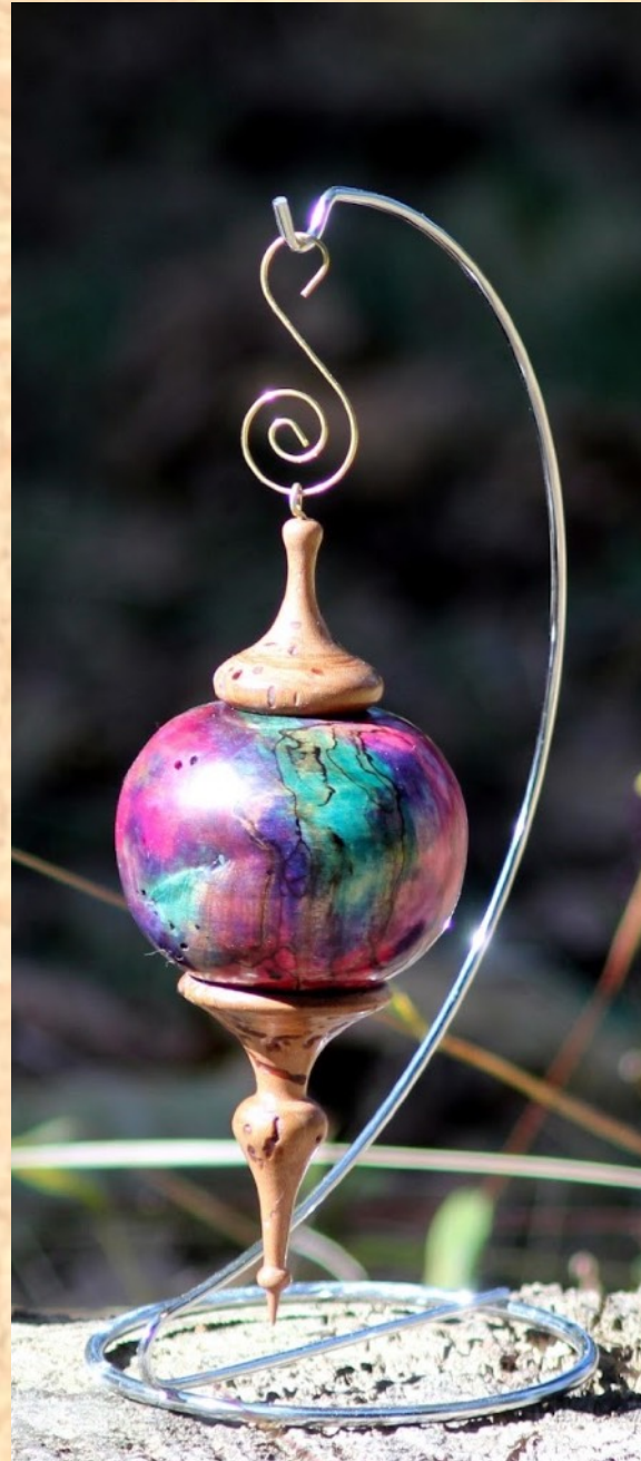
Joe Barnard - holiday tree ornament - 6" x 2.75" [spalted maple] hollow body dyed with a variety of colors for interest.