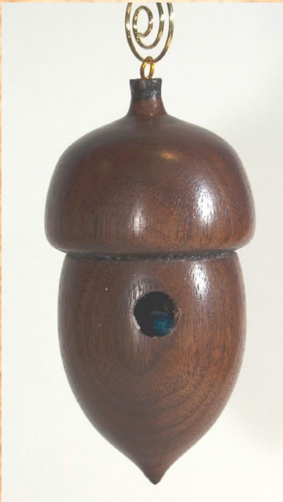
Tim Aley - acorn ornament with nest/egg inside - 3" x 1" [walnut, shavings, acrylic egg]