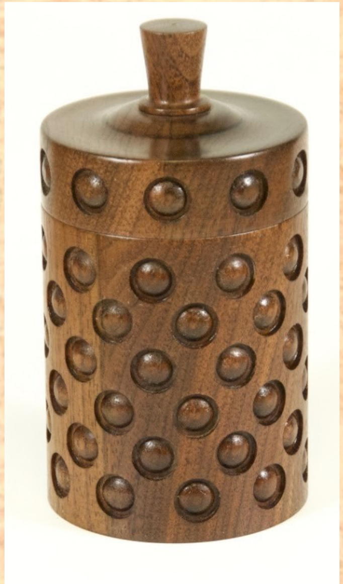
Ken Lobo - end-grain box - 5" x 3" [walnut] embellished with a router plunge button