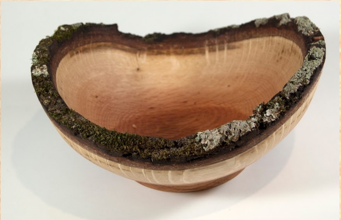
Tim Aley - natural-edge bowl with lichen - 2" x 6" [southern red oak]