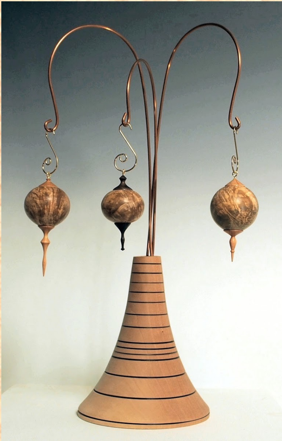
Jeff Struewing - ornaments - maple with cherry (2) or walnut (1) finials - (2.5" - 4") H x 1.5" D