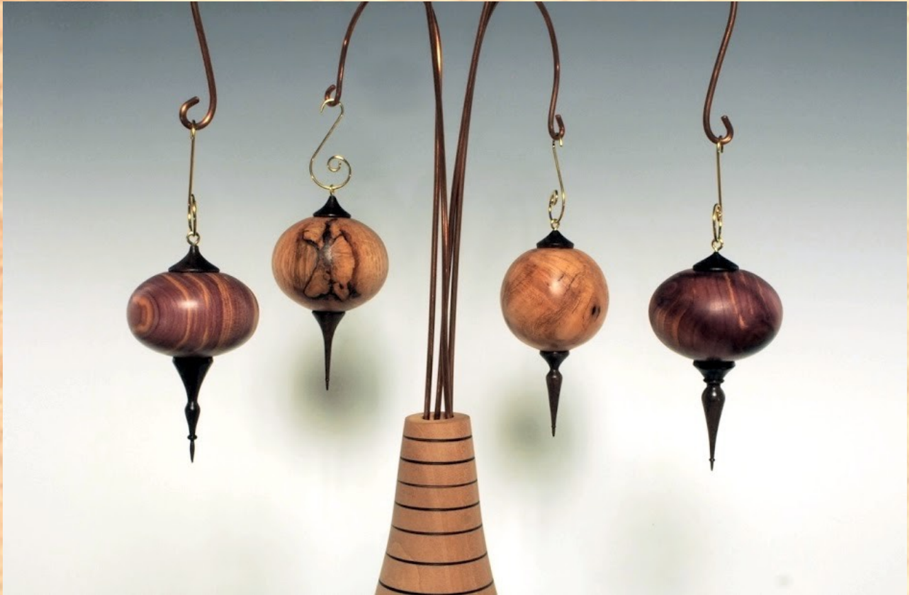
Jeff Struewing - ornaments - 2 cedar, 1 oak, 1 cherry, with walnut finials - (2.5" - 4") H x (1.5 - 2") D