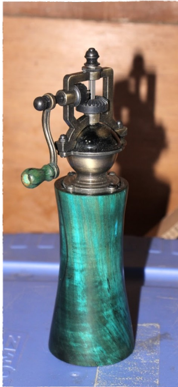
Joe Barnard pepper grinder - [highly figured spalted maple] - 8"x3"x4", finished with boiled linseed oil followed by CA, giving it a hard finish with a lot of depth.