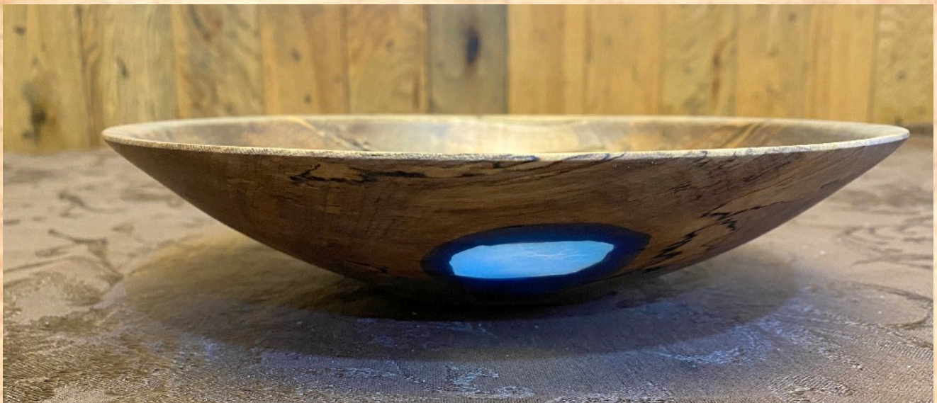
Mike Colella - Ambrosia maple with blue resin fill - 3' x 8"