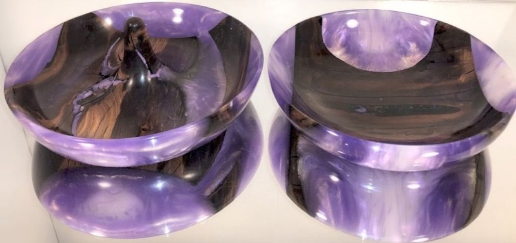
Roman Steichen - ring bowl and jewelry bowl set - [crabapple stabilized in purple cactus juice, surrounded by Alumilite resin] - ring bowl is 2.5" x 6"; jewelry bowl is 1.25" x 5.5"