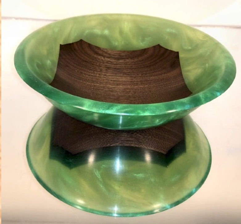
Roman Steichen - "Walnut chip of the block" - [walnut block encased in Ecopoxy] 1.75" x 6.25" - David Rudin made the blank; Matt Radtke roughed it out; and I finished it.