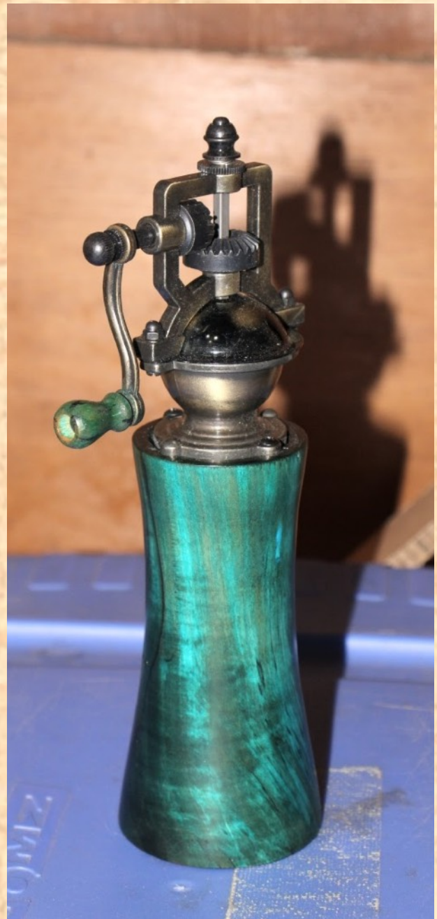
Joe Barnard - pepper grinder - [highly figured spalted maple] - 8"x3"x4", finished with boiled linseed oil followed by CA, giving it a hard finish with a lot of depth.