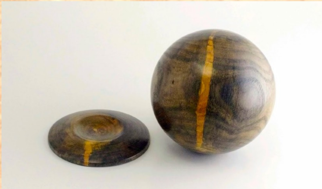
Gary Guenther - "Stinker" on "Of the Same Stripe" - sphere and matching base - [spalted Bradford pear] - 3.5" diameter -made from the same blank; accidentally self-spalted in a black plastic bag.