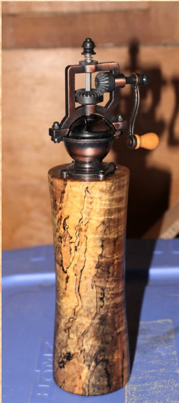
Joe Barnard - pepper grinder - [highly figured spalted maple] - 8"x3"x4", finished with boiled linseed oil followed by CA, giving it a hard finish with a lot of depth.