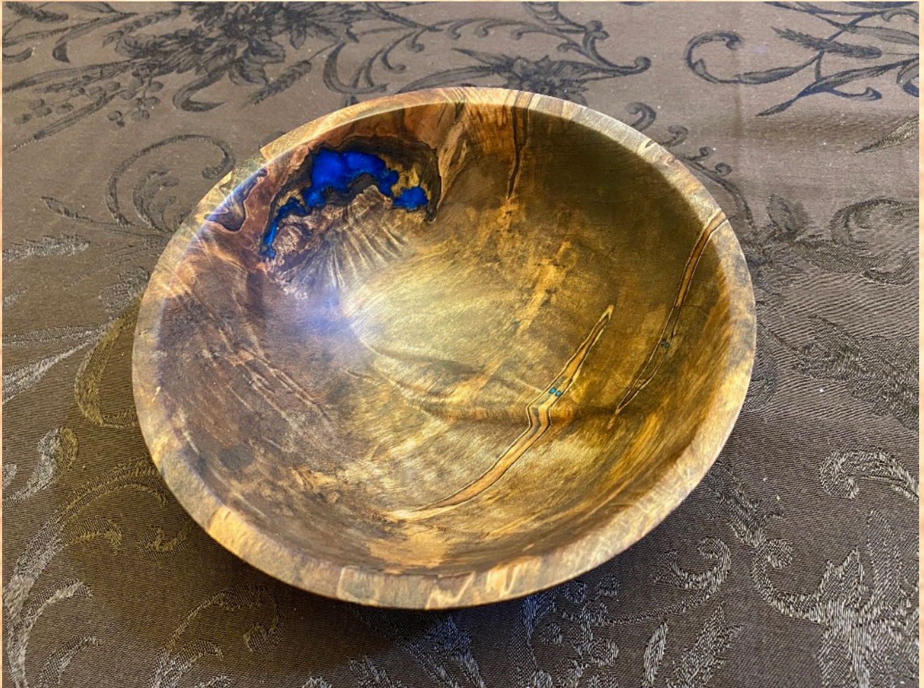
Mike Colella - Ambrosia maple with blue resin on side - 3 x 7"