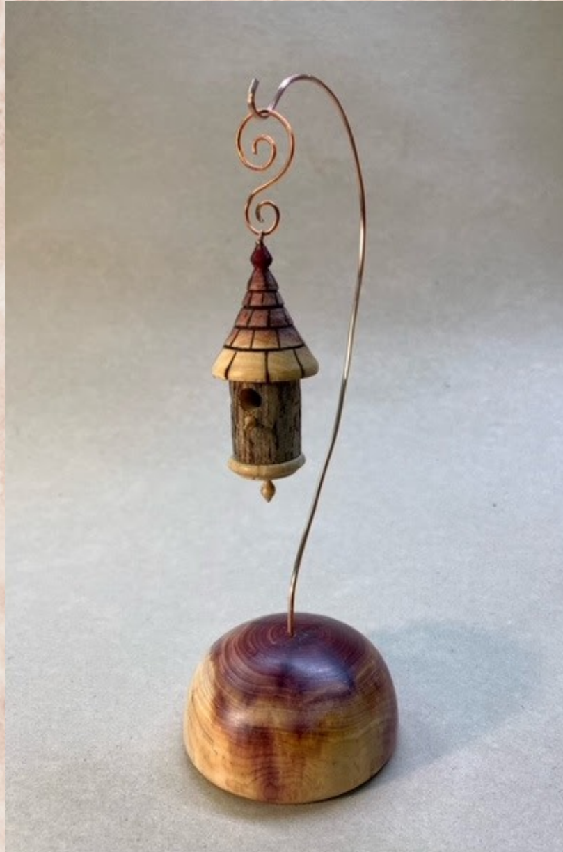
Bob Browning - birdhouse ornament - 3" tall on stand [Eastern red cedar roof, blueberry body, spalted maple floor and maple perch; Eastern red cedar base with brass wire; copper wire hanger]