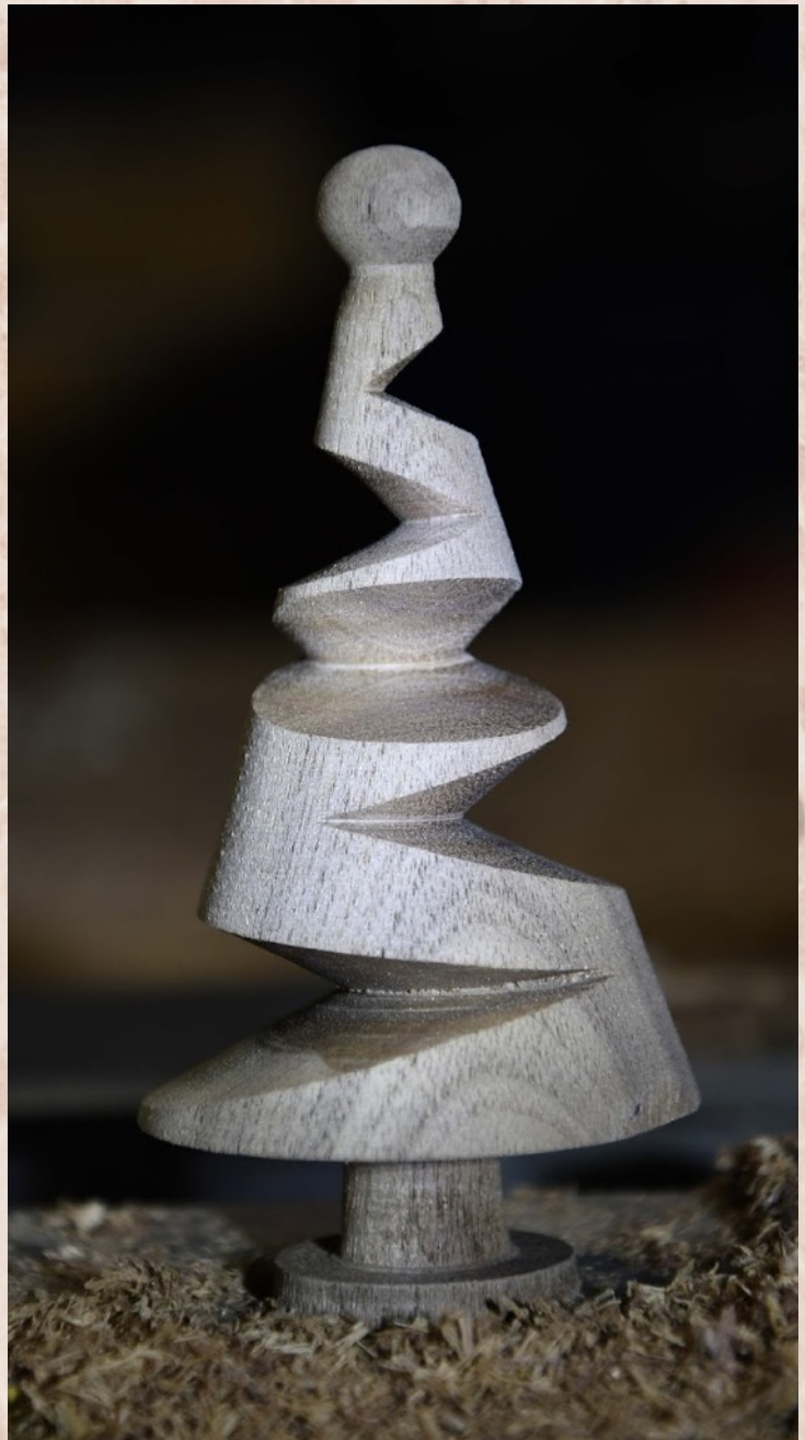
Duane Schmidt - multi-axis tree ornament, in process - 4" x 2" [black walnut, unfinished] "prototype exercise"