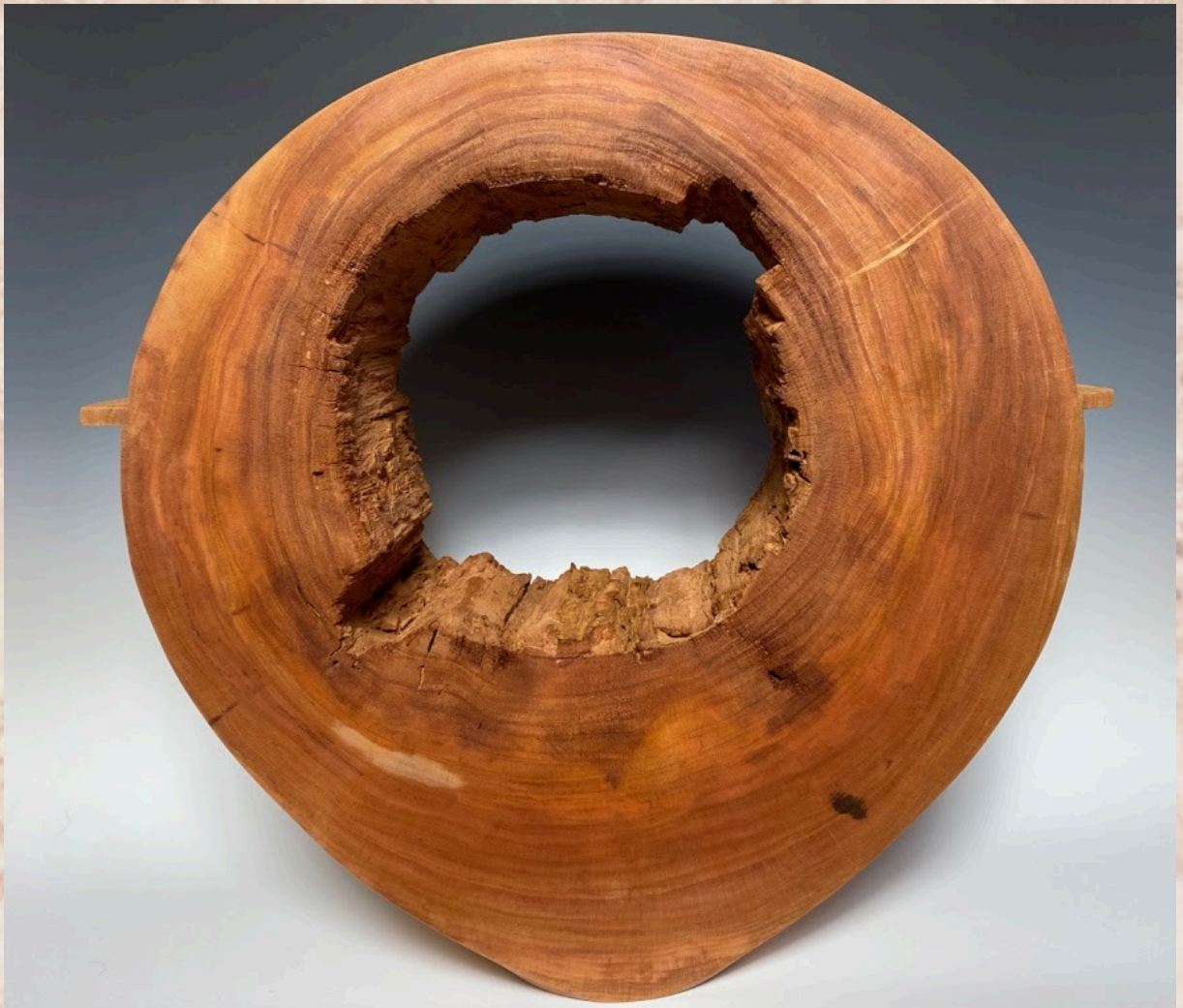
Jeff Struewing - natural "hollow" form 17" x 16" x 5" [cherry] in process