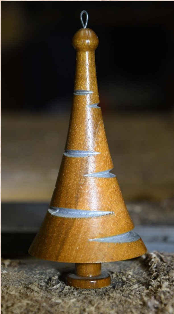
Duane Schmidt - tree ornament 4" x 2" [black walnut, with enamel paint and lacquer finish].