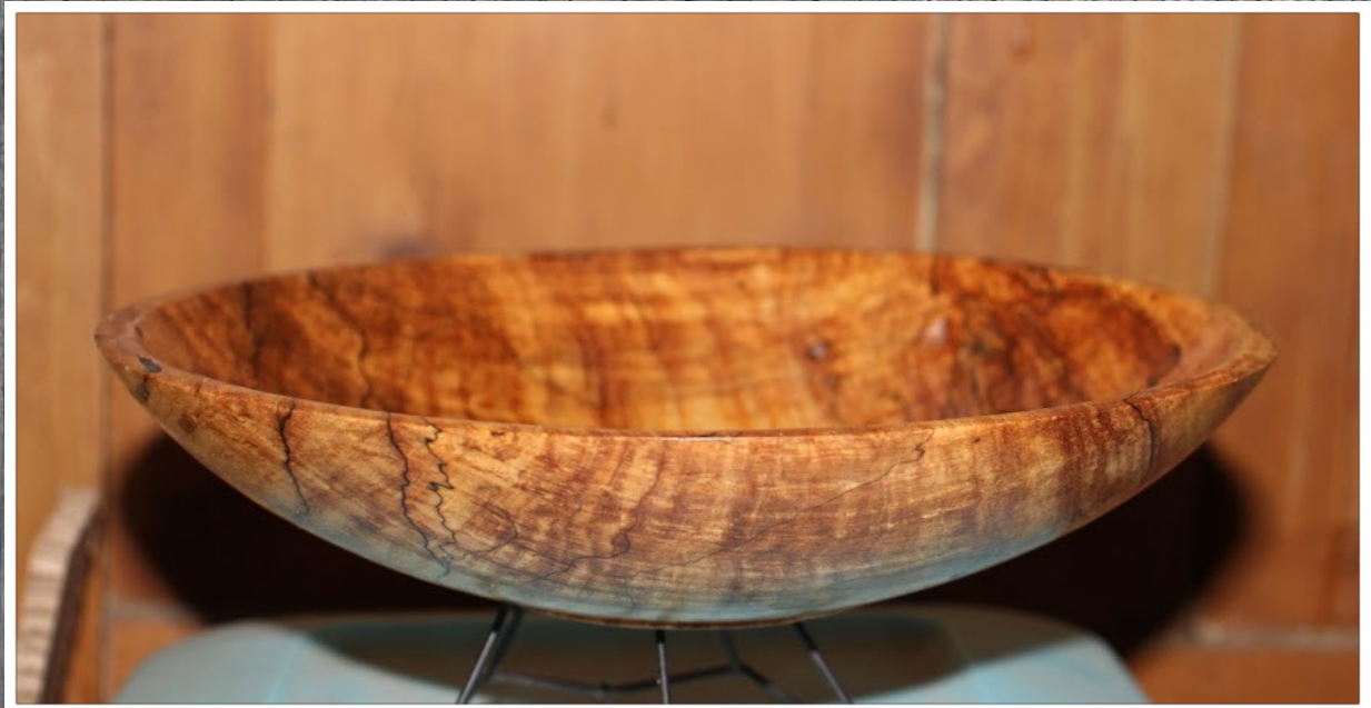
Joe Barnard Joe Barnard - bowl - 2-14" x 10" [spalted figured maple]