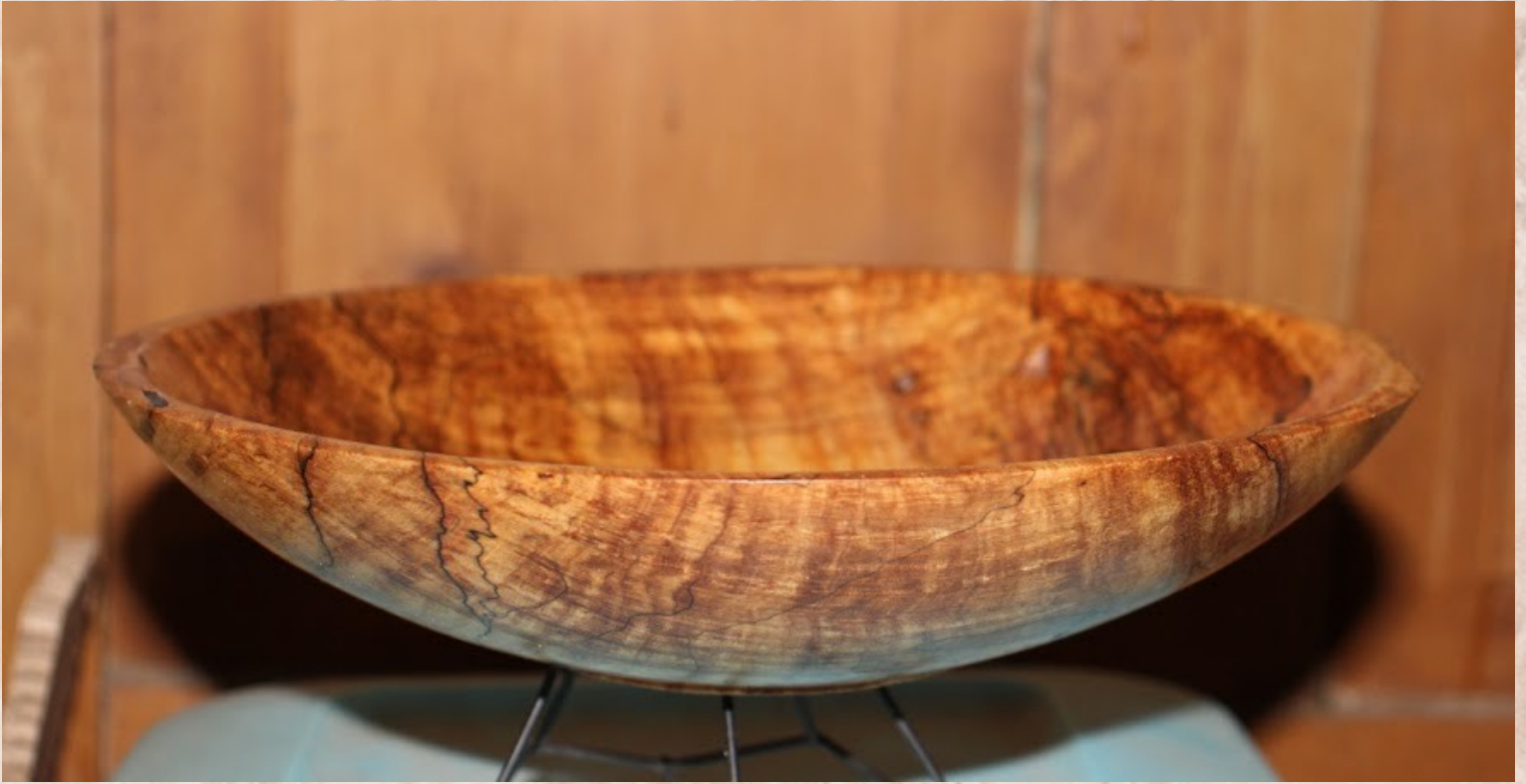
Joe Barnard - bowl - 2-14" x 10" [spalted figured maple]