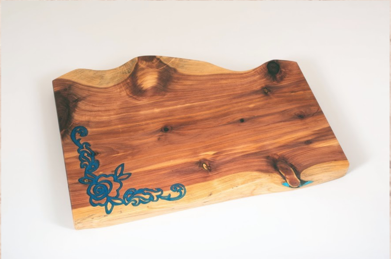
Mike Colella - cutting board 10"x 15" [cedar with CNC-cut design filled with blue resin] OSMO oil finish