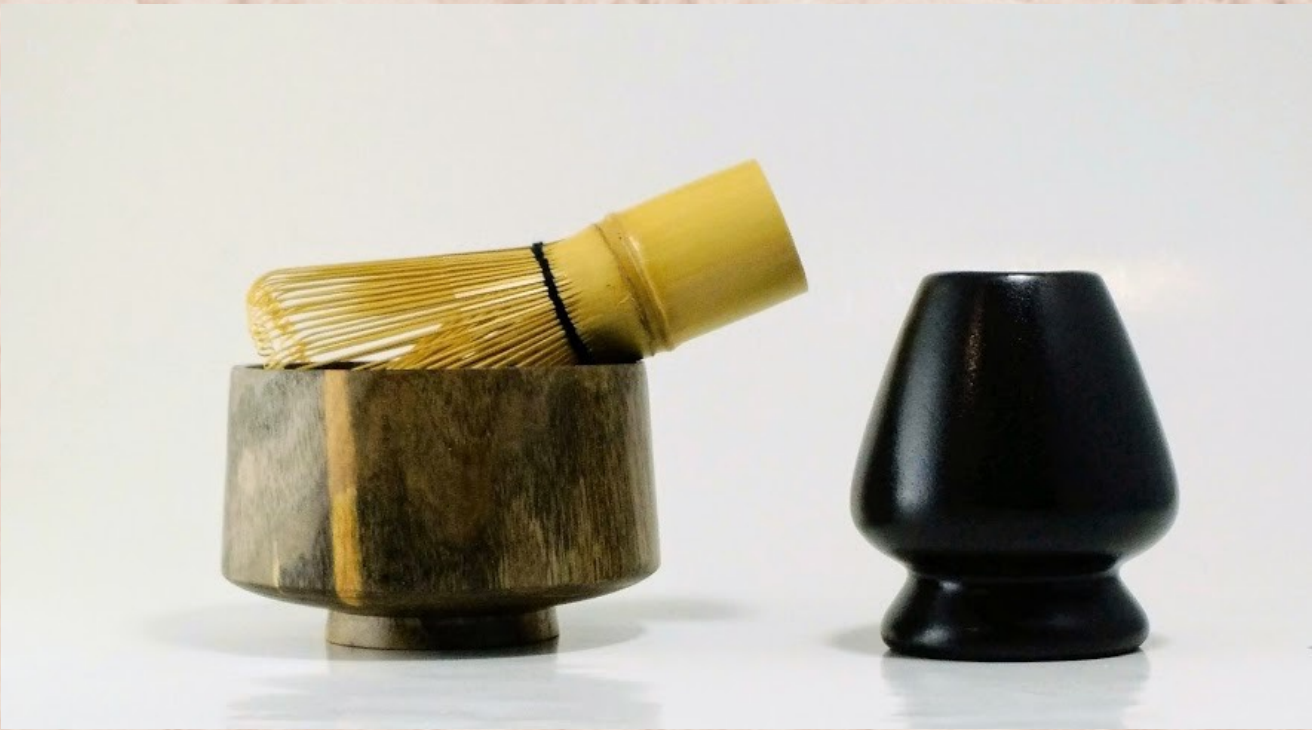
Gary Guenther "Quest" - chawan (tea bowl) 2-1/8" x 3-1/2" [black-spalted Bradford pear] finished with Watco Danish Oil; also shown with chasen (powdered green tea whisk) and its stand.