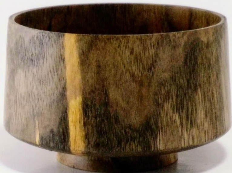
Gary Guenther "Quest" - chawan (tea bowl) 2-1/8" x 3-1/2" [black-spalted Bradford pear] finished with Watco Danish Oil