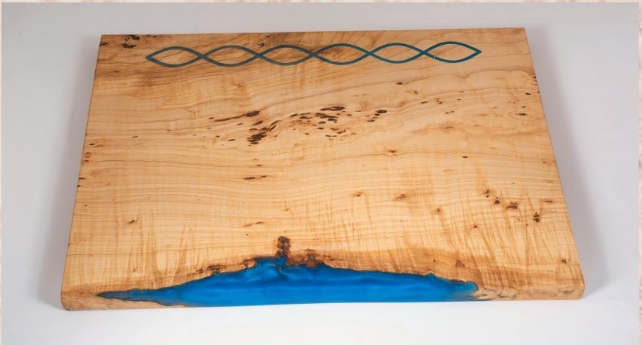
Mike Colella - cutting board 12" x 16" [maple with CNC-cut design filled with blue resin, and resin on one natural-edge side] OSMO oil finish