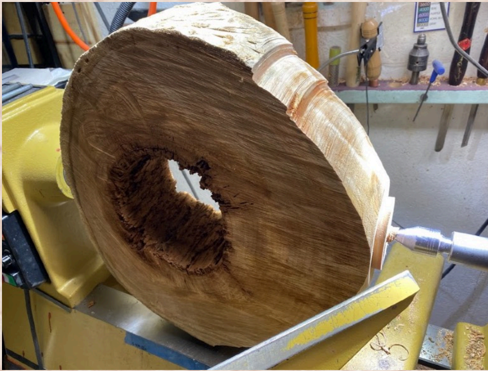
Jeff Struewing - natural "hollow" form cookie [cherry]