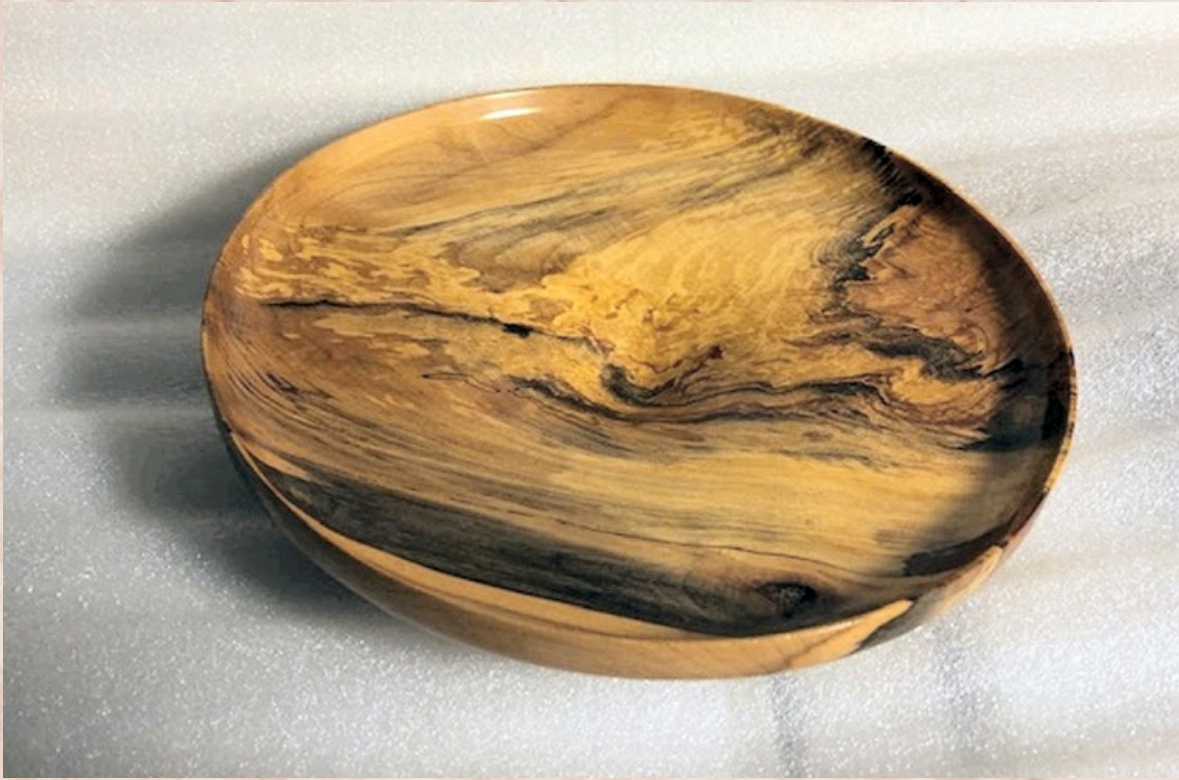
Elliot Feldman Platter - Spalted Cherry Crotch - 1.5 x 9