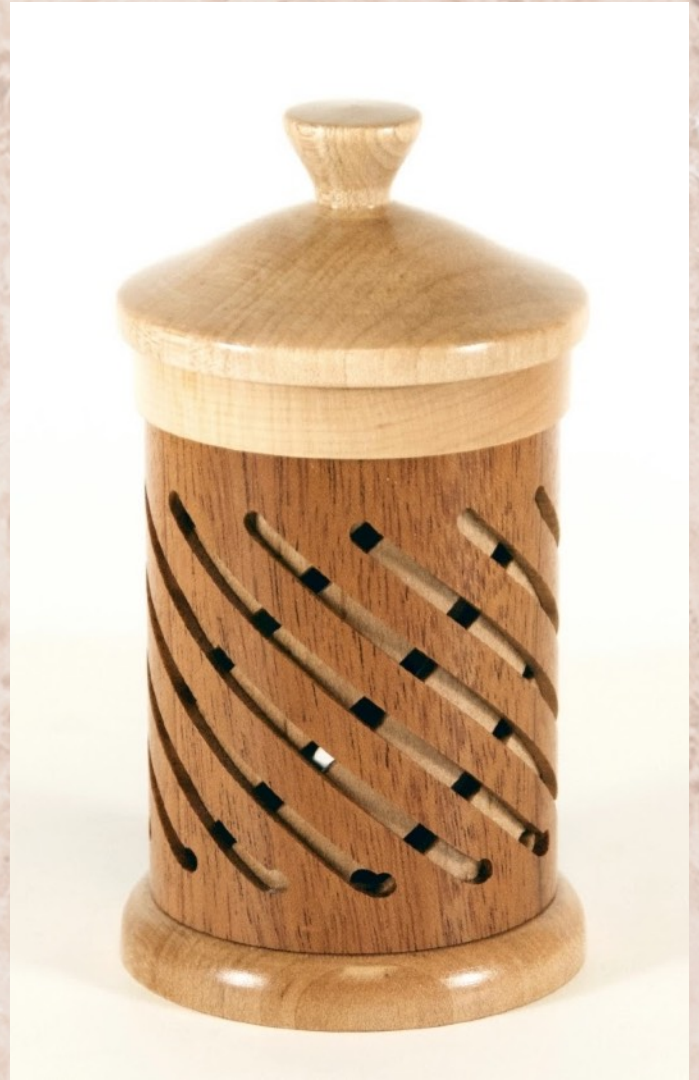
Ken Lobo - Box

4.38" x 2.56" Body wall thickness 0.15" with six spirals; sleeve wall thickness 0.07" with 12 spirals. body and retainer - maple; sleeve - sapele; first cap - maple; alternate caps: maple and sapele