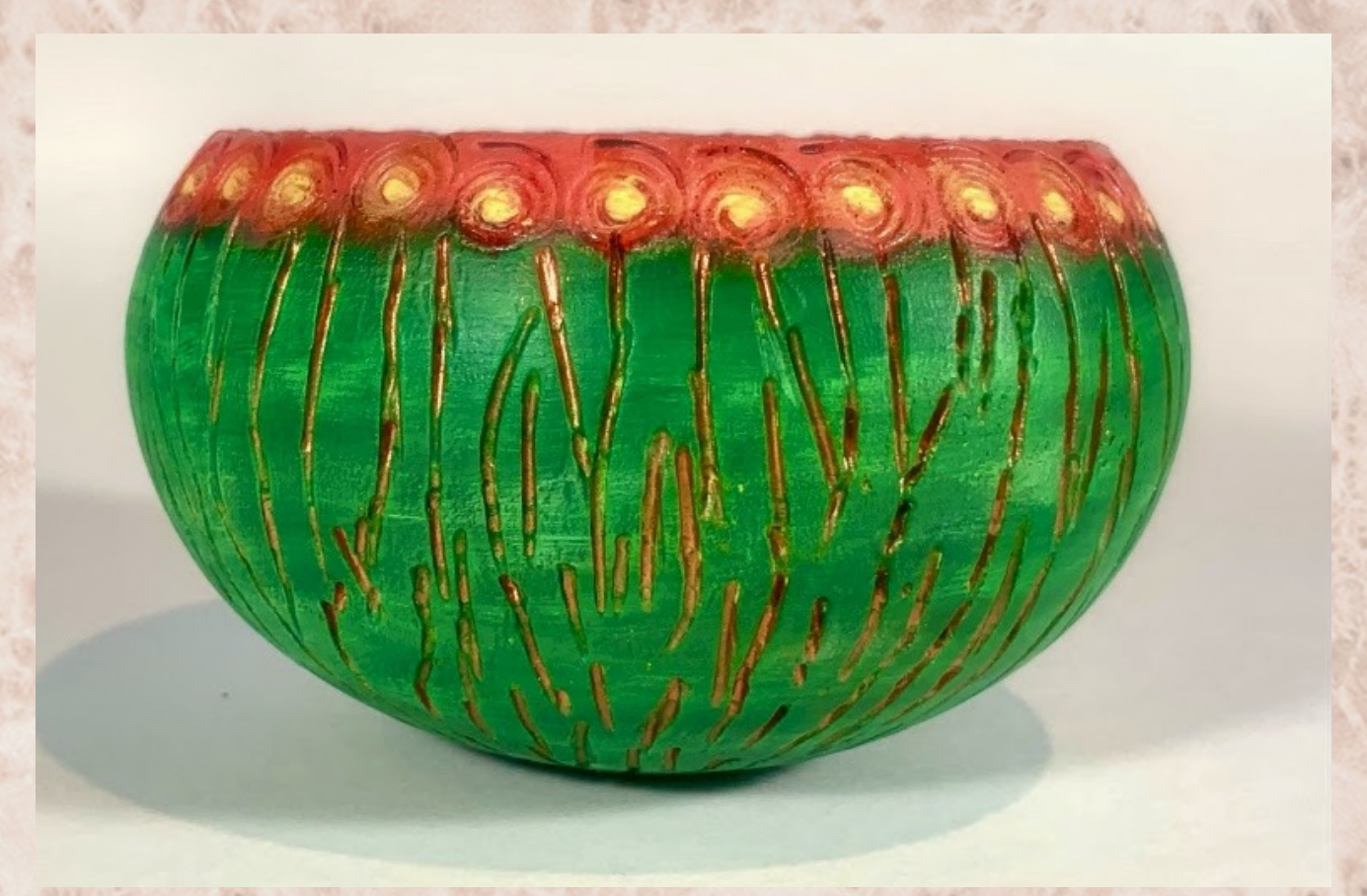
Tim Aley "Spring Flowers" 2" x 4" sycamore pyrography carving, acrylic paint