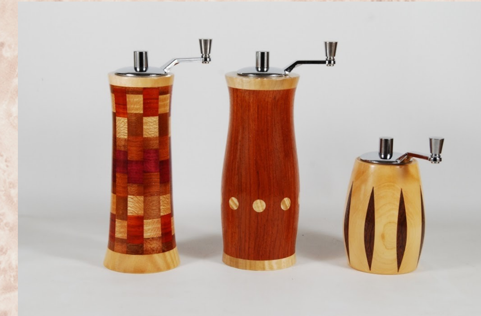
Ken Lobo three pepper grinders 1. multi woods, 7.5"H; 2. Jatoba., 7.5"H; 3. Apple, 3.5"H shellac sealer with poly topcoats