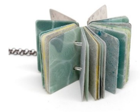
"Swimming Pool Pendant" by Alice Kresse.