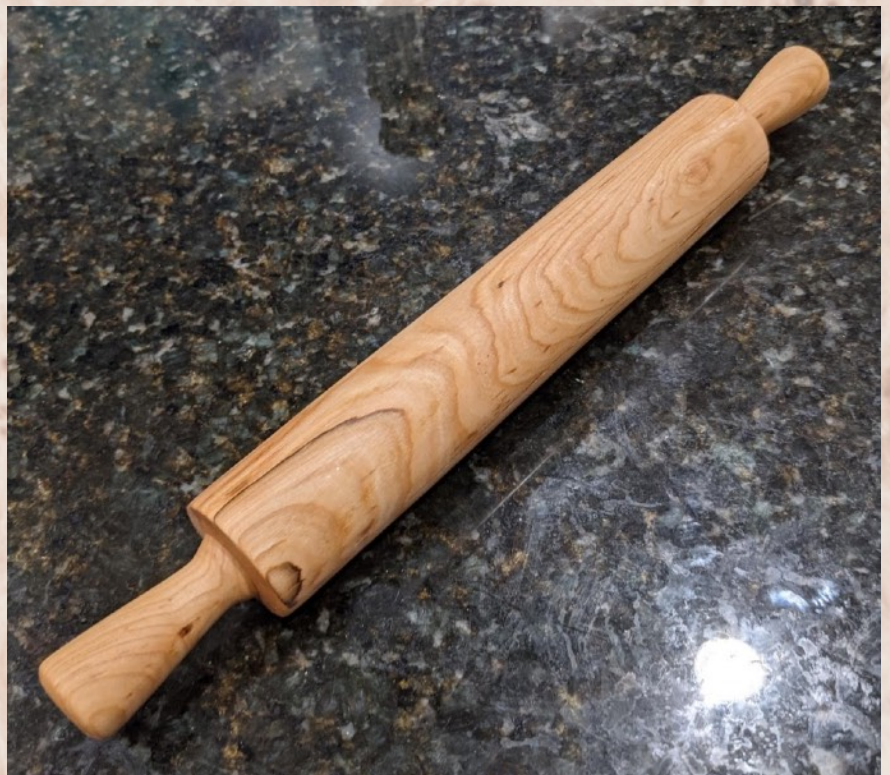
Joel Papera Cherry?? rolling pin 14.5" x 1.75" Doctor's Woodshop microcrystal wax bowl finish