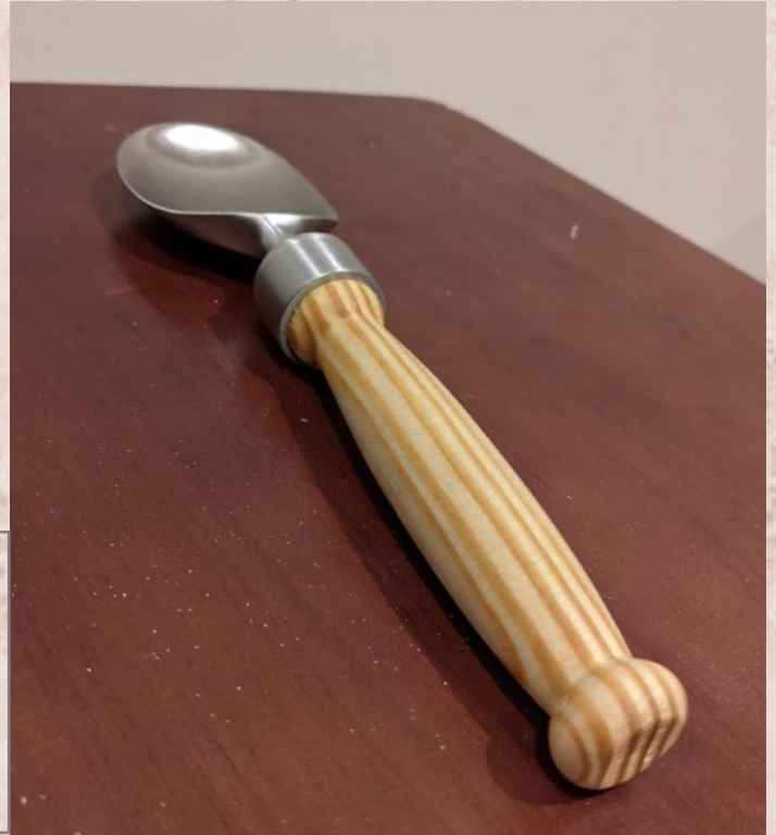
Joel Papera ice cream scoop handle 5" x 1.25" commercial wood unknown Doctor's Woodshop microcrystal wax bowl finish