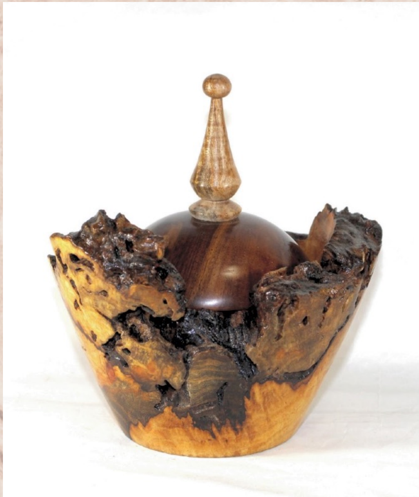
Joe Barnard burl box - 5.75" x 5.5" cherry burl, walnut lid, maple finial