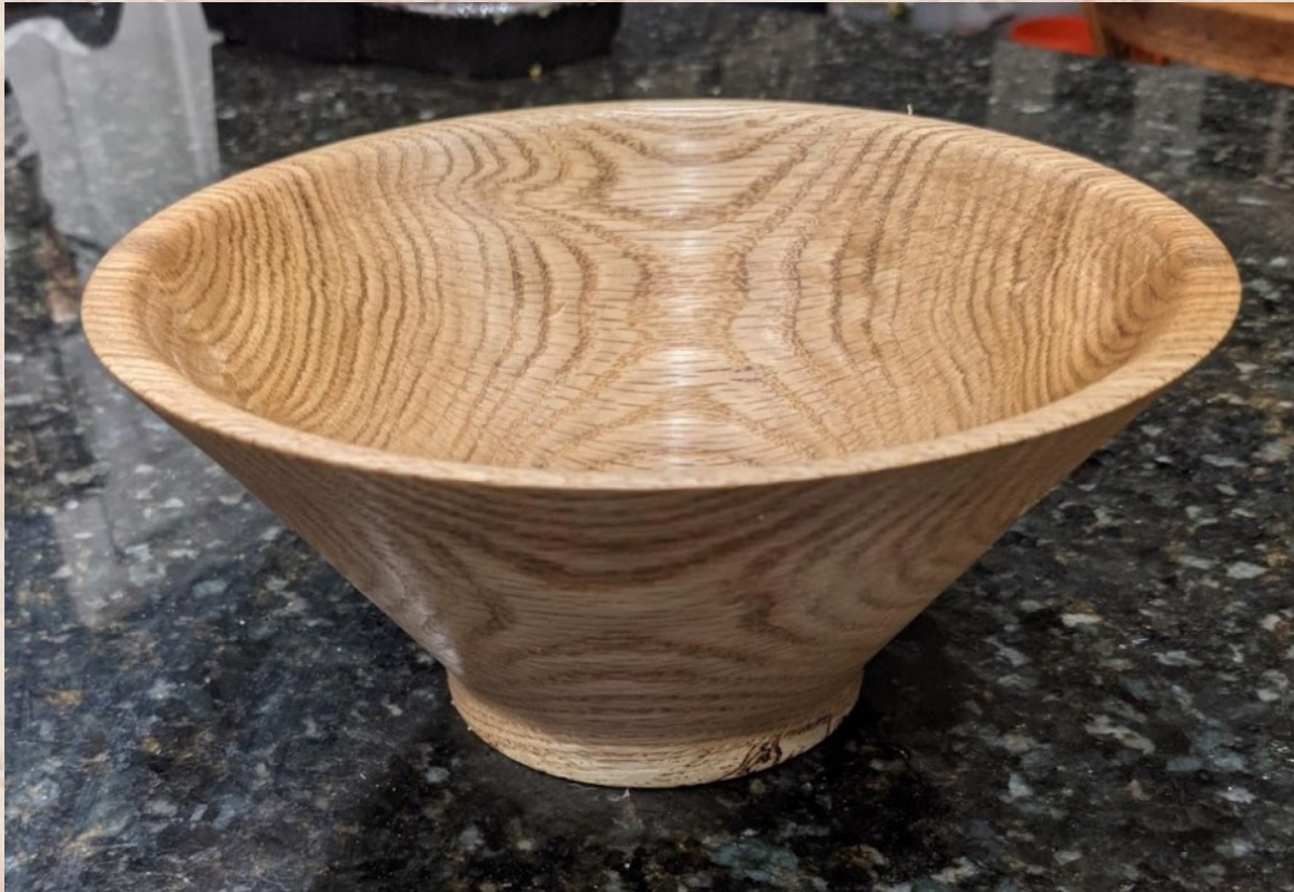
Joel Papera Oak bowl - 7.5" dia Doctor's Woodshop microcrystal wax bowl finish