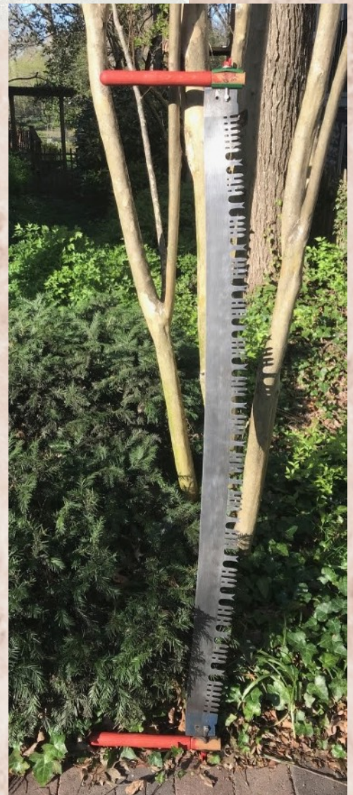
The Saw about 4.5 feet long with the red handles