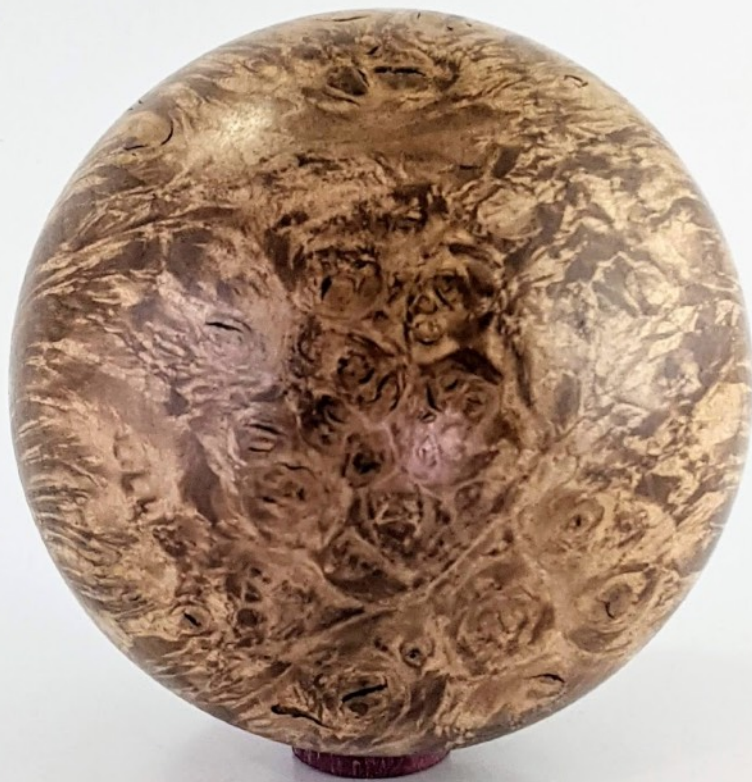
Gary Guenther "The Eyes Have It" sphere 3.75" diameter silver maple burl, TransTint dye sanding sealer (not totally finished yet)