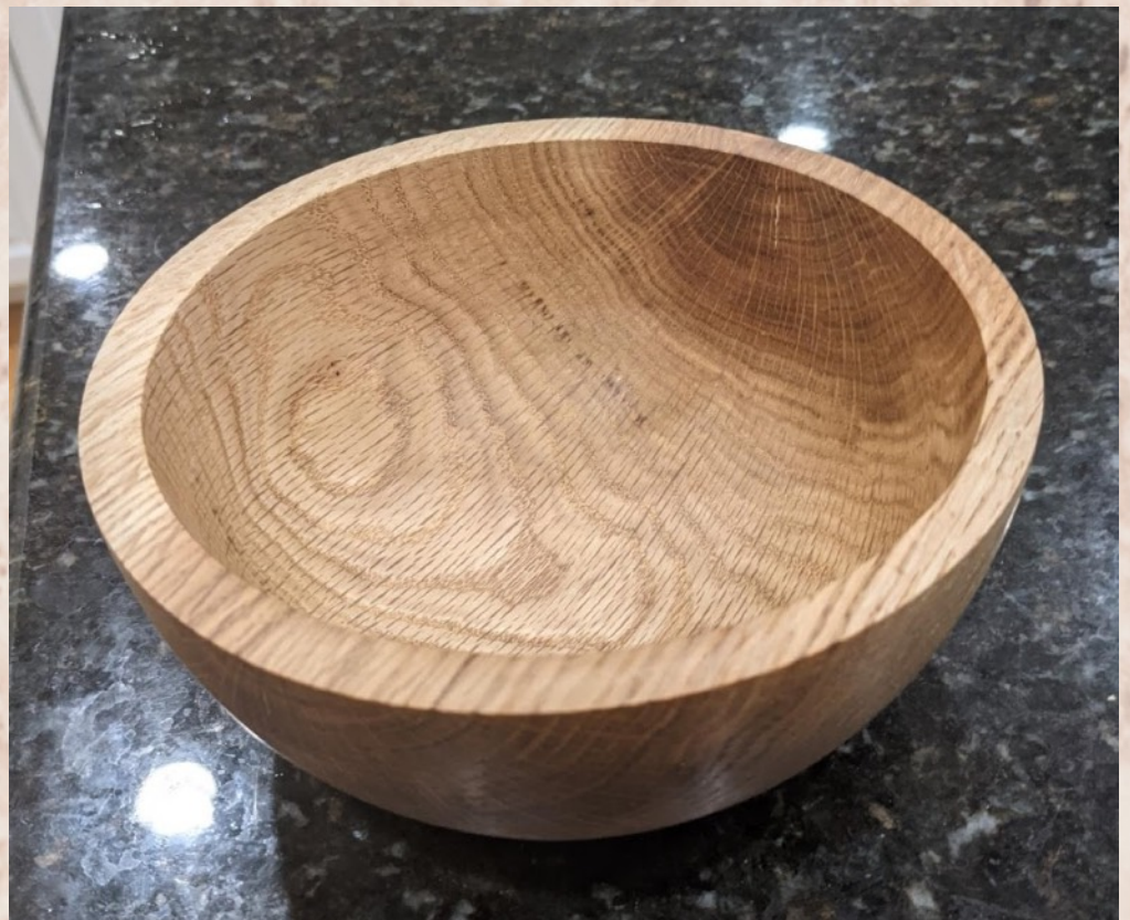
Joel Papera bowl 7" dia oak Doctor's Woodshop microcrystal wax bowl finish