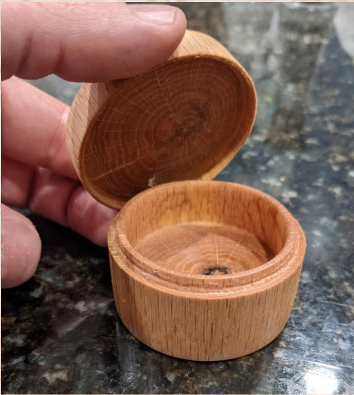
Joel Papera Oak box 2.25" dia Doctor's Woodshop microcrystal wax bowl finish