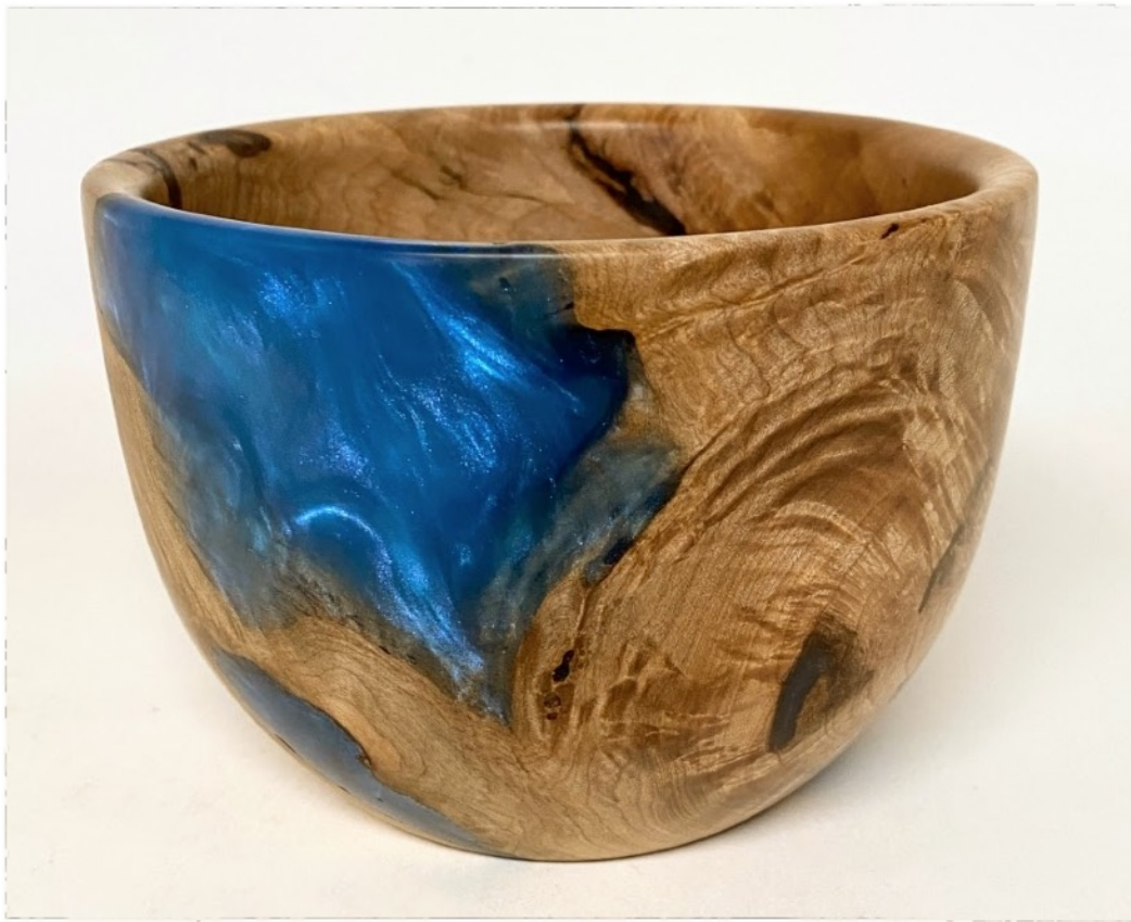
Mike Colella Bowl - Maple, blue resin 5"H x 4"D OSMO oil and buffed

Because of the round shape, the resin was done in 3 separate pours, each with special dams to hold the resin.