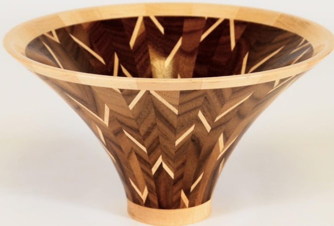
Ken Lobo "B Flat" Staved Vessel - 36 staves 5.5"H x 9.5"D Lamination of Walnut and Maple Sealed with Shellac, wipe-on- poly top coat