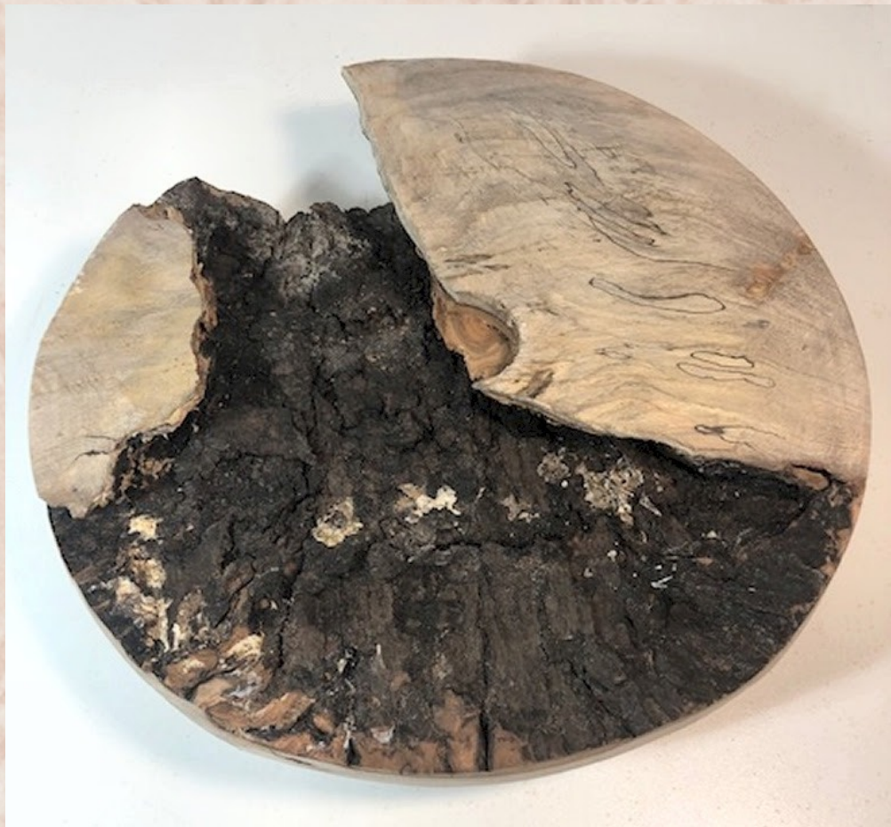
inside-bark- edge sculptural object hard maple