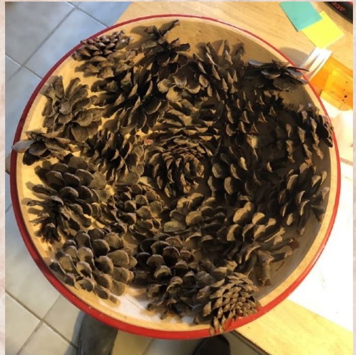
[blank preparation step 2 - fill with cut pine cones]