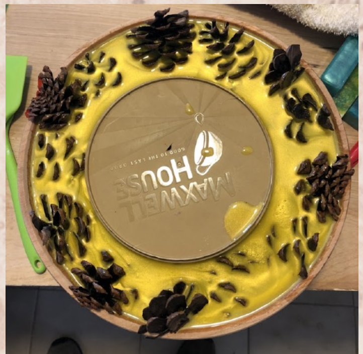
[blank preparation step 4 - pour yellow resin; then turn away the wood bowl mold]