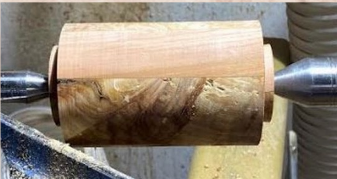
[turn glue up round and add tenons]