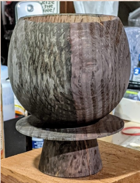
B) one coat of \text{FeSO}_4 , still wet, after being wiped on with a paper towel. Note that the effect differs on heartwood and sapwood

Gary Guenther **In Process -- not completed yet** winged pedestal cup titled "Jack" (because it's such a 'cracker') form copied from famed, mid-20th- century German/English potter Hans Coper 4.75" x 3.62" dia. spalted red oak (endgrain orientation) -- half heartwood and half sapwood unfinished