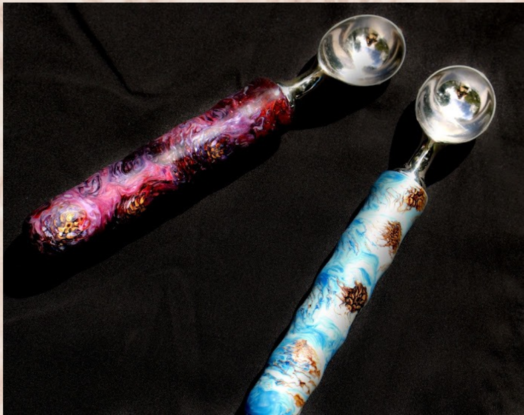
Joe Barnard ice cream scoops 9" x 1" epoxy resin with Colorado blue spruce cones embedded