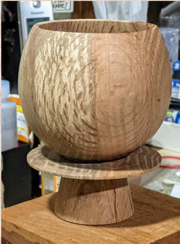
A) raw turned and sanded,

Gary Guenther **In Process -- not completed yet** winged pedestal cup titled "Jack" (because it's such a 'cracker') form copied from famed, mid-20th- century German/English potter Hans Coper 4.75" x 3.62" dia. spalted red oak (endgrain orientation) -- half heartwood and half sapwood unfinished