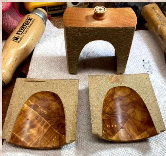
[the two halves of the 'body'; note the residual brown paper before sanding; also note the waste wood standing behind]