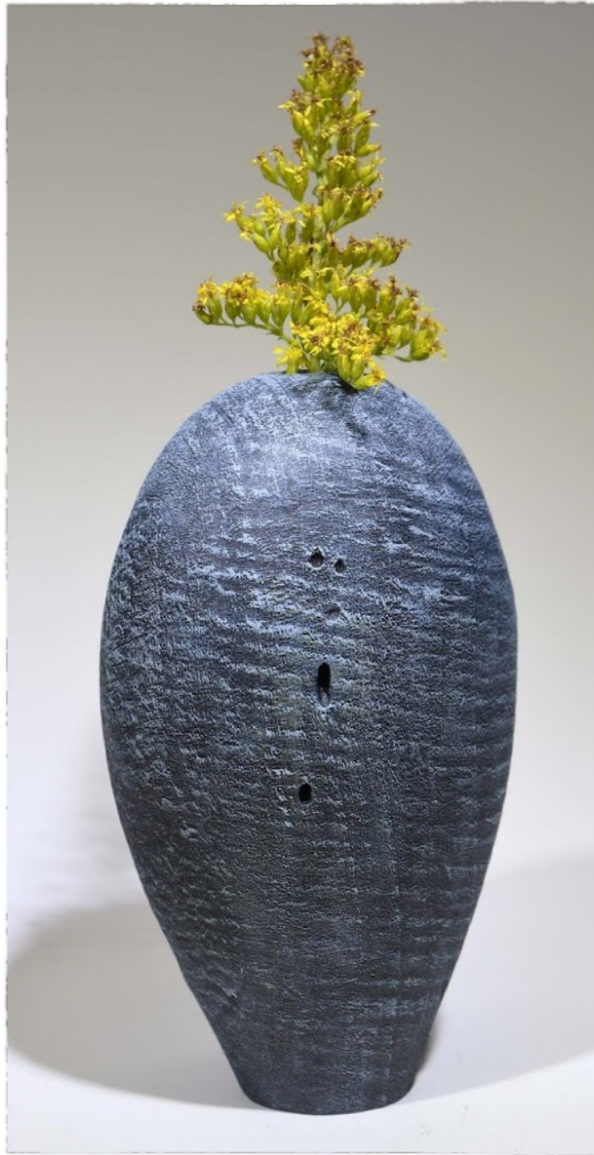
Duane Schmidt weed pot 5" x 3" x 2" red maple multiaxis burned, painted (acrylic)