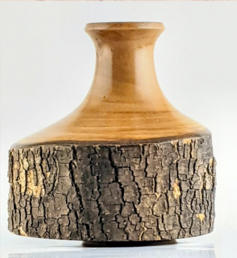
Gary Guenther "Naturally Off Center" pen holder or weed pot 3.5" (h) x 3.25" x 2.88" Bradford pear shellac finish