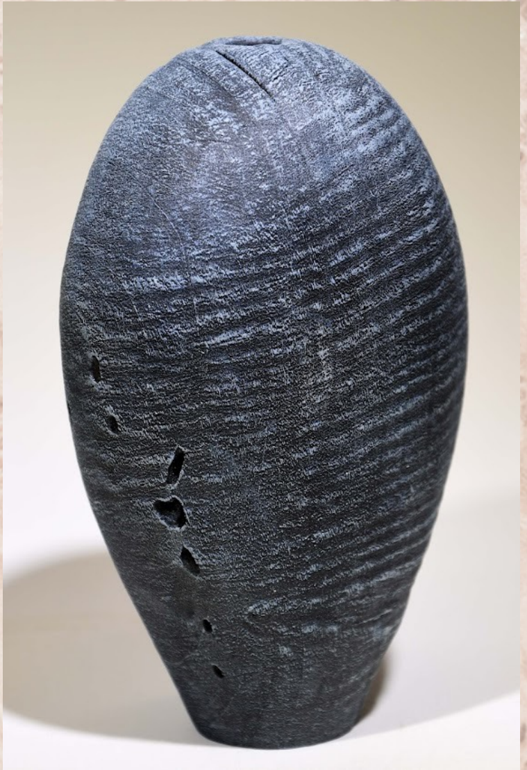
Duane Schmidt weed pot 5" x 3" x 2" red maple multiaxis burned, painted (acrylic)