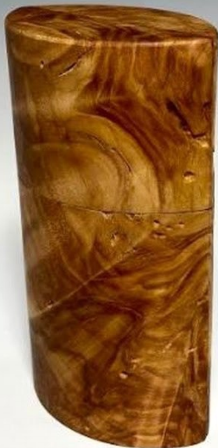
Jeff Struewing Lidded Box 4" x 2.5" x 1.5" maple burl "lost wood" process Linseed oil finish