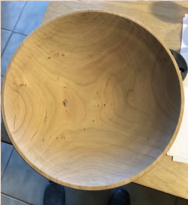
[blank preparation step 1 - turn a 'waste-wood' bowl]