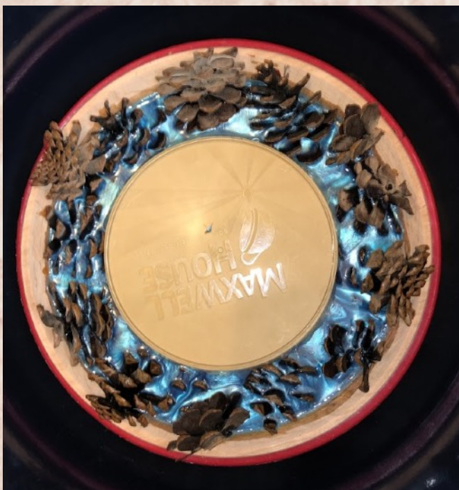
[blank preparation step 3 - pour blue resin]