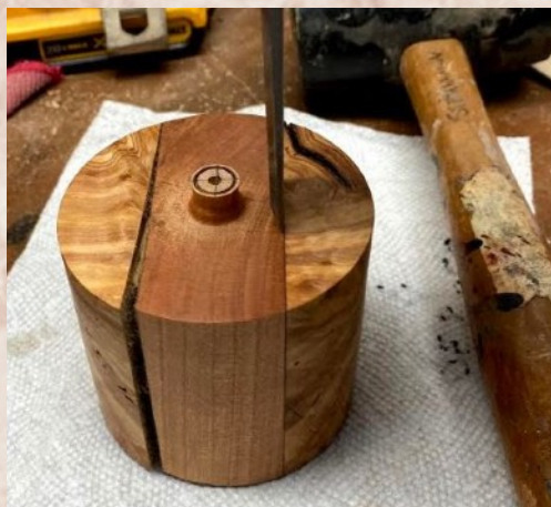
[splitting off the good wood from the waste]