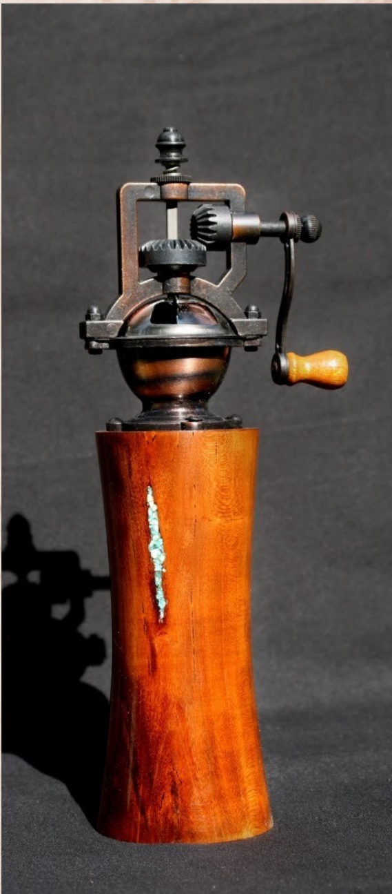
Joe Barnard pepper grinder 10" x 2.5" cherry with turquoise chips inlay