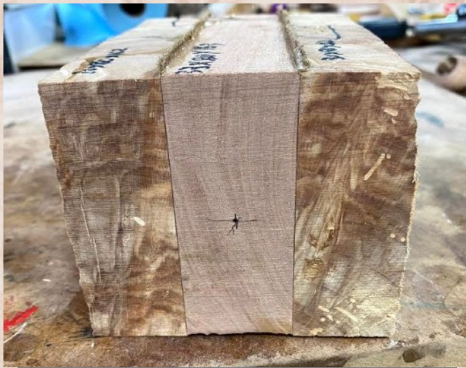
[glue up with waste wood in the middle]