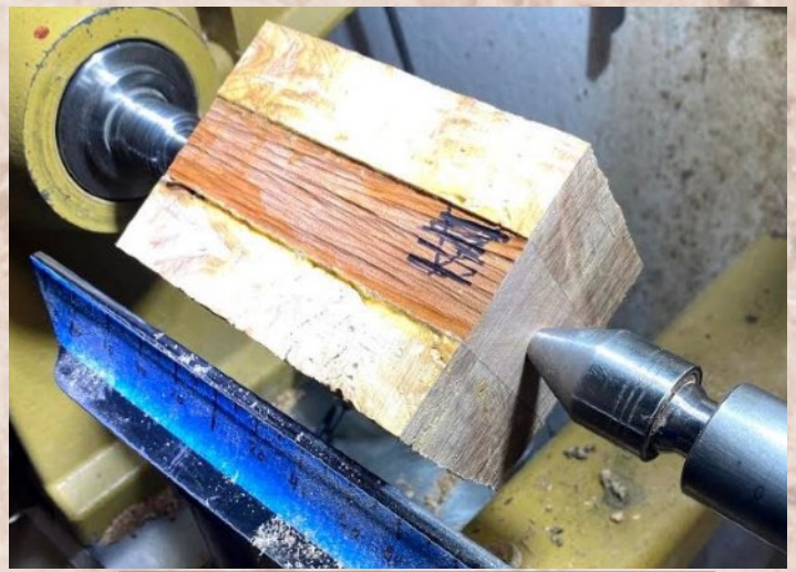
[mount glue up between centers]