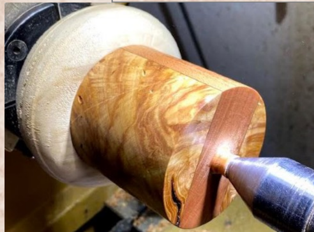
["body" section hollowed and jam chucked for turning bottom]