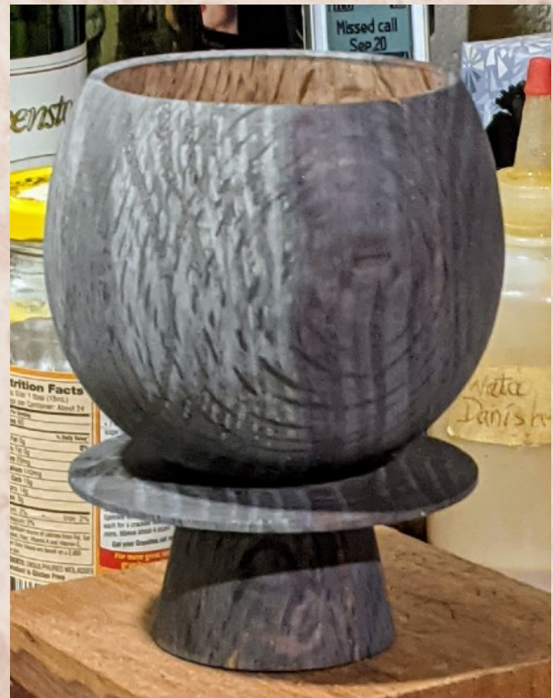
C) same one coat of \text{FeSO}_4 now dry (what a huge difference in color upon drying!)