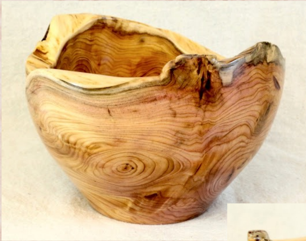
Paul Paukstelis natural-edge bowl - Yew 7" Dia kept hatchet and saw marks as texture