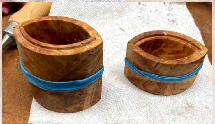
[hollowed 'body' and 'lid', being held for gluing with rubber bands, ready for finishing]