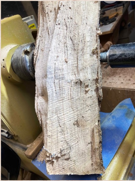
Duane Schmidt weed pot - 5" x 3" x 2" red maple multiaxis burned, painted (acrylic) [the raw material]