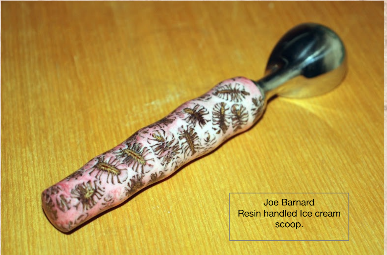
Joe Barnard Resin handled Ice cream scoop.