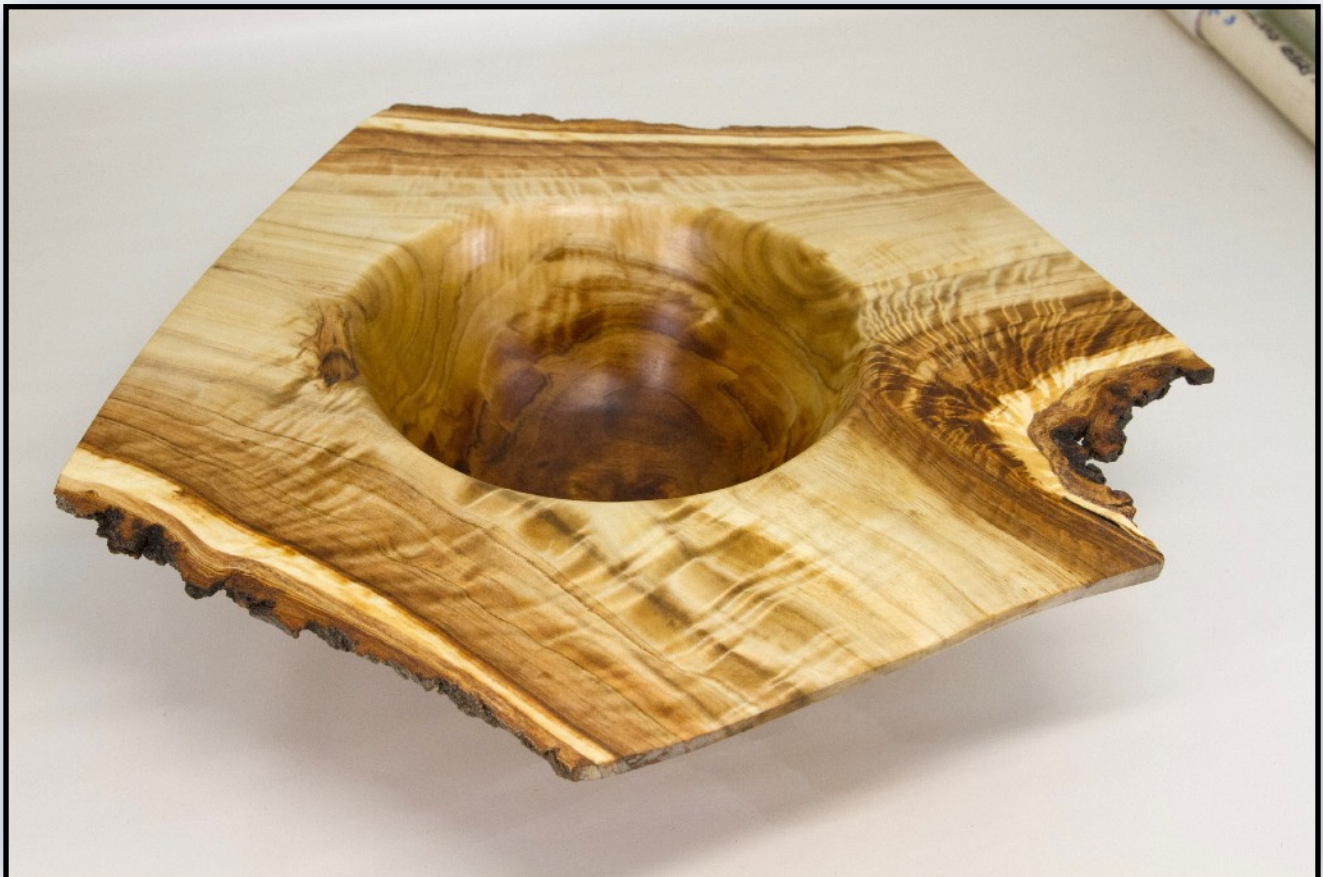
MCW Throwback - January 2016

We understand that some will want to come, and some will not. If you choose not to, please plan to attend by Zoom. We plan to make it interactive and participatory, so if you wish to attend from home, you can still hold up your works for ST&A in front of your cameras if you have good light. Please do not use fake, electronic backgrounds – that doesn't work for showing things. Mike will send out a Zoom link for the meeting a few days ahead of time. We hope to “see” you, one way or another. Let the fun begin! Onward!