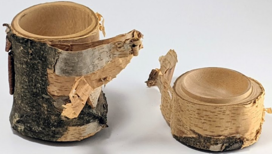
Gary Guenther box with natural bark and insets "Flapper II" 4-1/2"h x (2-1/2" - 4-1/4")w river birch and walnut birch finish: Watco Danish diluted with mineral spirits walnut finish: Watco Danish and RenWax