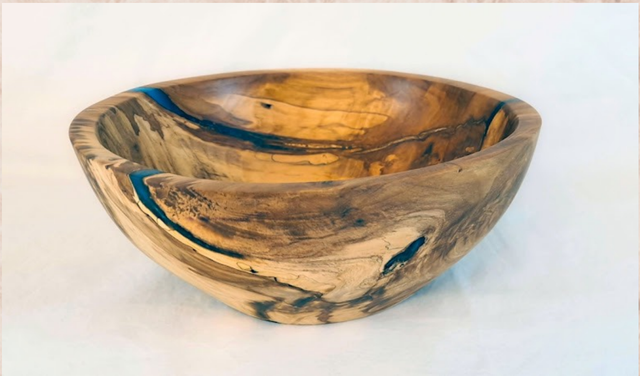
Paul Paukstelis Maple bowl with blue resin fill.