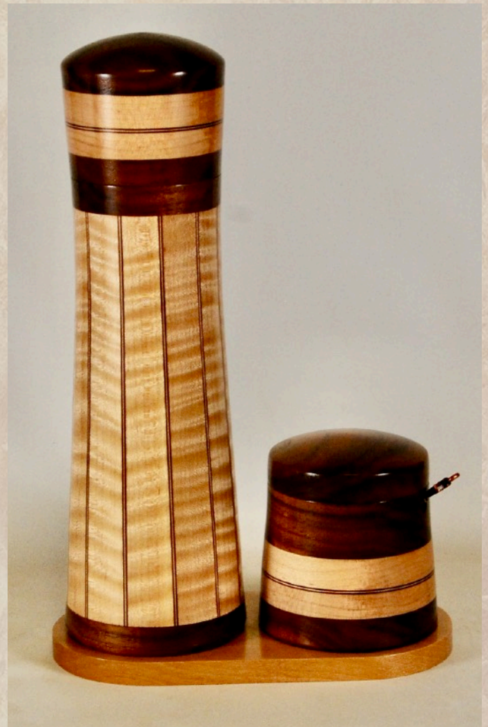
Ken Lobo Peppermill & Salt shaker Bloodwood, Purple Heart, Sycamore, Jatoba & Fiddleback Maple 9.5 H - Poly