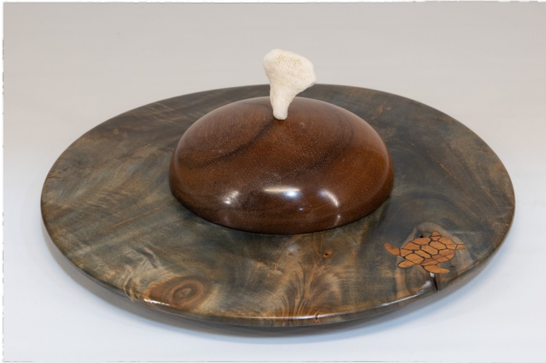
Tim Aley "Rock The Boat" Box 10 x 4 Maple & Koa, Choral