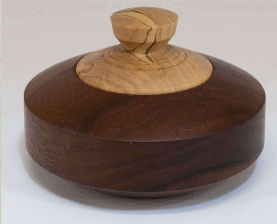
Unknown creator Lidded Box Walnut & Maple 2 x 4