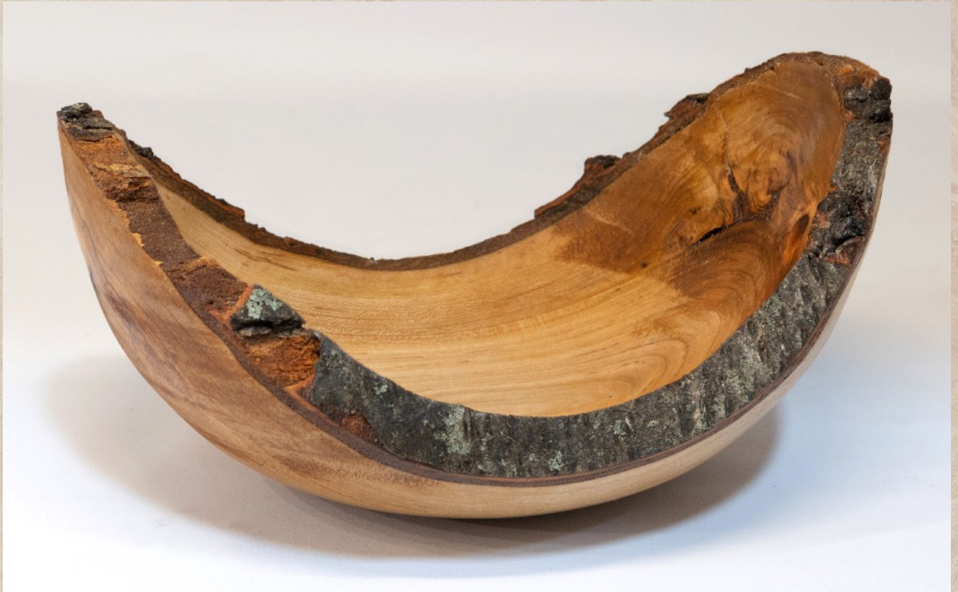
Chris Burns Black Locust Bowl, Live edge 3 x 8.25 x 6.25