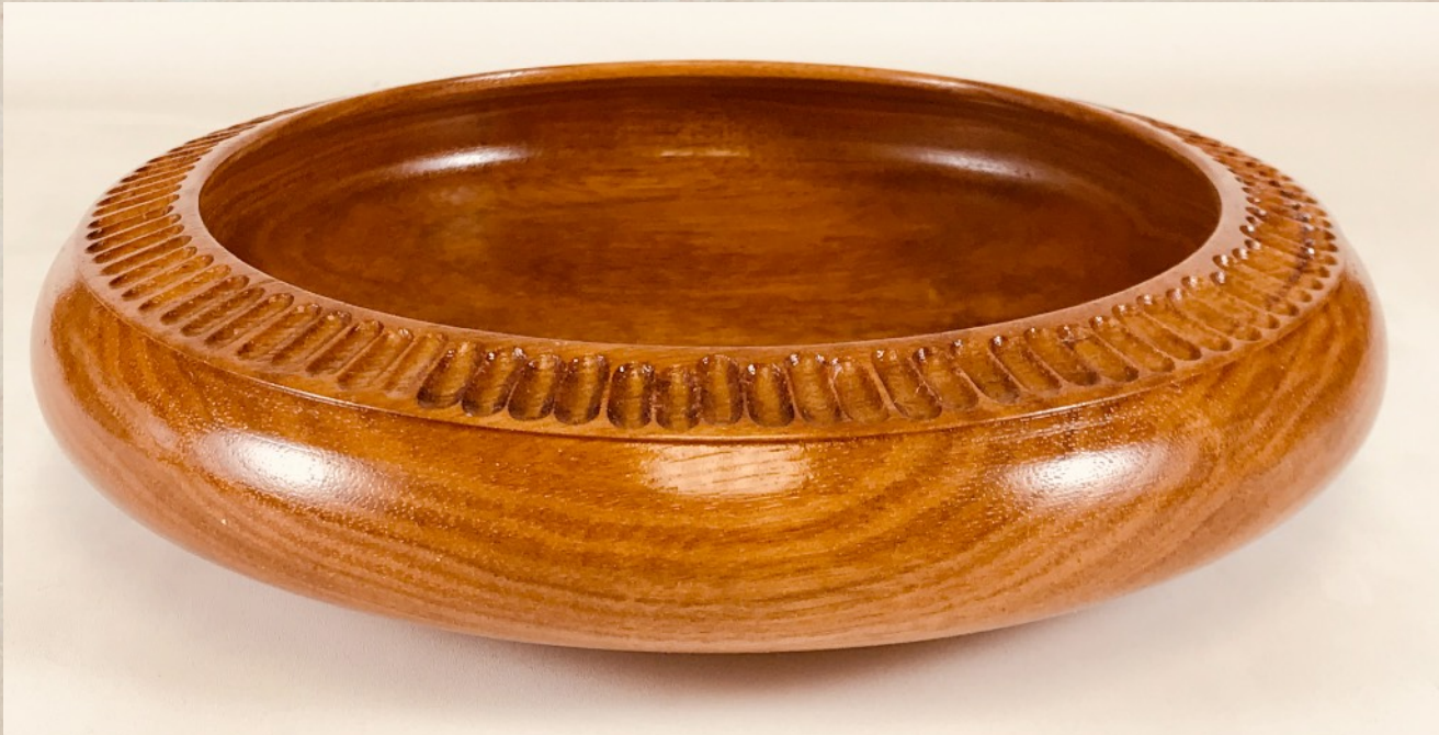
Ken Lobo Ornament Sepele & Maple inlays 4.5 x 1.5 - Poly