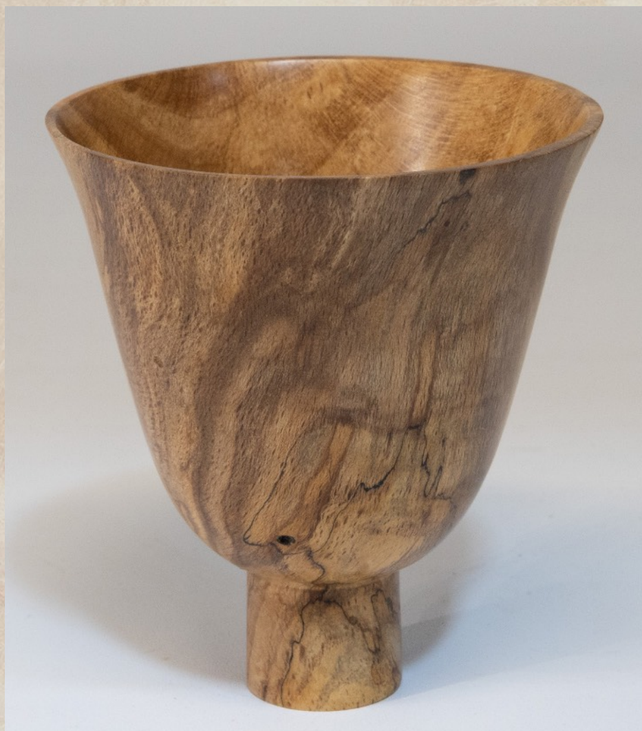
Gary Guenther "Riders in a Leaf Storm" 3.5 x 3.25 Dia. Red oak burl Deft clear - Gloss bruising lacquer Roughed by David Fry