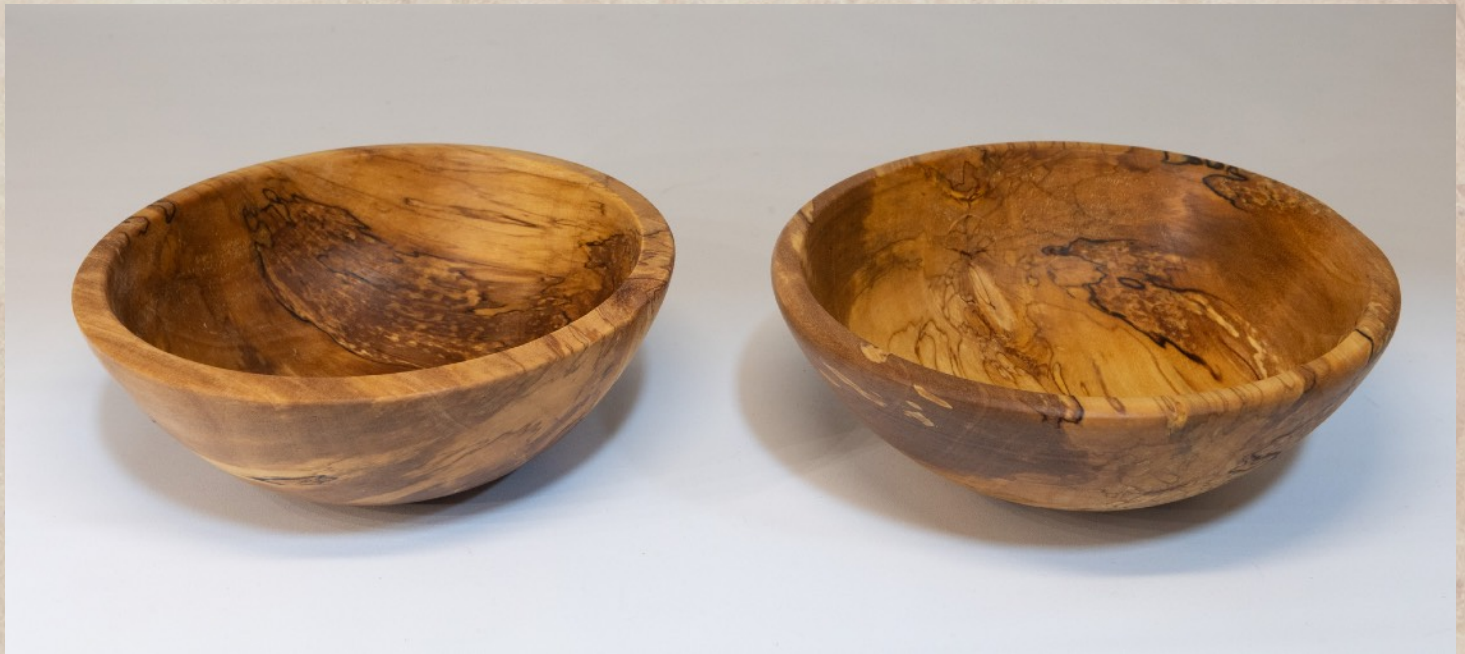
Bob Browning Paten & Chalice Spalted Cherry 7/8 x 6.75