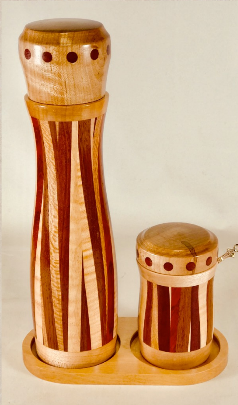
Ken Lobo Peppermill & Salt shaker Maple & Walnut 8.5 H Poly