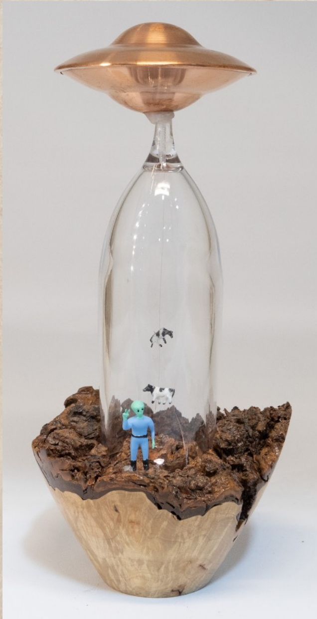
William Flint "UFO Abduction" Base 3" Red Maple Burl Copper, Glass & resin 9" Tall