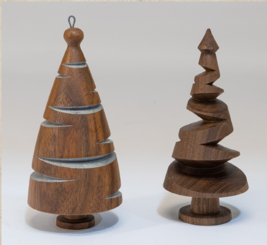
Duane Schmidt Multi axis ornaments 4 x 1.75 Black Walnut & Enamel