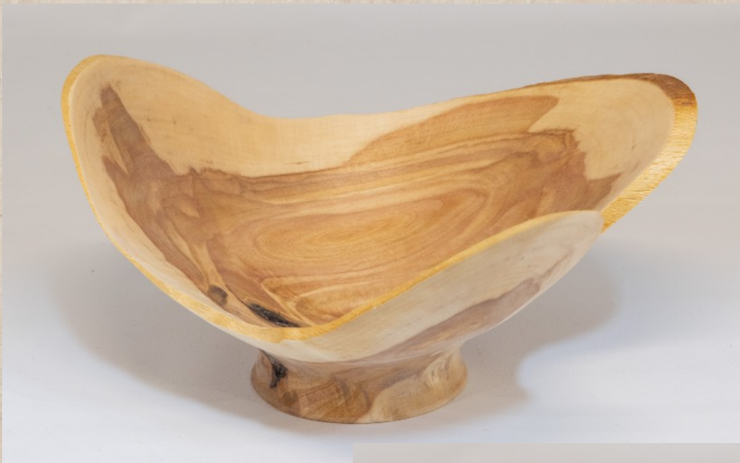
Tim Aley Heart Boat 7 x 3.5 Wood unknown