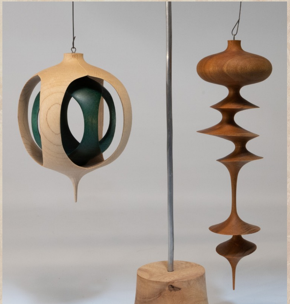
Duane Schmidt 2 Multi- Axis Ornaments 5 x 3.5 Maple & dye 8 x 2.5 Cherry, Danish oil