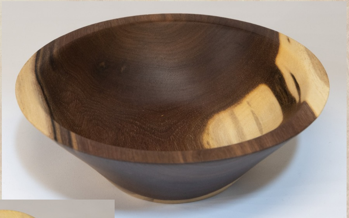
Paul Paukstelis Black Walnut 2.5 x 7