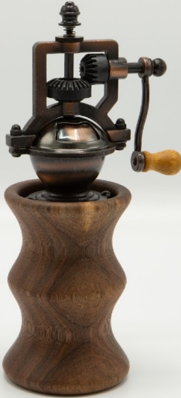
Roman Steichen - 8" x 3" pepper mill [walnut]