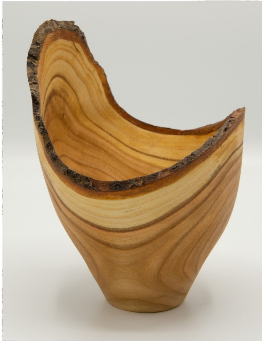
Bob Grudberg Natural-edge bowl Cherry ~ 8" x 5"