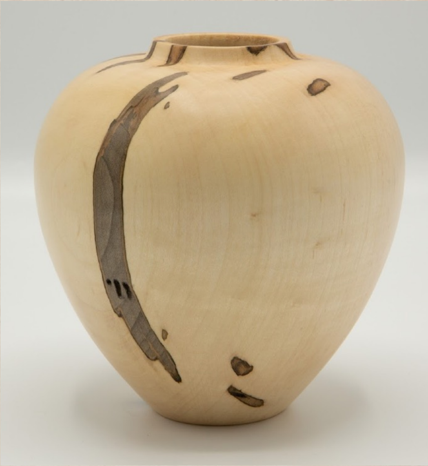
Tim Aley - 5-1/2" x 5" hollow form [maple]