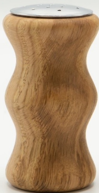
Roman Steichen - 3-1/2" x 2" salt and pepper shakers [oak, walnut]