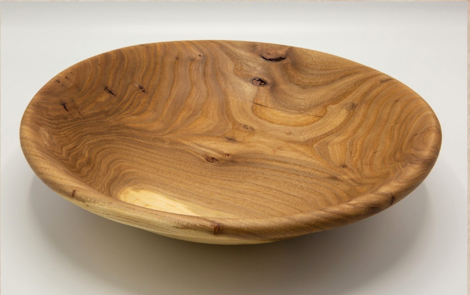
Paul Paukstelis - 4" x 13" shallow bowl [Siberian elm]