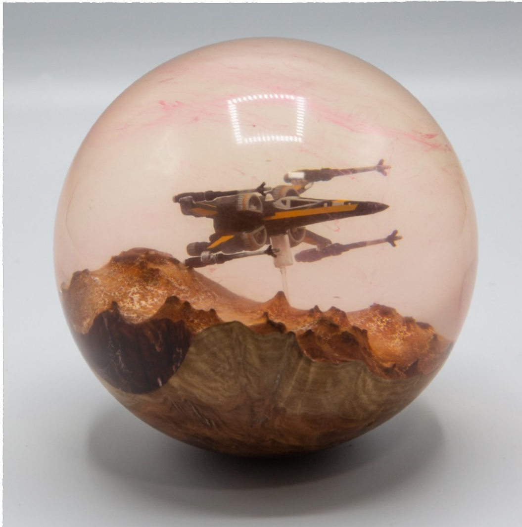
Matt Radki Maple Burl and epoxy resin 4x4