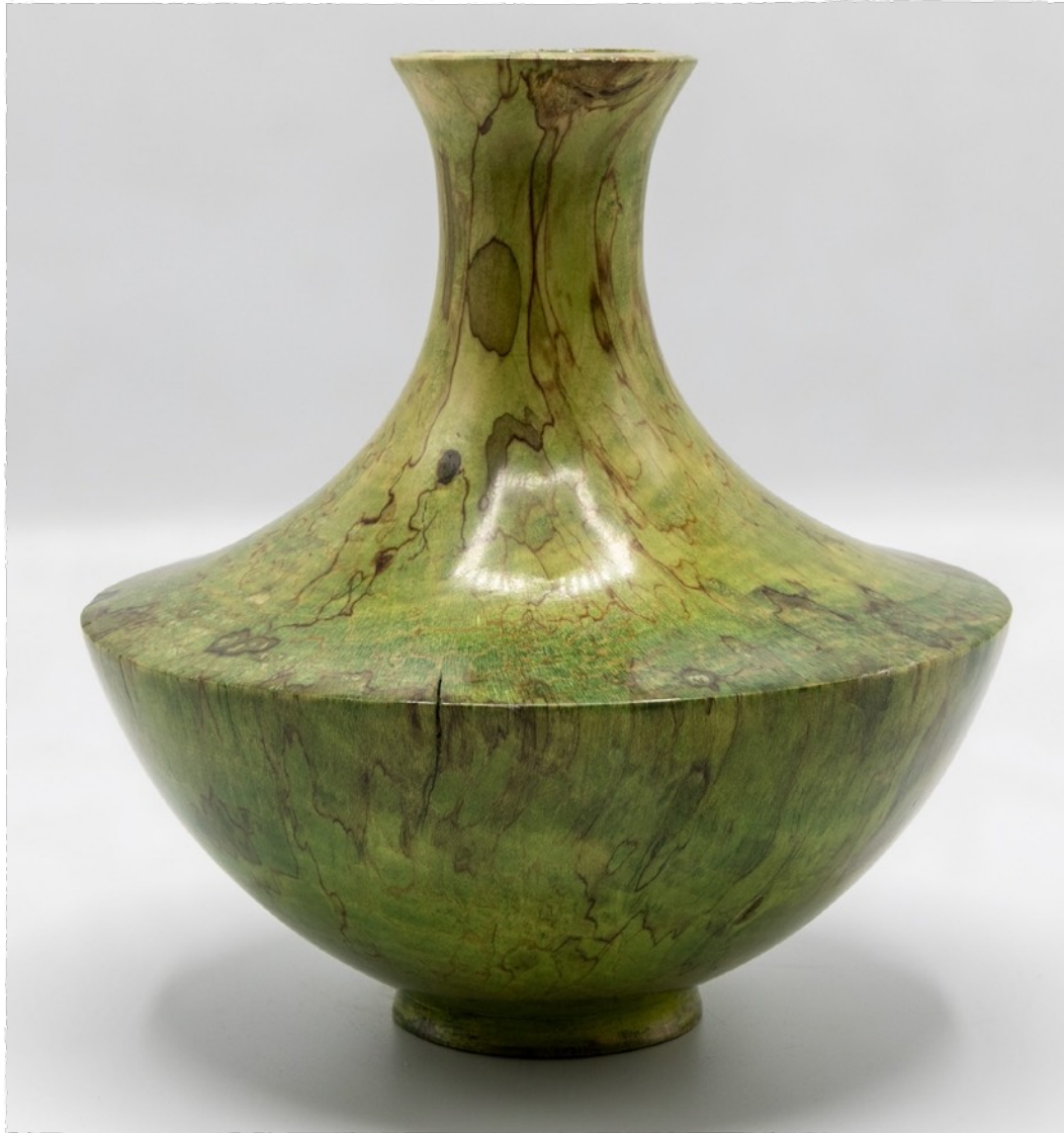
Steve Haddix Green colored Vase 6.4 x 5.5 Spalted Maple