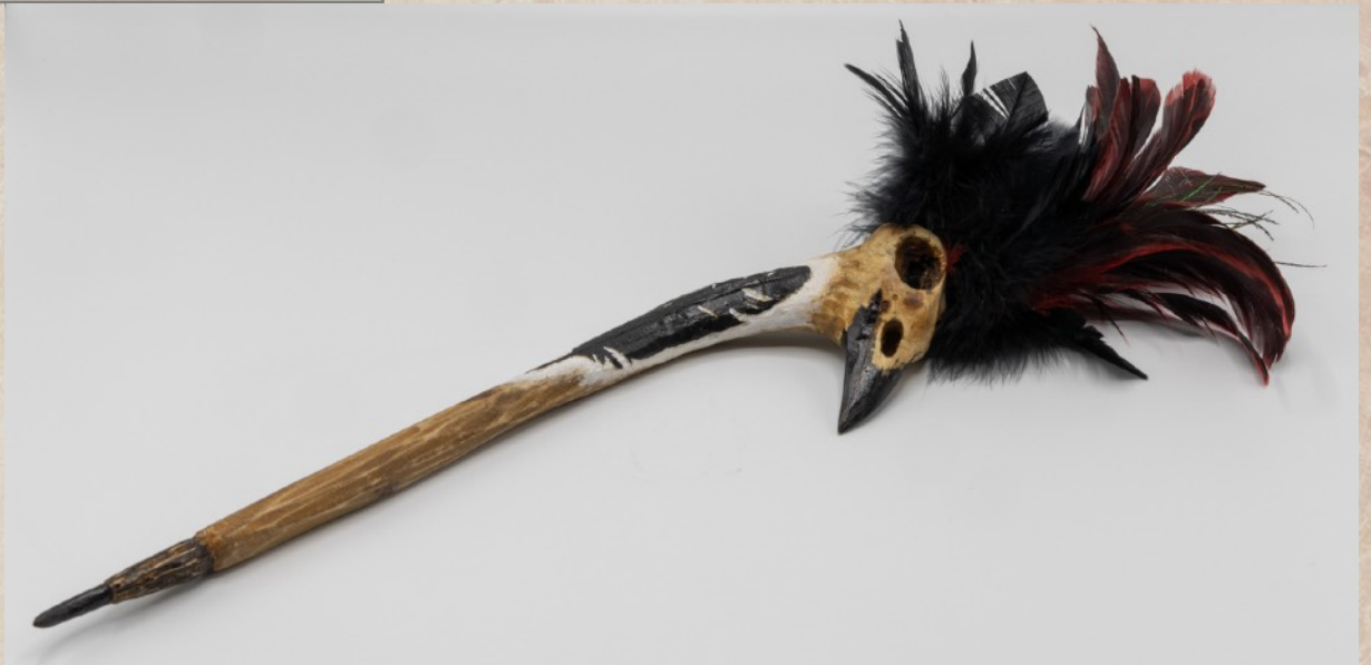
Joe Barnard Covid Wand - 16x 3x1 - Sycamore