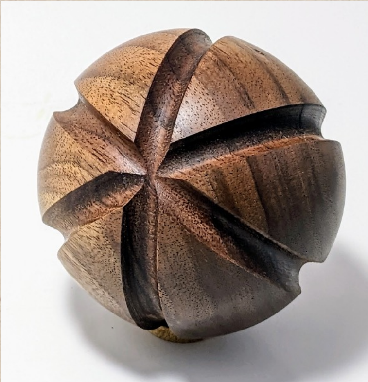
Gary Guenther sphere "Brosi I" 3" dia. - walnut Watco Danish Oil, Simoniz carnauba wax