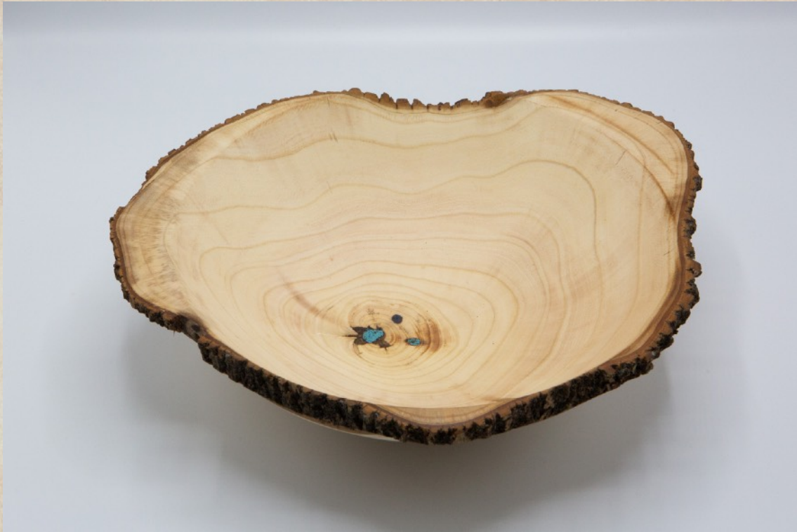
Richard Webster bark-edged bowl 4" x 13" honey locust