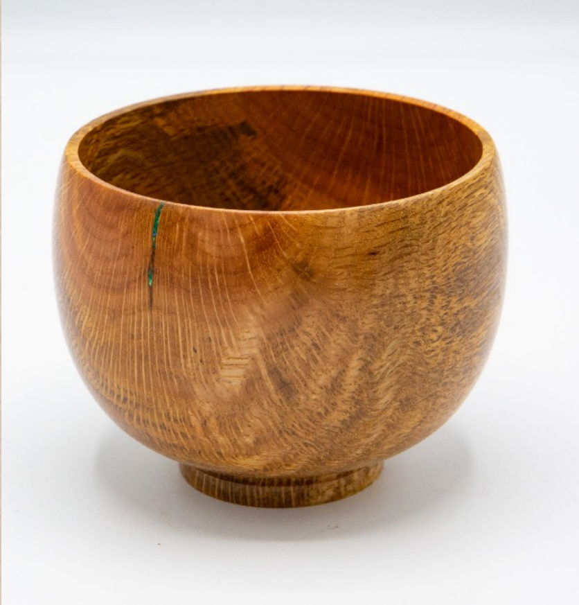
Gary Guenther tea cup (chawan) "Tea to Tea" 3-1/8" h x 4" dia. spalted, burly red oak, colored chalk Bush Oil, Simoniz carnauba wax