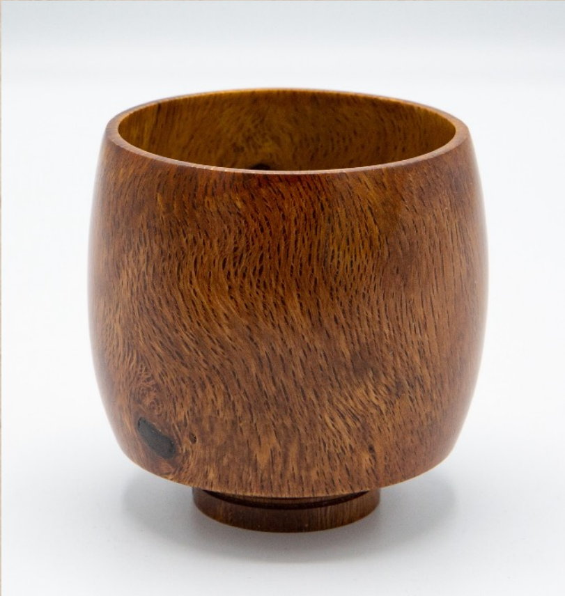
Gary Guenther cup (yunomi) "Jeff Live" 3-1/2" h x 3-3/8" dia. live oak, dye Bush Oil, Simoniz carnauba wax