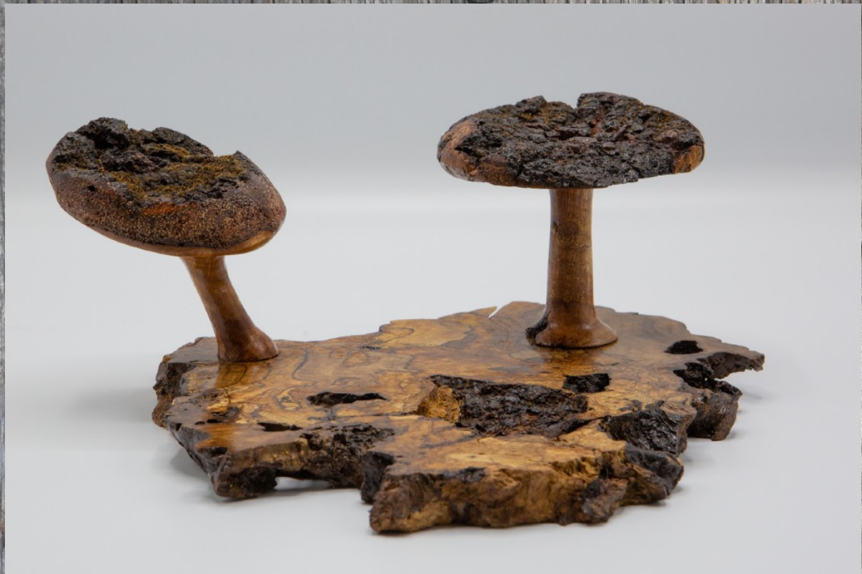
Dick Ratcliff mushrooms 9" x 12" oak burl