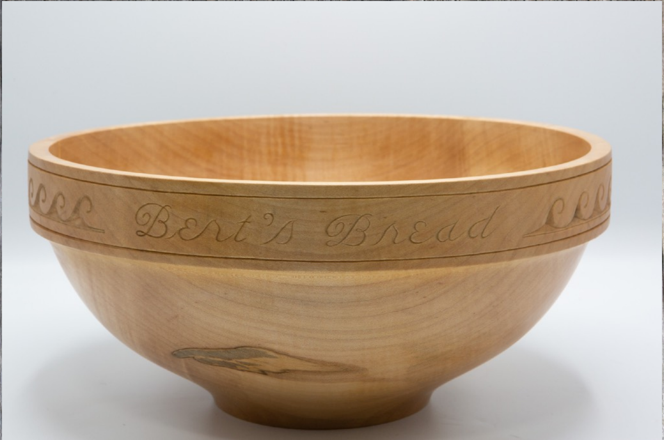
Margaret Follas bowl "Bert's Bread" big curly maple