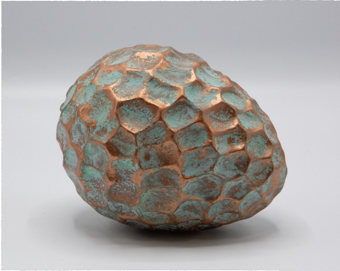
Steve Haddix Dragon egg 4" x 6" sycamore, color