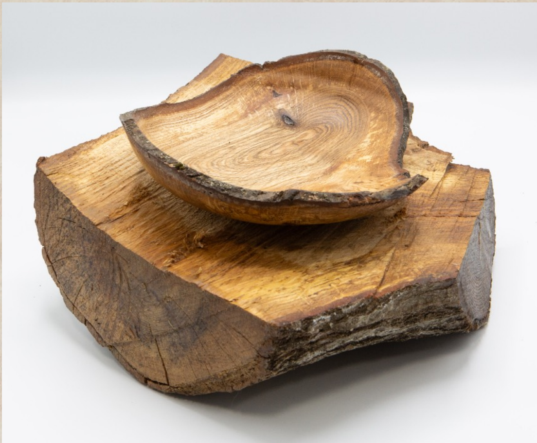
Chris Burns natural-edged, crotch bowl 2.5" x 10"