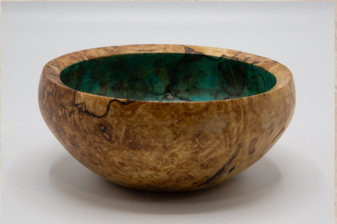
Joe Barnard namaste burl bowl 2-1/2" x 6" cherry burl, dye