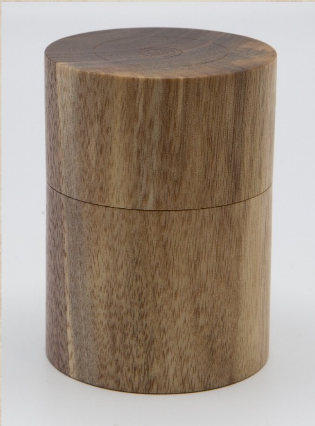
Jeff Struewing lidded box 3-1/4" x 2-1/2" walnut