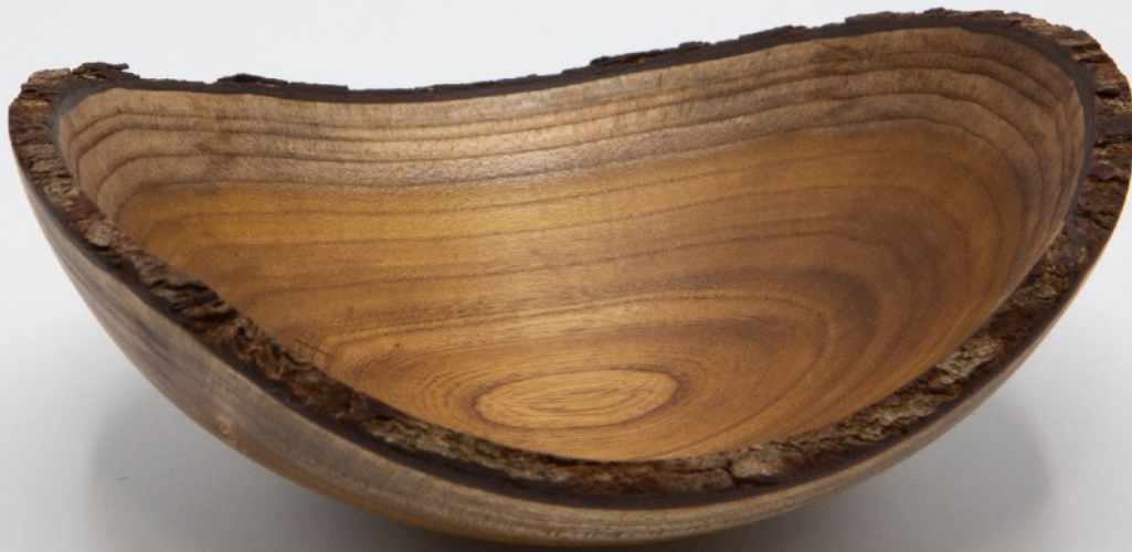
Rick Ellsbury lidded box 4-1/2" x 2-1/2" unknown wood