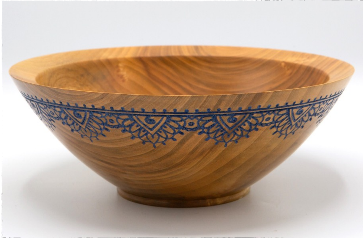
Paul P Bowl 6" x 10" CNC carved design and resin filled