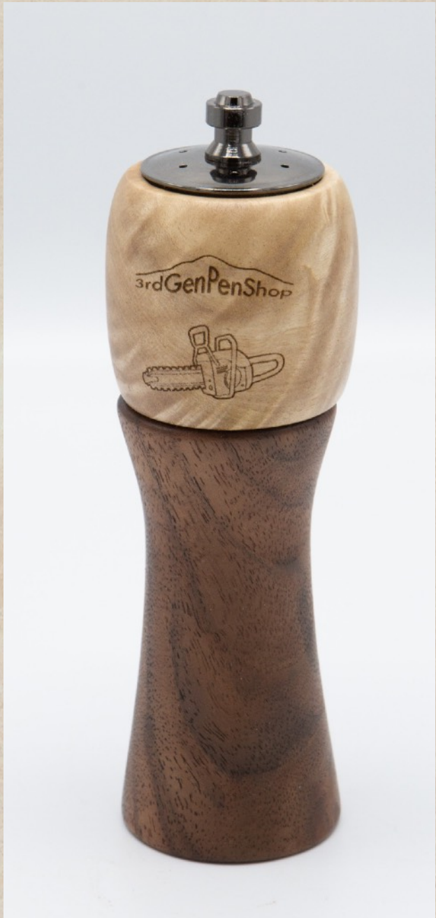
Roman Steichen peppermill / salt shaker combo "I'm Sorry, Claire" 6-1/2"x 2" claro walnut