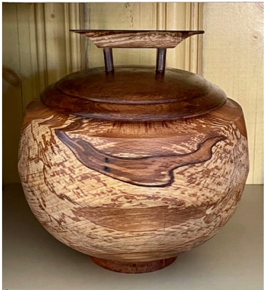
Andrew Bennett Closed Form, 2024 Spalted beech bowl and cherry foot, 6" x 5" finished with Danish oil.