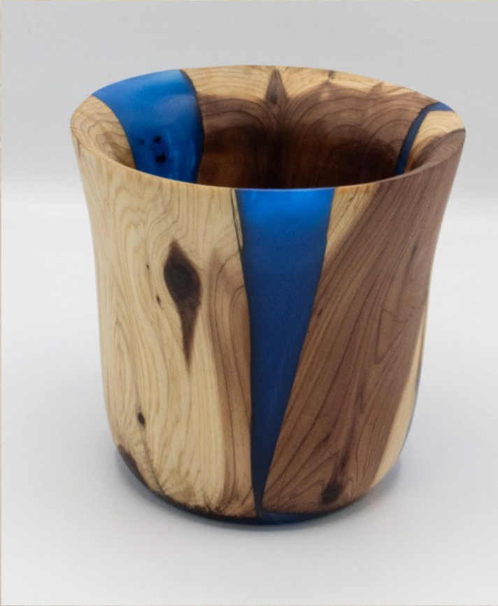
Joel Pepera (guest and member-to-be) bowl roughly 9" h x 6" dia. Eastern red cedar, resin