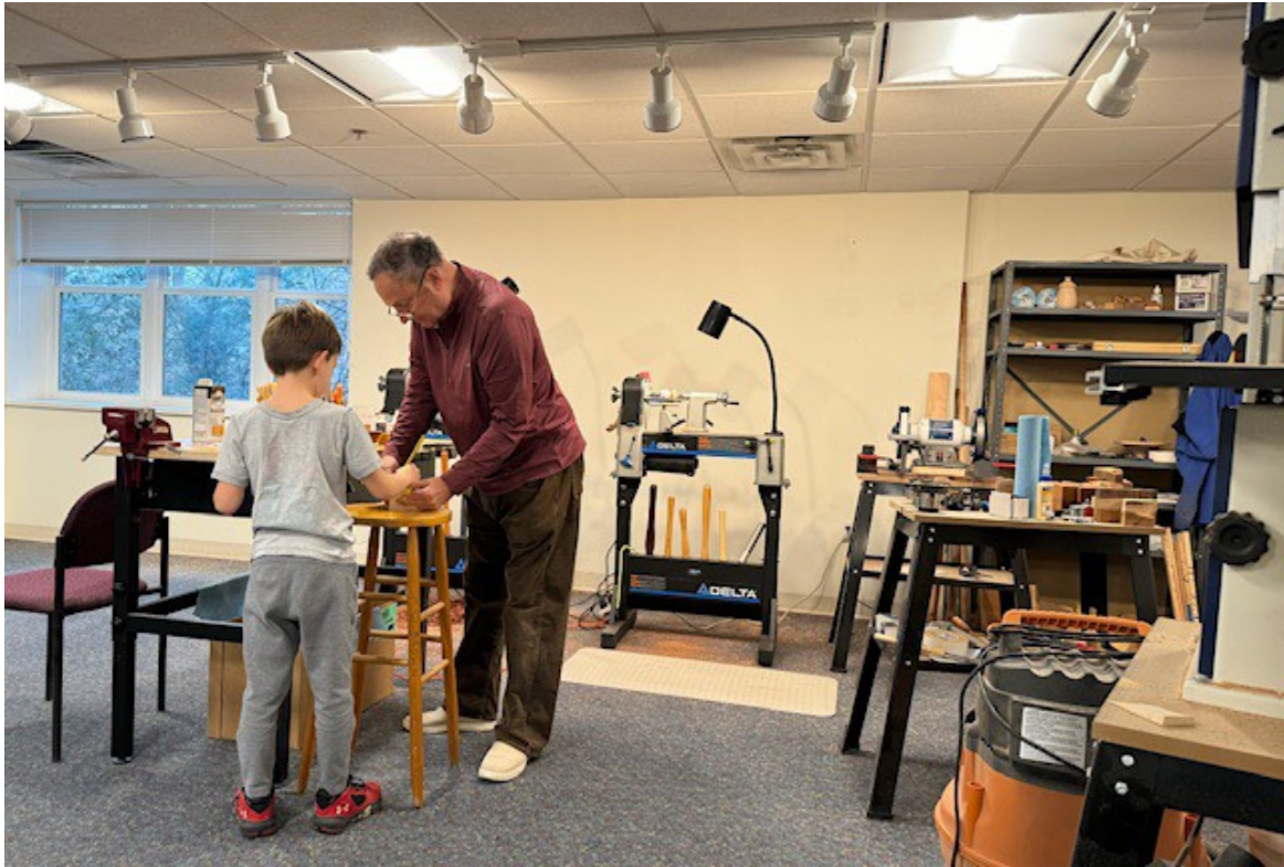
Teaching the ropes to a grandson.