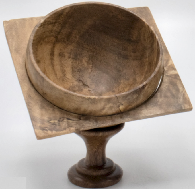
Joe Barnard bowl with rotating square ring, on stand maple, cherry stand