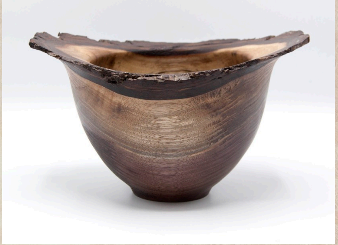
Richard Webster bark-edge bowl 6"h x 10" dia. walnut