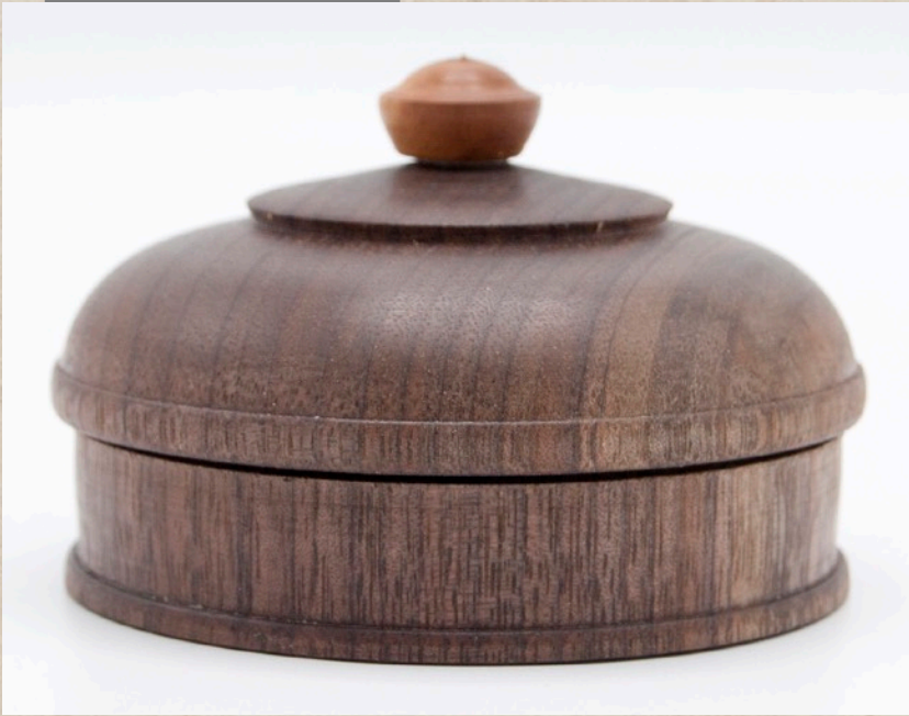
Eliot Feldman box 2" h x 3-1/2" dia. walnut