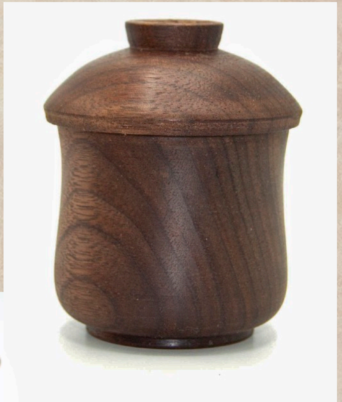
Eliot Feldman box 3" h x 2" dia. walnut