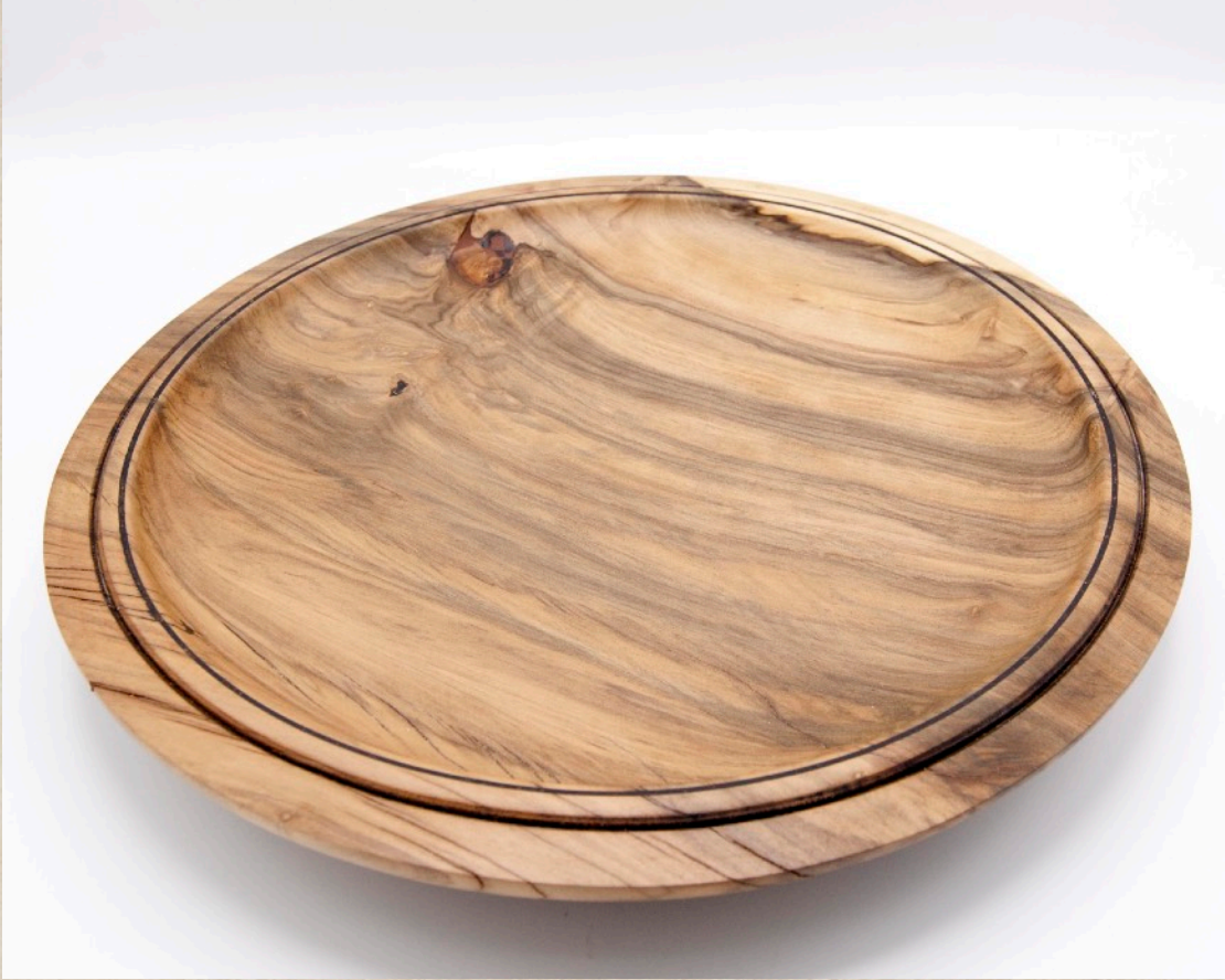
Richard Webster lazy susan platter 3" h x 15" dia. English walnut, rotary mechanism