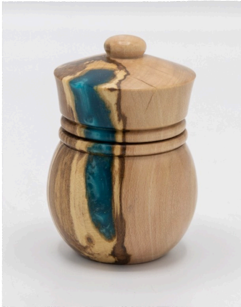
Jeff Struewing Small Maple box With resin