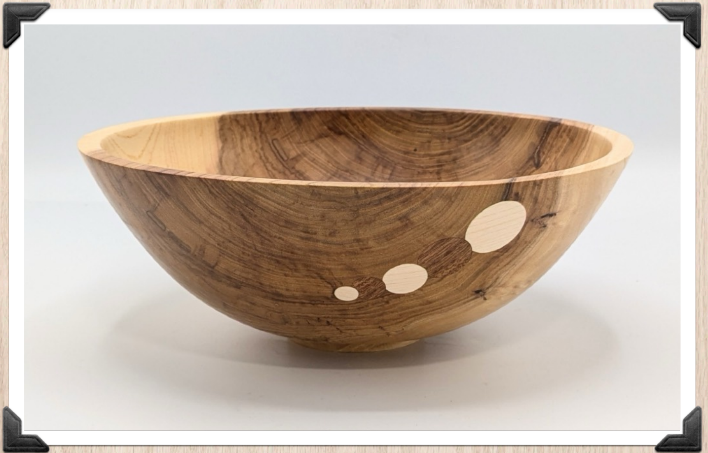
Paul Paukstelis bowl with bubble patches elm branch