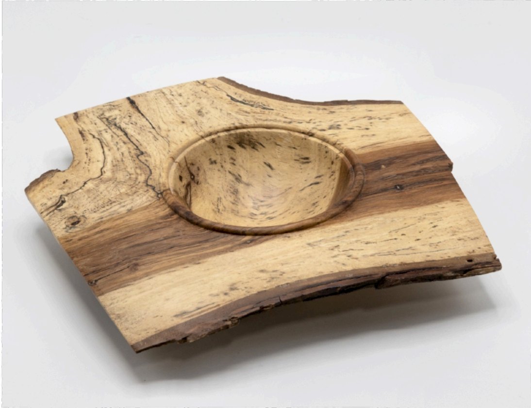
Gary Guenther bark-edged, winged bowl with feet "Pants" 1-1/2" x 9" x 9" spalted historic pecan