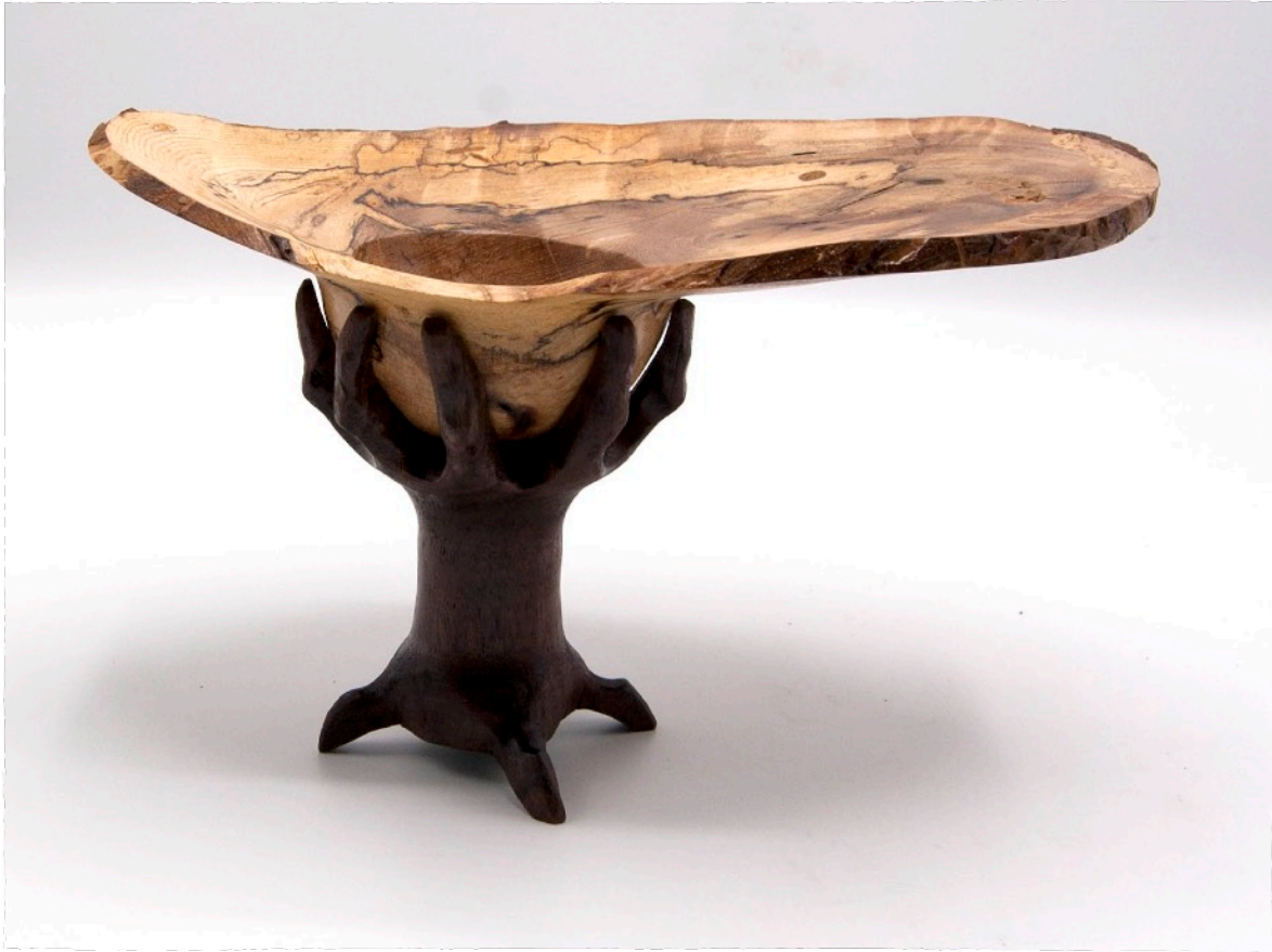
Dick Ratcliff natural-edge bowl and stand 6"h x 9" w spalted hickory, walnut