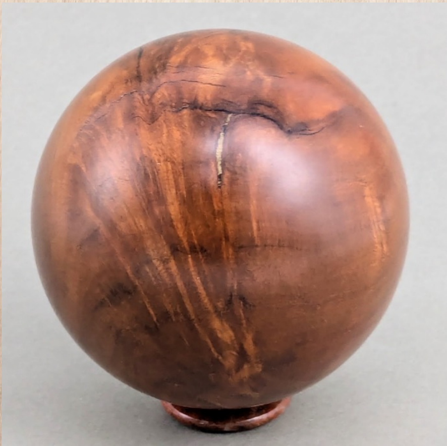
Gary Guenther sphere 3-1/4" dia. figured cherry, brass powder