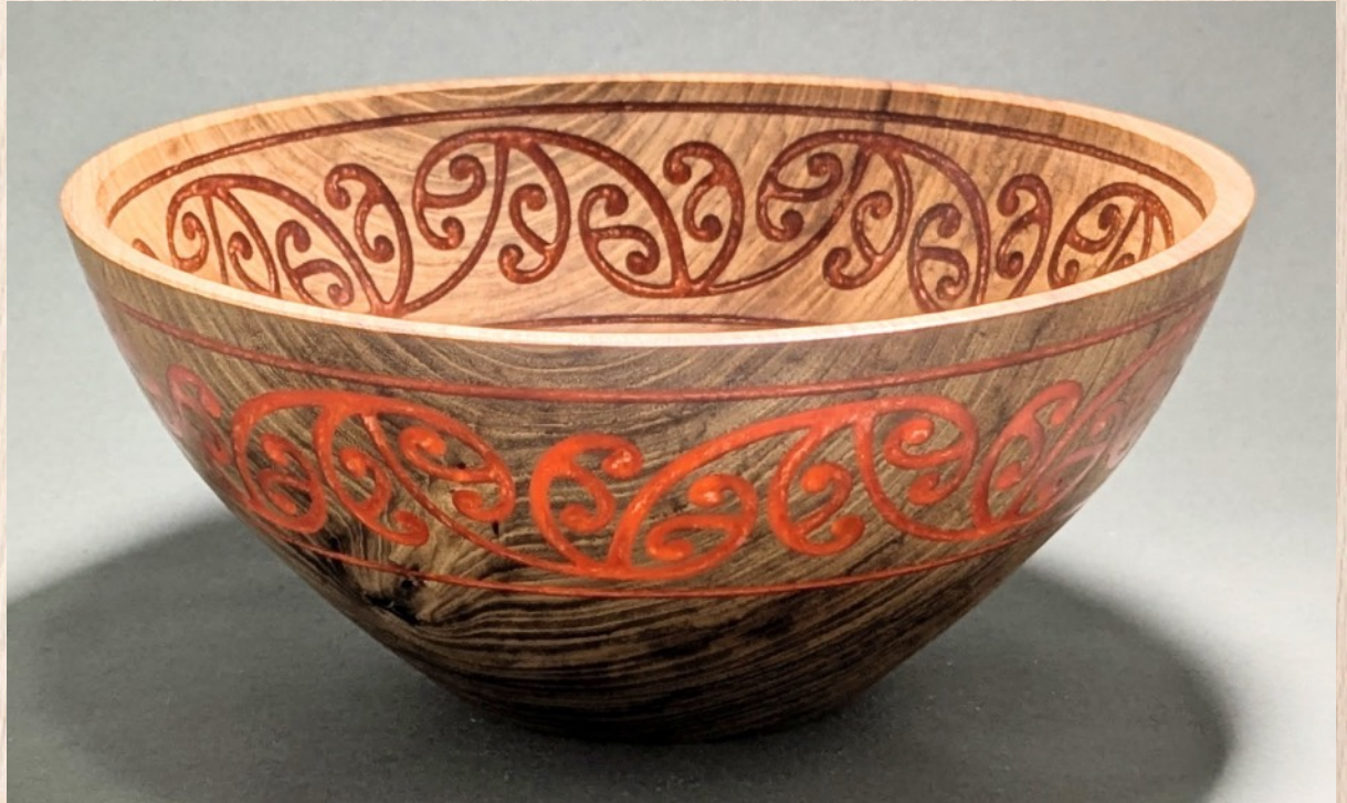
Paul Paukstelis bowl with design patterned on LatheEngraver 4" h x 7" dia. American elm, resin