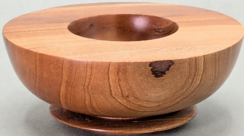
Gary Guenther wing-footed bowl 1-3/4" h x 4-1/4" dia. spalted wild ornamental cherry, brass powder, ceramic flower insert