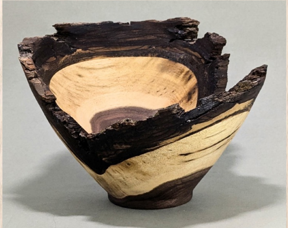
Tim Aley bark-edge bowl 6" h x 8" x 7" walnut