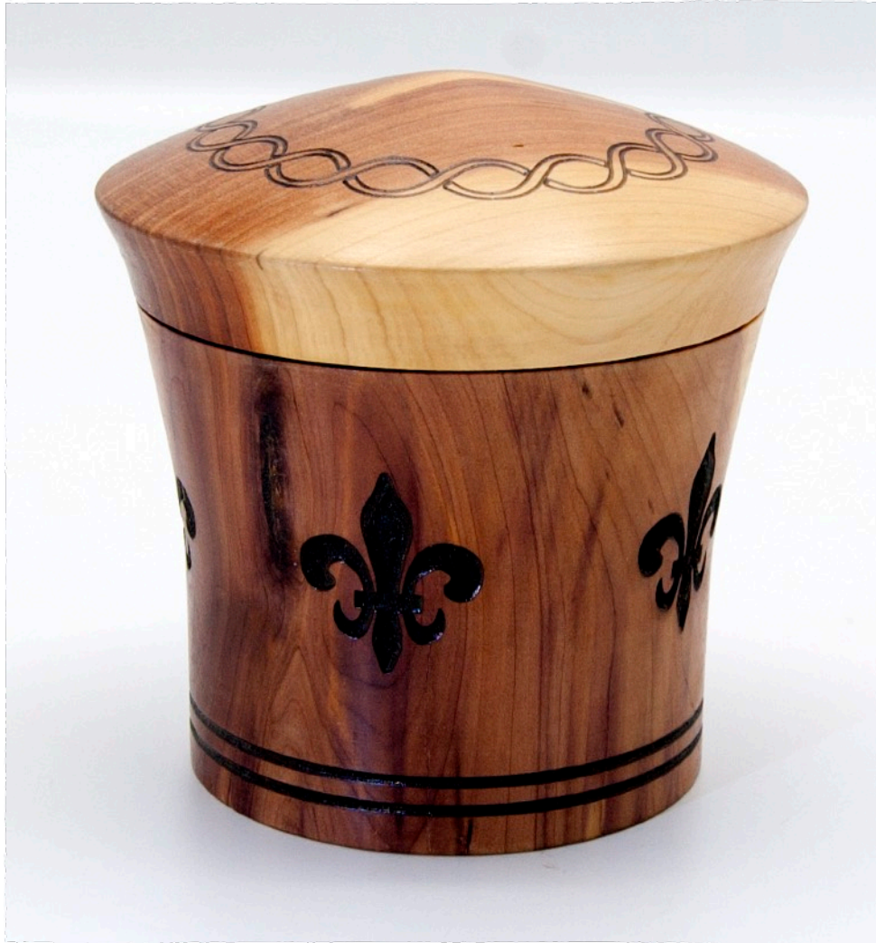
Len Deerkoski box 4" h x 6" dia. Eastern red cedar decorated on LatheEngraver