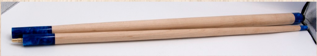
Roman Steichen collapsible pool cue chucks 3" h x 1-3/4" dia. resin with metal inserts