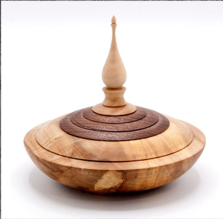
Jeff Gilbert box 6" h x 6" dia. maple, walnut