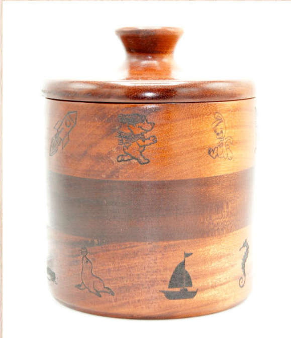
Len Deerkoski Beads of Courage box 9" h x 8" dia. walnut